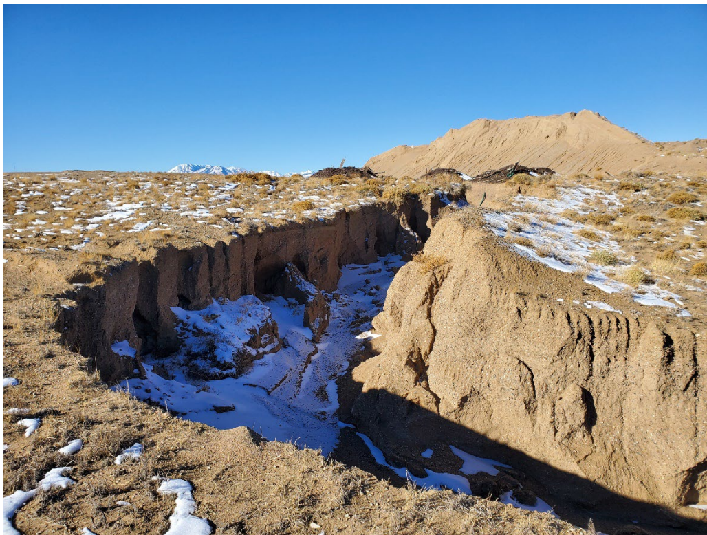
Photo 2: Looking west at substantial erosion gully located in northeast corner of the Phase I(a) permit area.