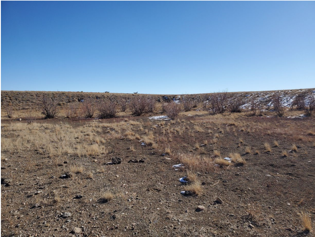
Photo 7: Looking southeast at Tamarisk established in the Phase I(b) permit area, and at erosion rills on the slope.