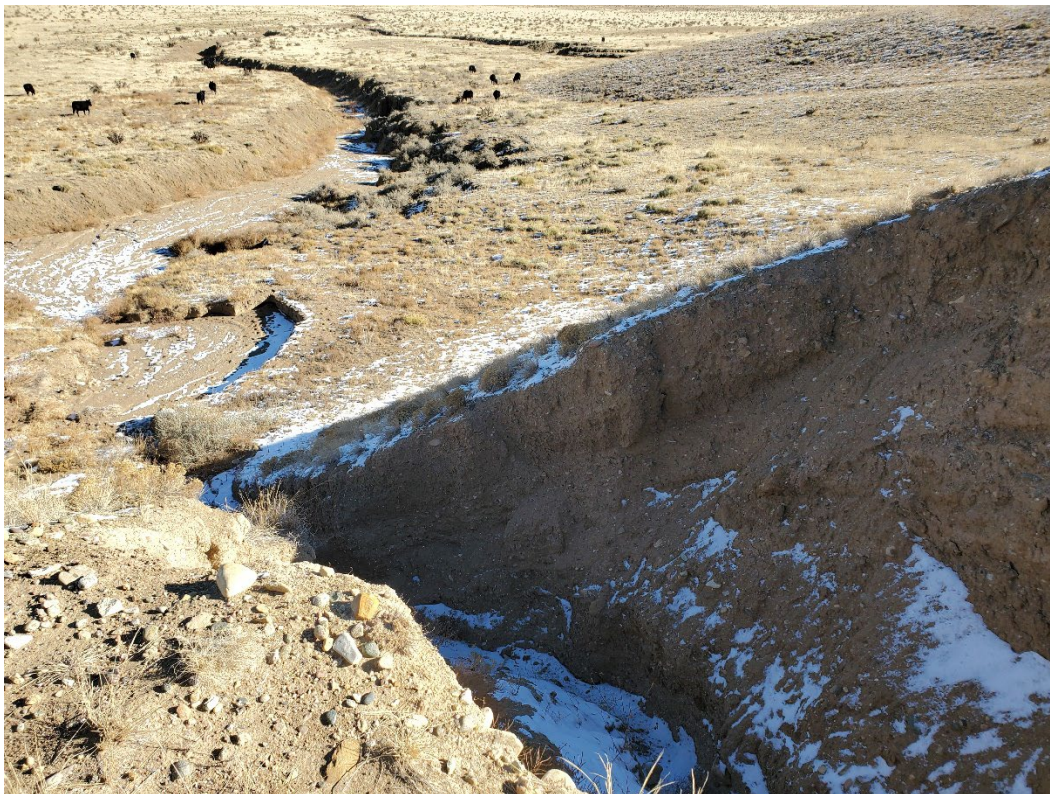
Photo 4: Looking east at substantial erosion into the north west corner of the Phase I(amendment area) of the permit.