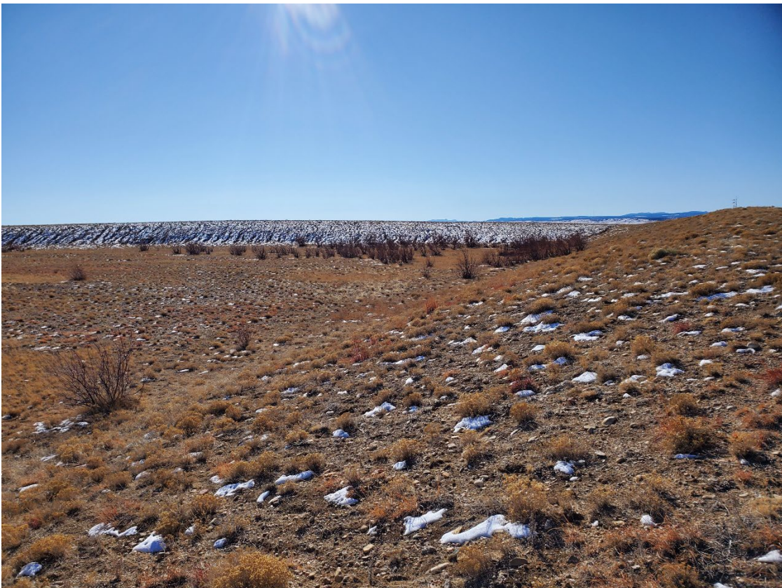
Photo 6: Looking south into the Phase I(b) permit area at substantial establishment of Tamarisk.