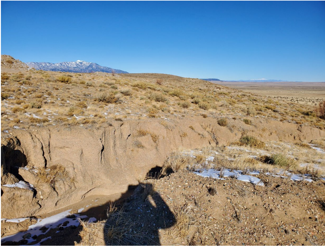
Photo 3: Looking northwest at erosion gully in northeast corner of the Phase I(a) Permit area.