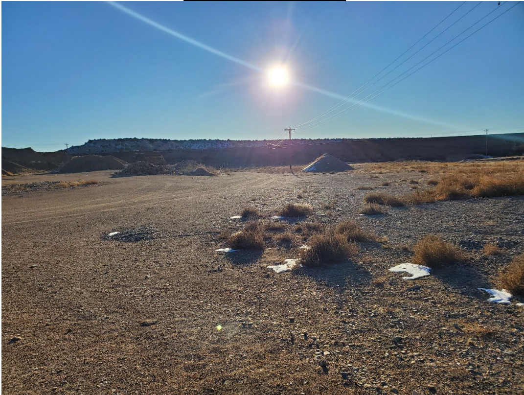
Photo 1: Looking east at the site entrance from near the southern boundary of the permit area.