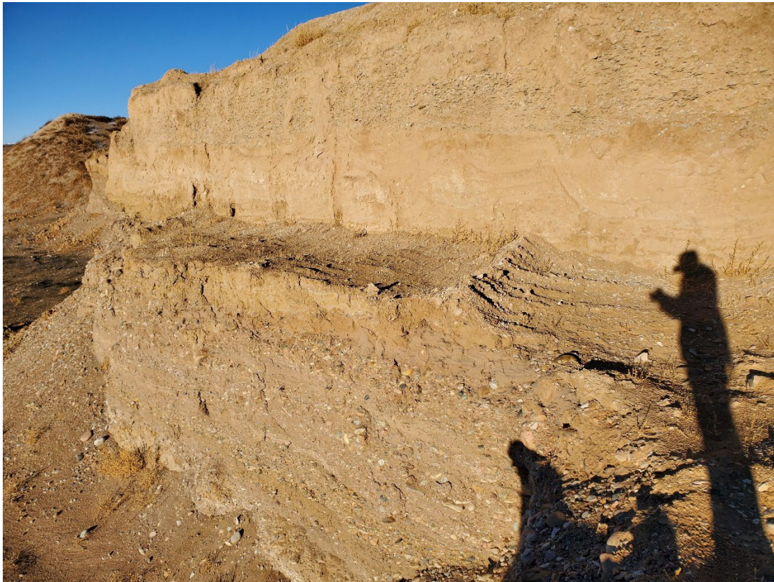
Photo 4: Looking southwest. Standing on middle ledge of high wall.