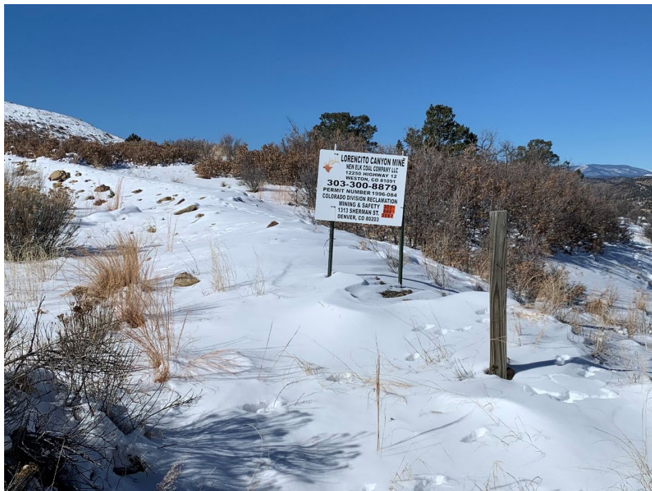
Photo2 – Mine entrance sign

Number of Partial Inspection this Fiscal Year: 4