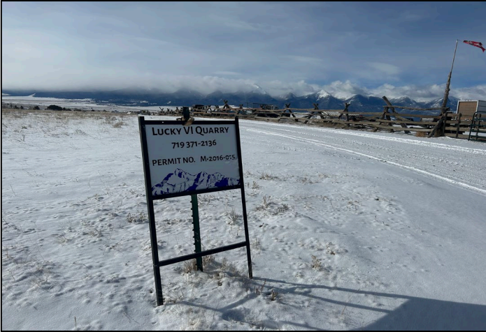
Photo 1 – Site identification sign at site entrance from Oak Creek Grade Road.