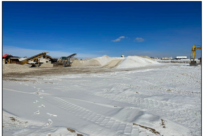
Photo 4 – Material processing and stockpile area located in north-center area of site.