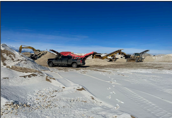
Photo 3 – Material processing and stockpile area located in north-center area of site.