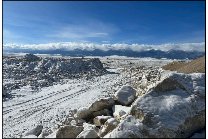
Photo 2 – East side of site where large pre-mining trench has been backfilled.