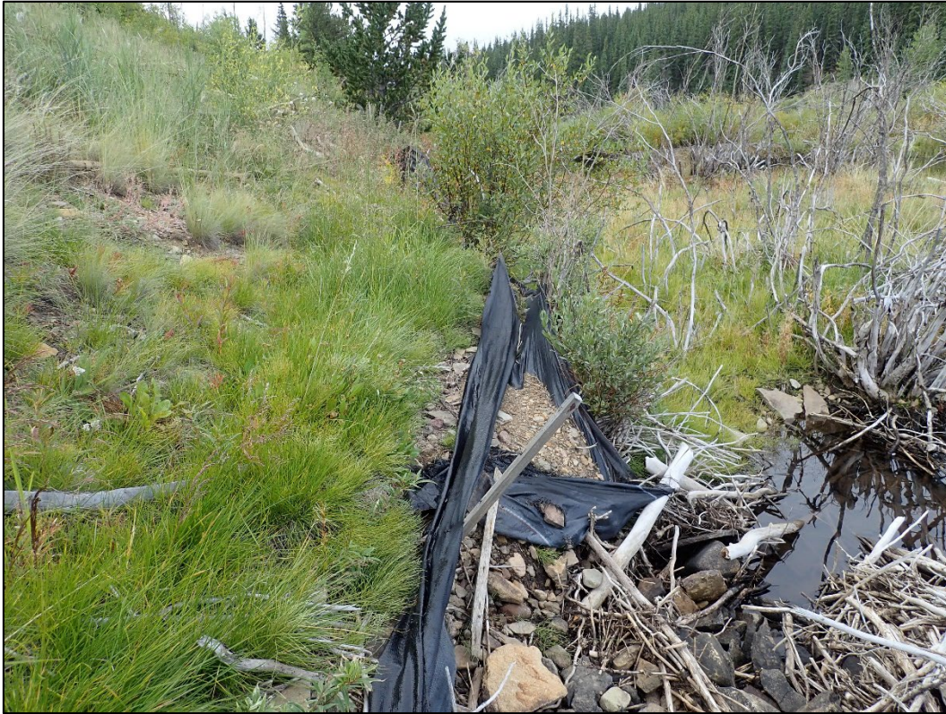
Photo 5. Silt fence located at toe of reclaimed slope needing to be removed; looking south.

Kevin J Smith 369 Old State Rd Bailey, CO 80421-1850