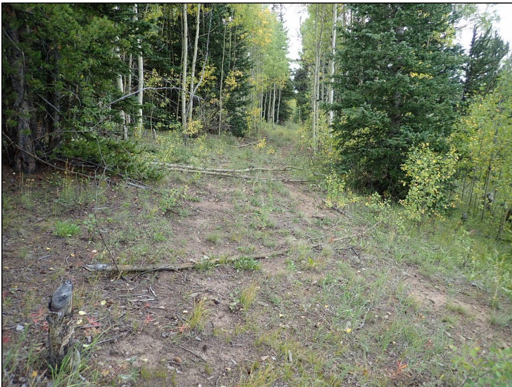
Photo 4. Reclaimed access road along the east side of Beaver creek; looking south.