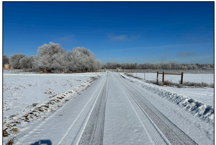
Photo 4 – Photo of Evans 35 th Ave ROW looking north. Permit boundary on each side will need to be clearly marked prior to mining activity to avoid out-of-bounds impacts.