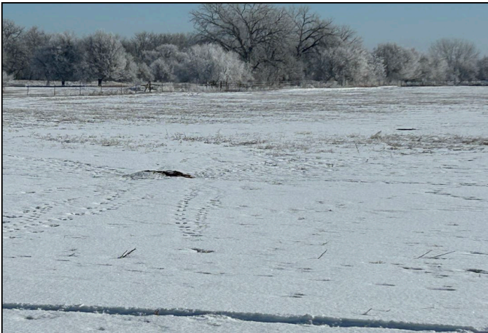
Photo 5 – Active prairie dog burrows and tracks observed in east-center of proposed permit area.