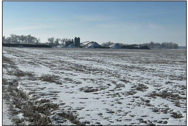
Photo 2 – SW corner of permit where asphalt plant is being constructed and imported materials staged.