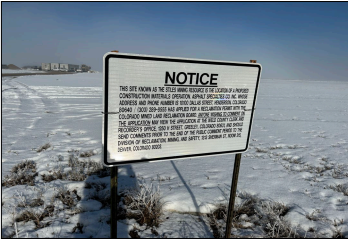
Photo 1 – Notice of permit application sign at site entrance from Hwy 394.