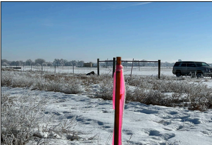
Photo 3 – Photo taken from surveyed NW corner of permit looking back to existing fences.