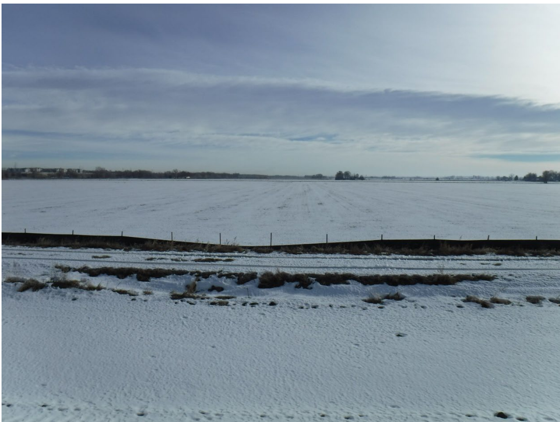
Photo 6: Looking east from the top of a screen berm adjacent to drainage swale, across permit area