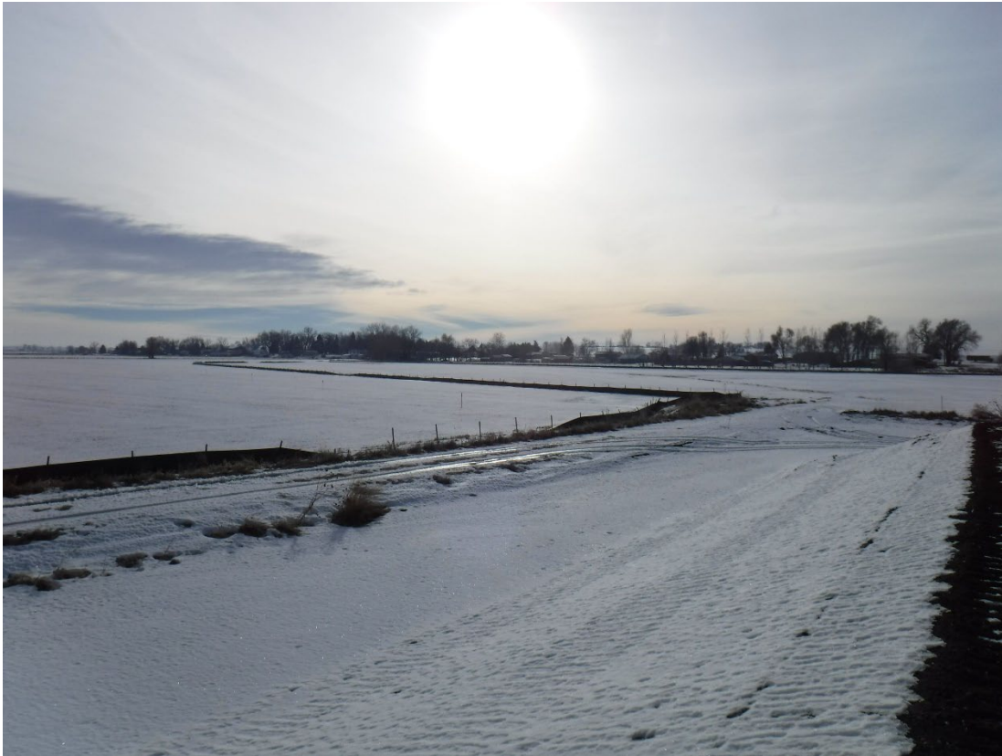
Photo 5: Looking southeast from the top of a screen berm adjacent to drainage swale, silt fence is approximate new permit boundary