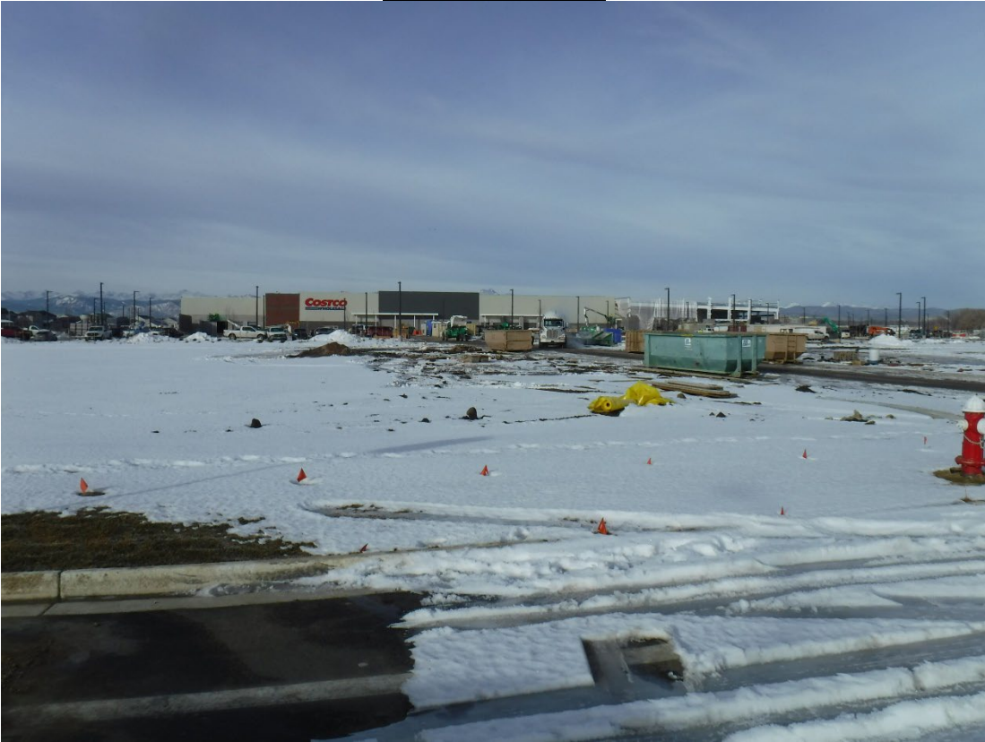
Photo 1: Looking west from the access road towards the Costco under construction