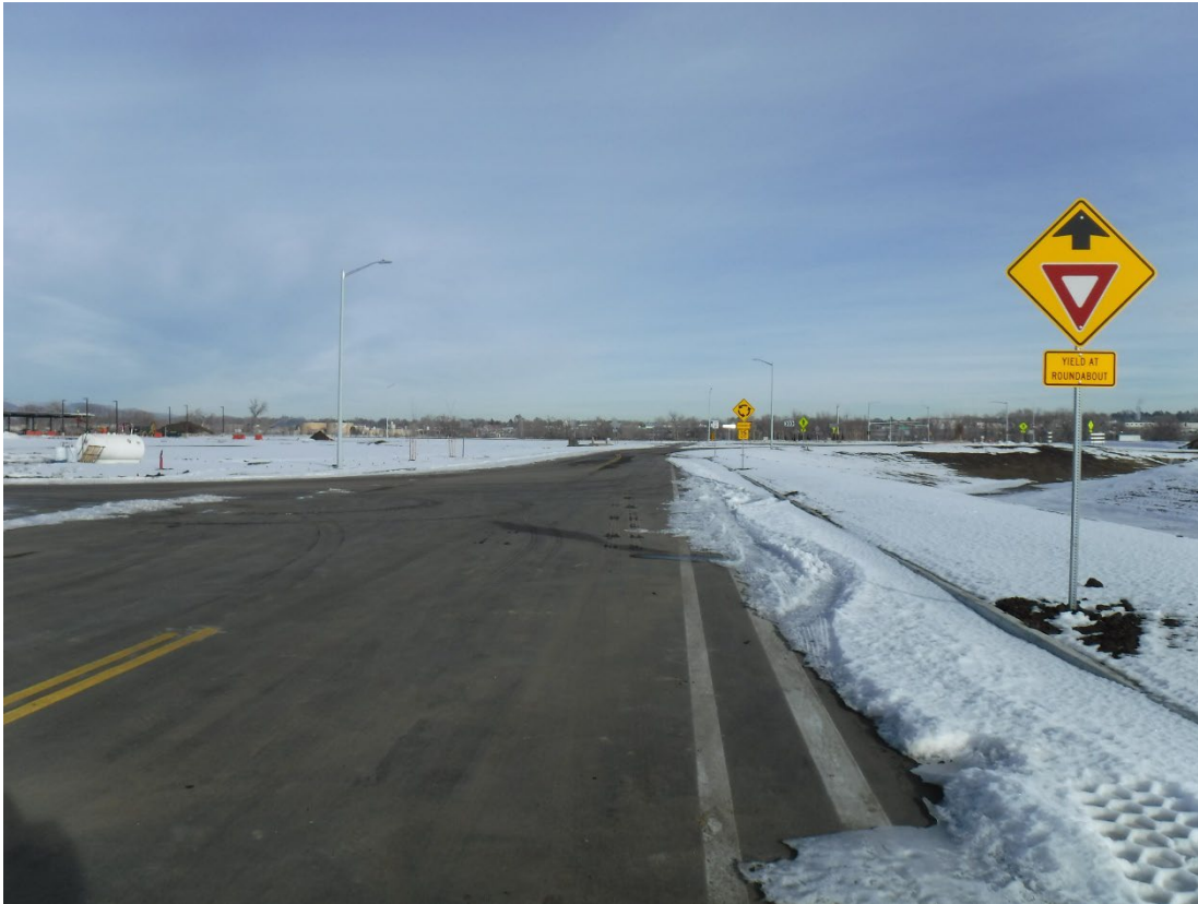
Photo 3: Looking north along the access road, road continues to a signal regulated junction with Hwy 119