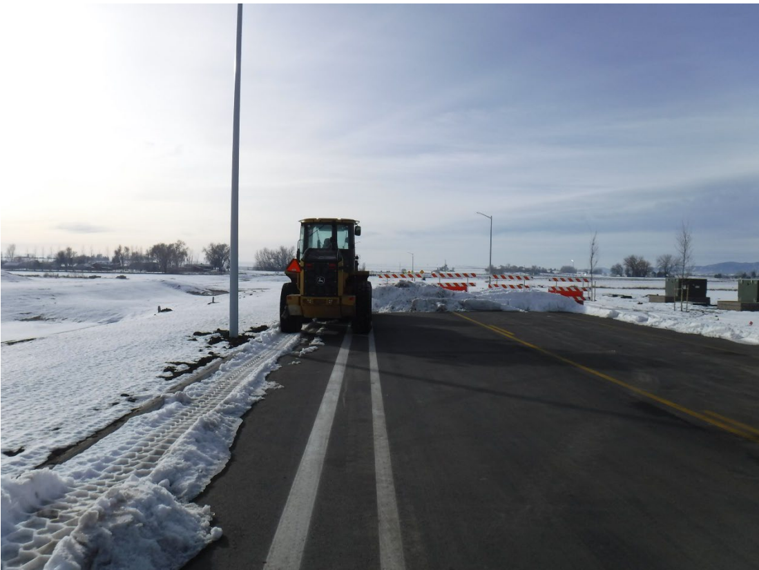
Photo 2: Looking south along the access road, the road continues beyond the barricades