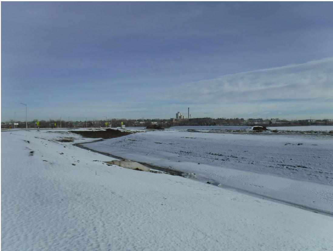
Photo 4: Drainage swale between develop area and mining permit area