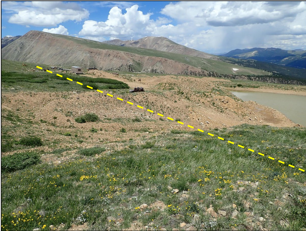
Photo 4. Overview of the western portion of the mine site, approximate permit boundary (dashed line) showing some pre-law disturbance off-site; looking north.