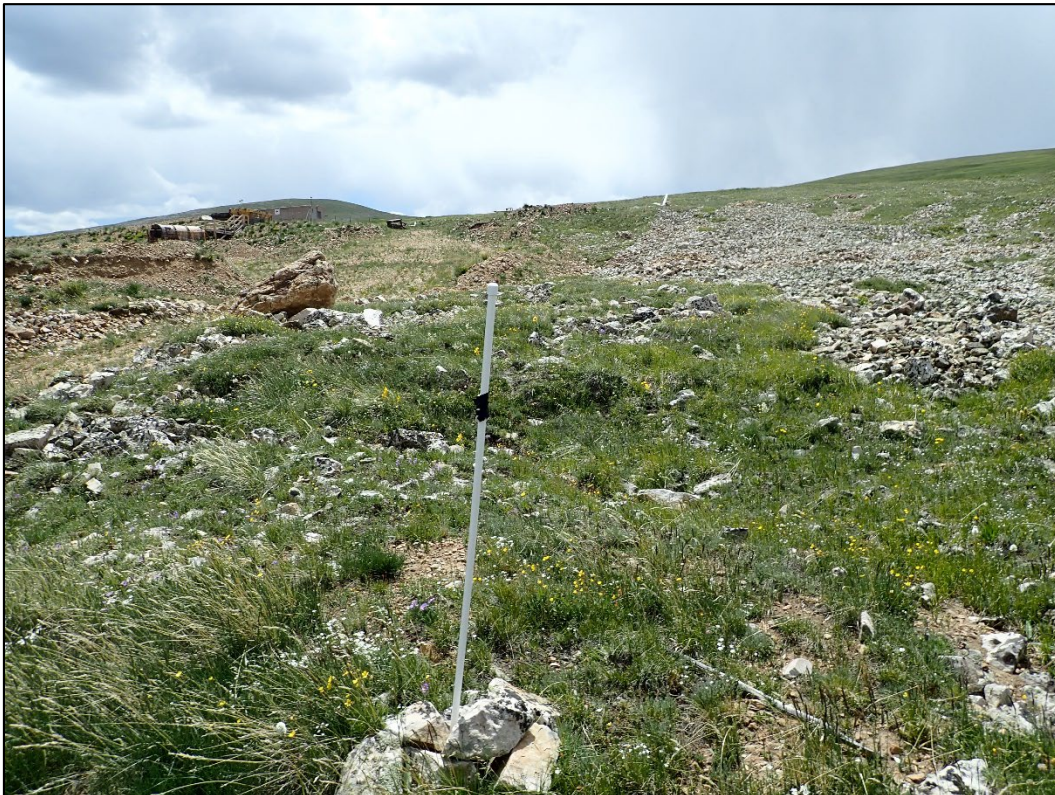
Photo 7. Marker along the northern permit boundary; looking southwest.