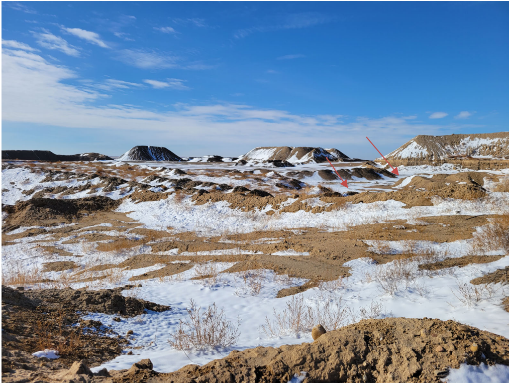
Looking west from the access road at Phase 1 area. Bottom of pit is marked by red arrow.