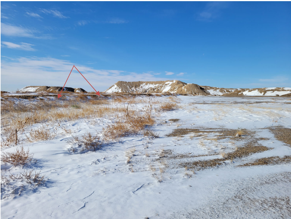
Looking west. Berm marked by red arrow is the dividing line between Phase 1 and Phase 2 areas.