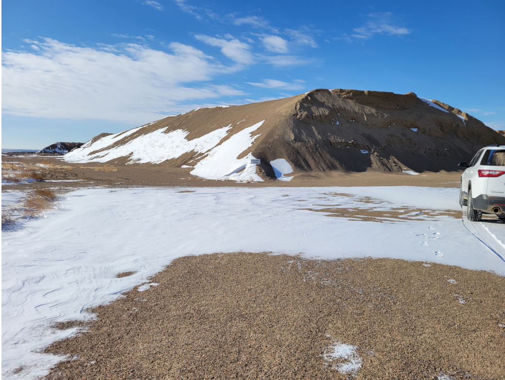
Material stockpile stored in Phase 2 area.