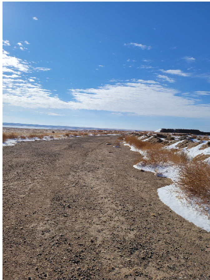
Looking south down the improved gravel access road.