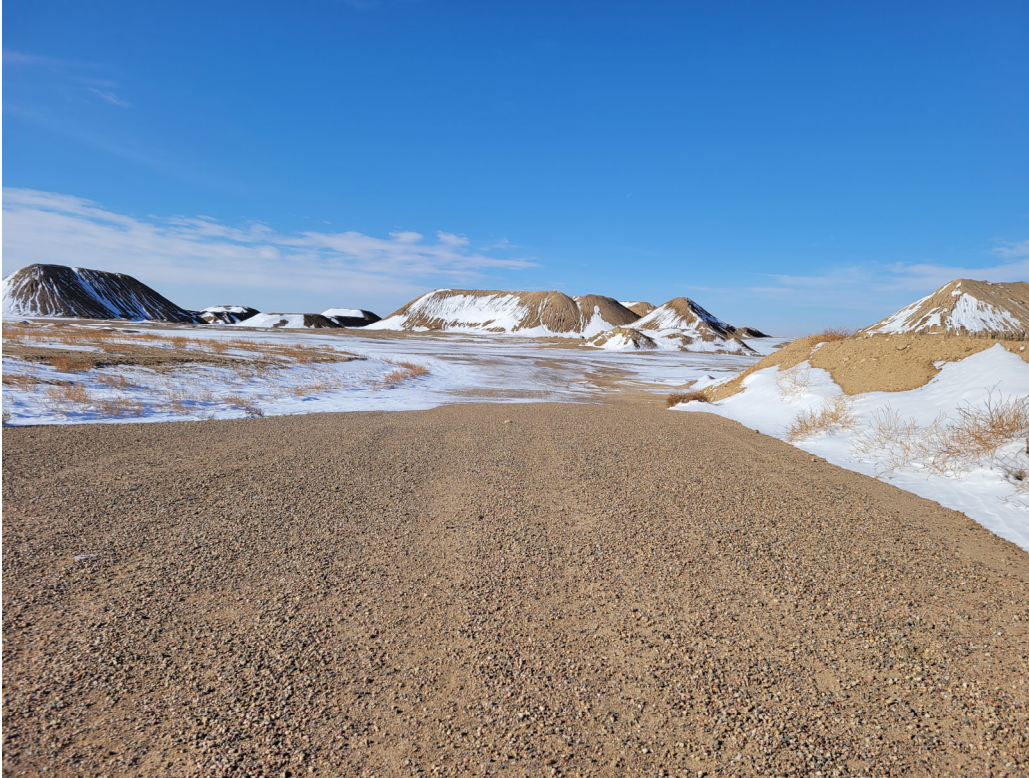
Looking west in to Phase 1. Overburden stripped and stored around the mining area.