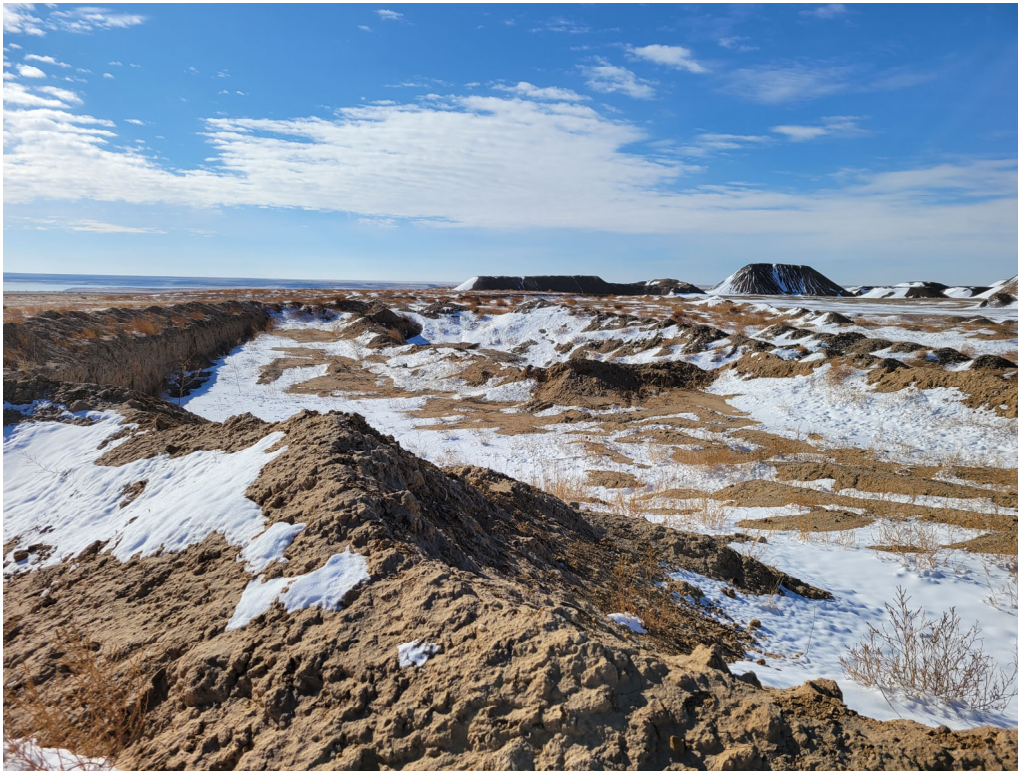
Looking south into mining area from the boundary between Phase 1 and Phase 2.