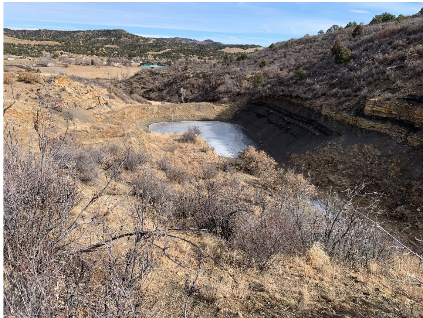
Photo 2 - Pond 8

Number of Partial Inspection this Fiscal Year: 4