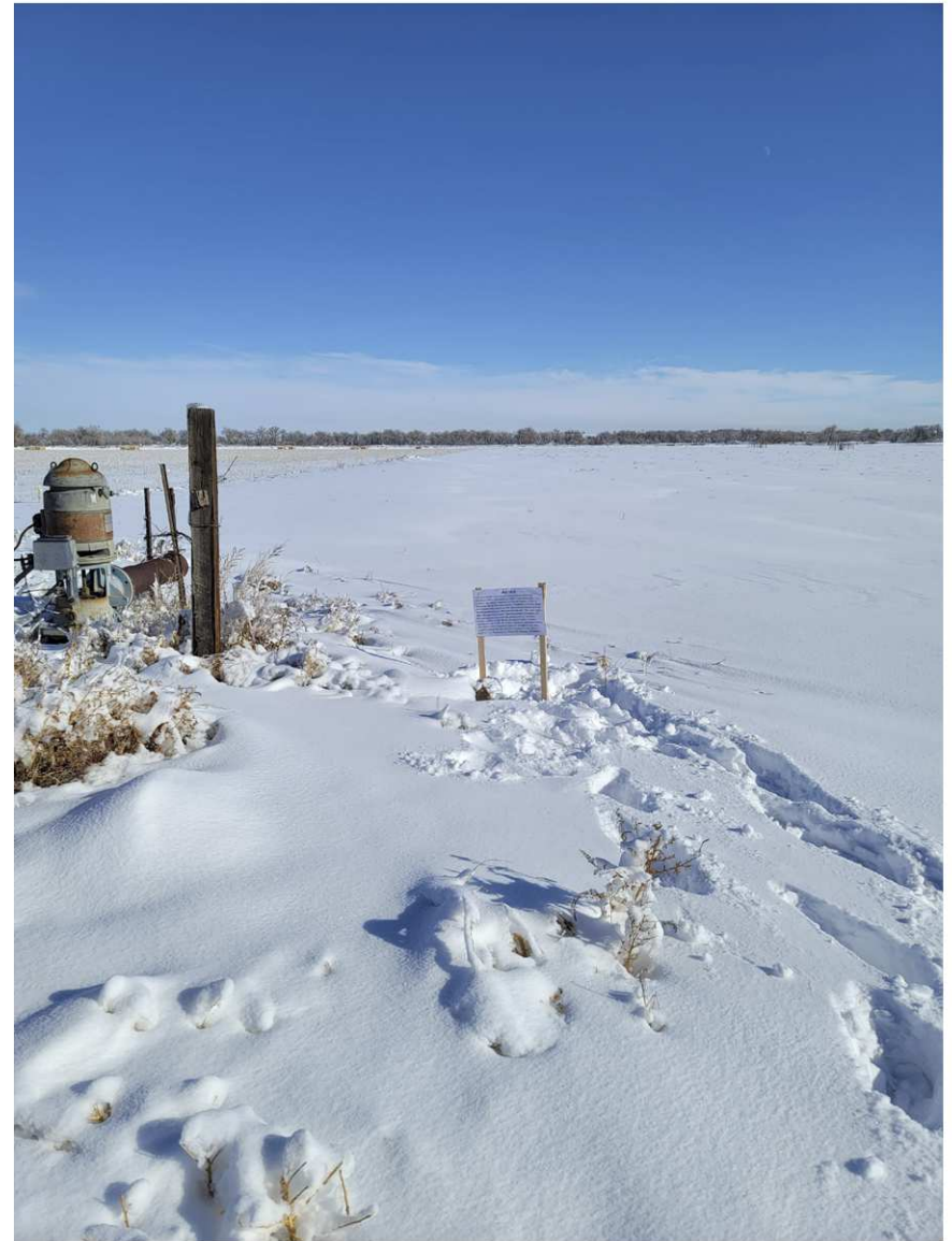
PHASE 3 - PHOTO DATE 12/29/2022