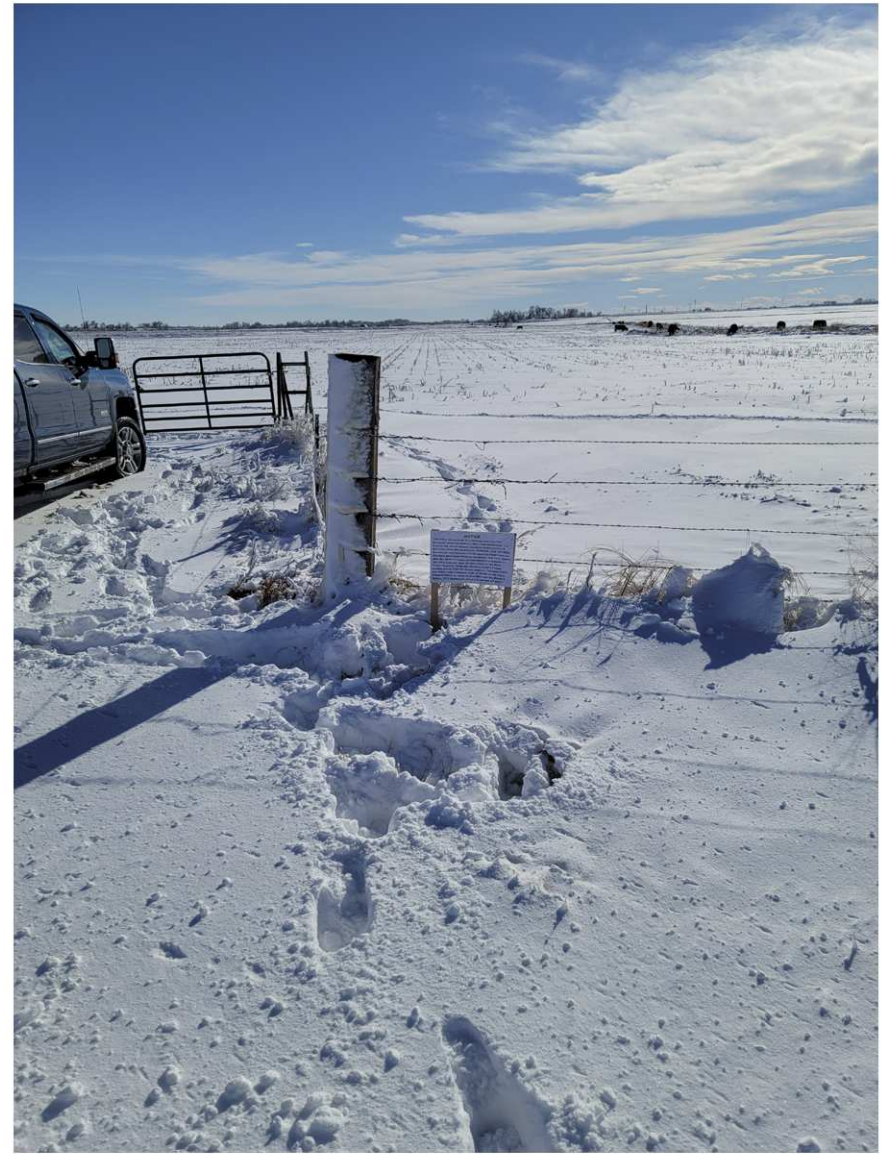
PHASE 1 - PHOTO DATE 12/29/2022