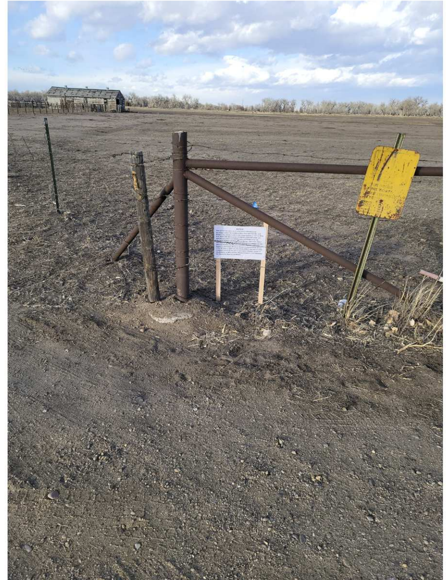
PHASE 2 - PHOTO DATE 12/29/2022