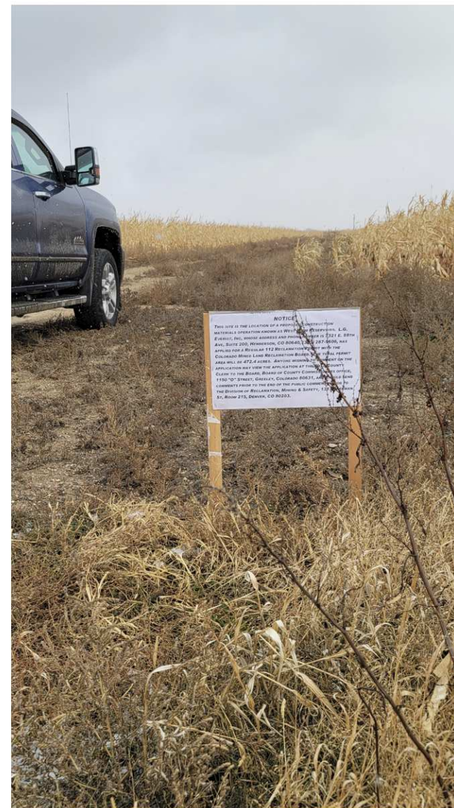
PHASE 4 (ENTRANCE) - PHOTO DATE 11/22/2022