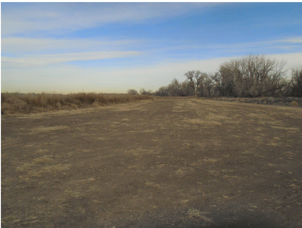
View of the site from the south looking north