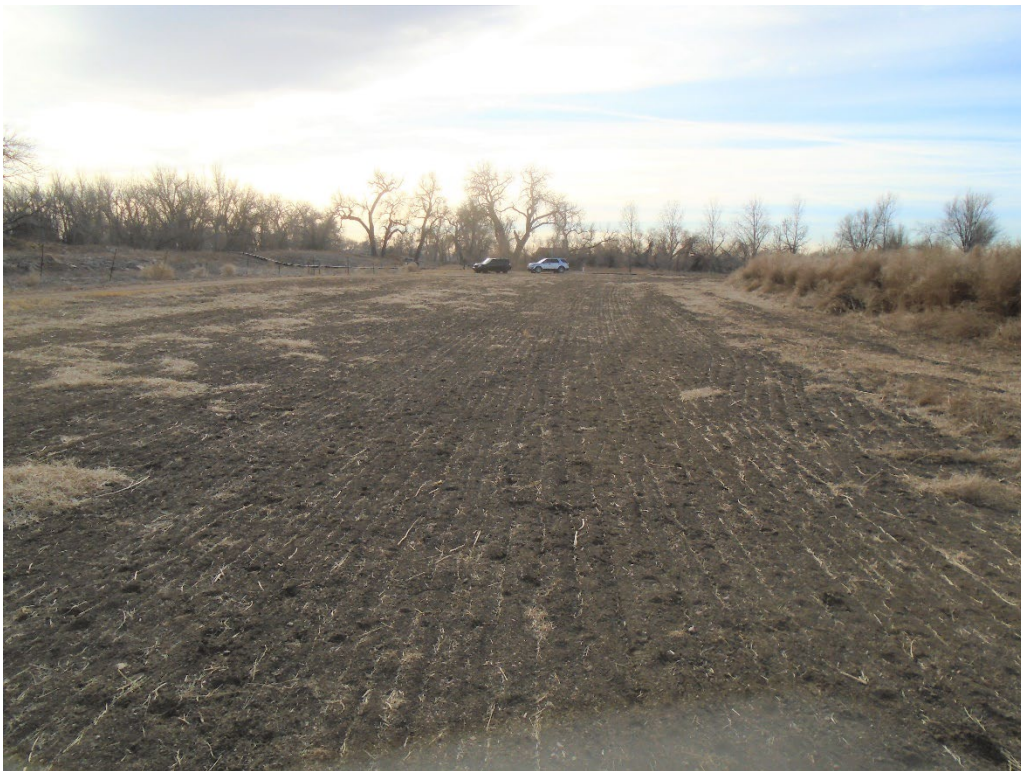
View of the site from the north looking south