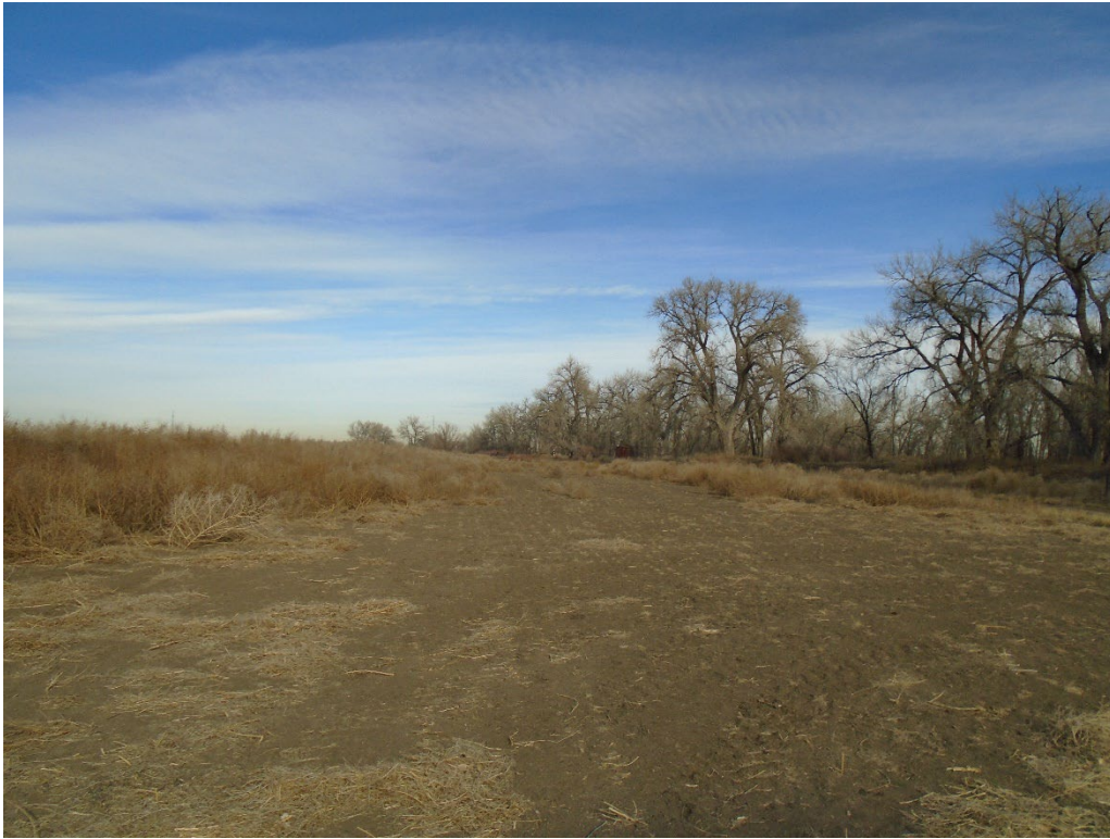
View of the site from the south looking north