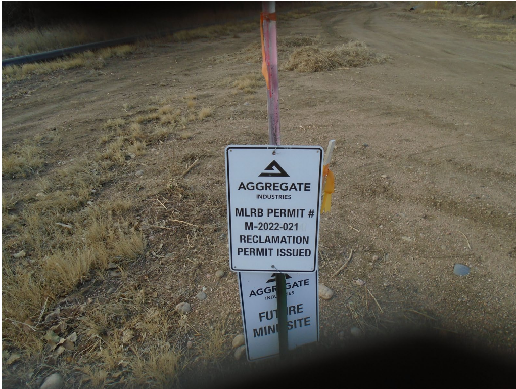
Wattenberg Disturbance Reclamation site mine sign