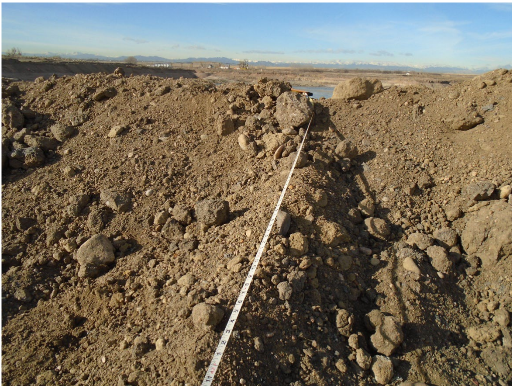
Photograph of the third measured offset distance