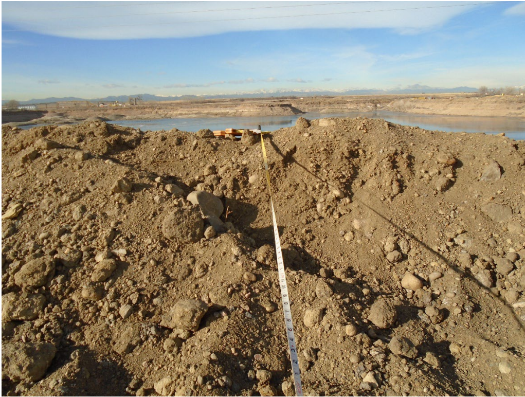
Photograph of the fourth measured offset distance