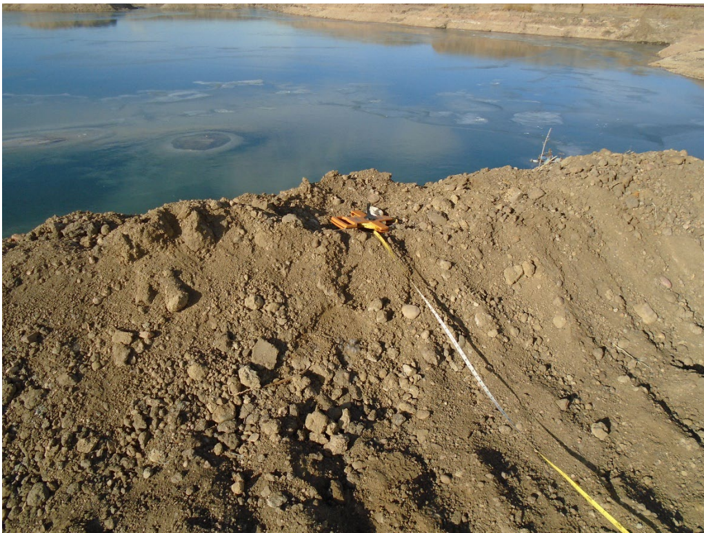
Photograph of the fifth measured offset distance