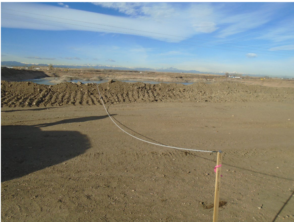
Photograph of the first measured offset distance