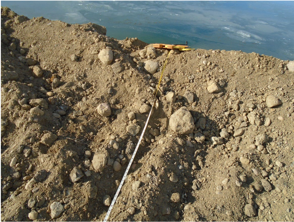
Photograph of the second measured offset distance