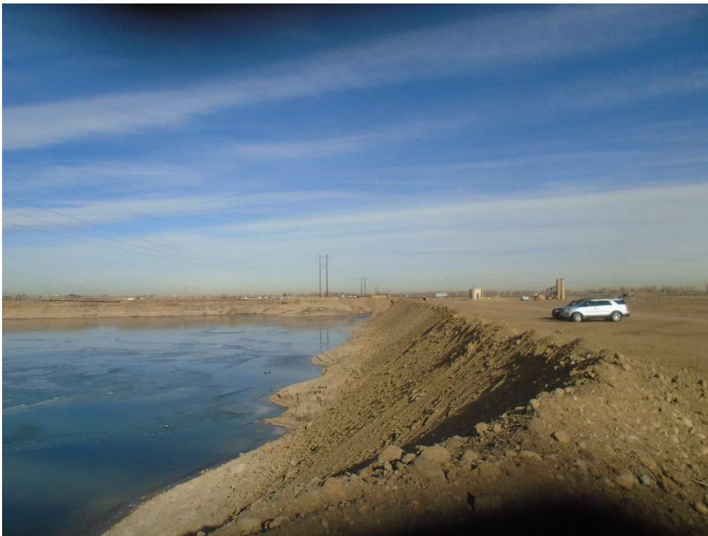
View of the backfilled slope from the southwest corner of Phase 2 / Pond 1 Mining Area looking north