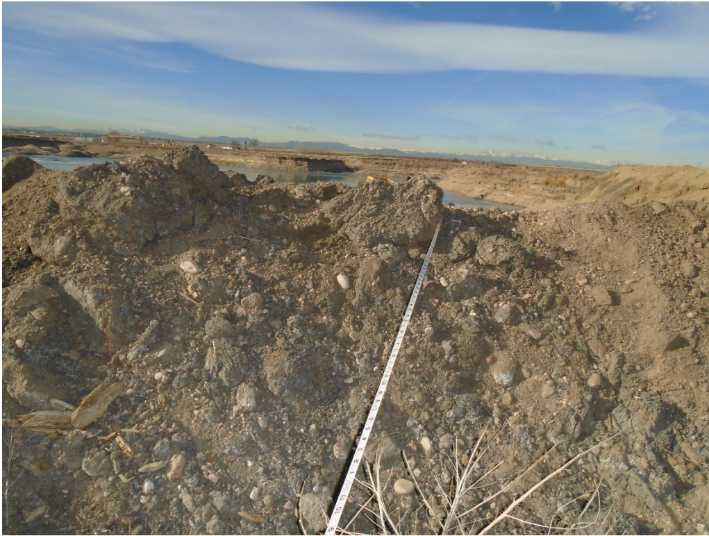
Photograph of the sixth measured offset distance