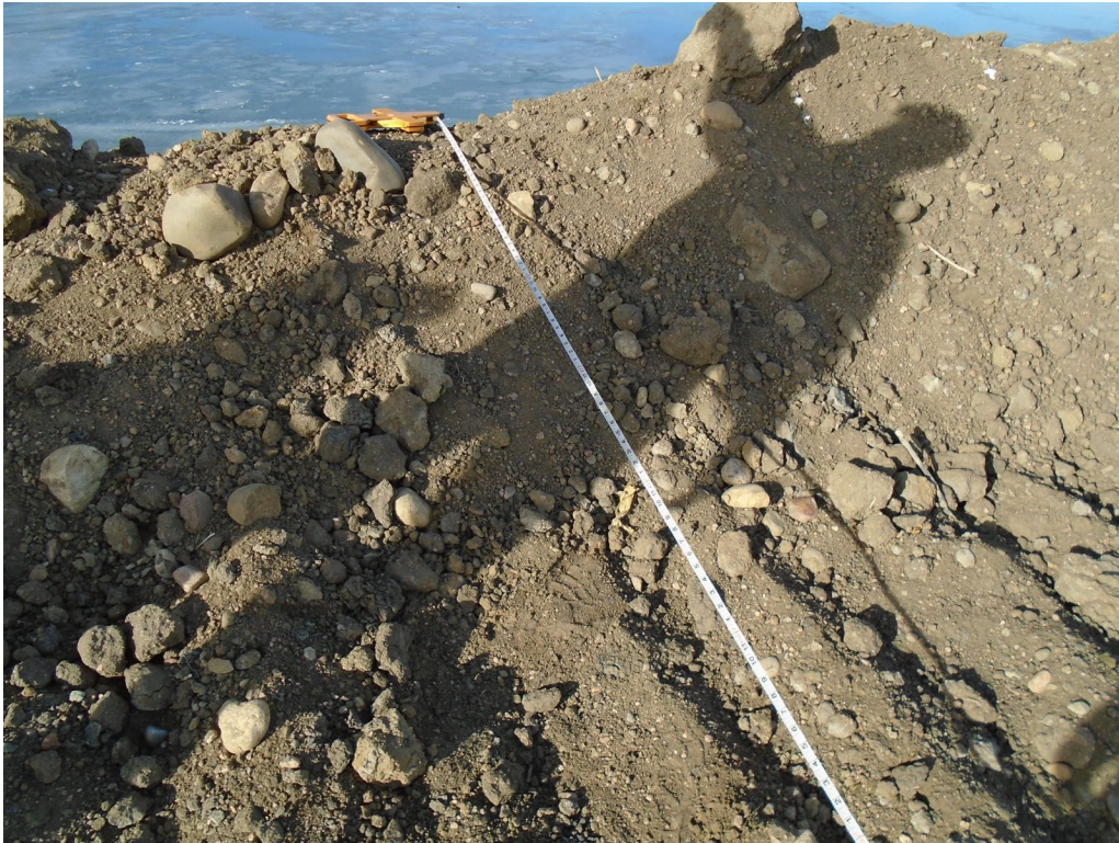
Photograph of the first measured offset distance