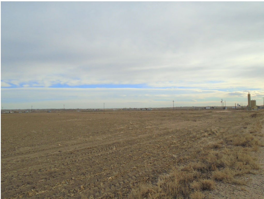
View of the topsoil stockpile area from the oil and gas road looking southeast