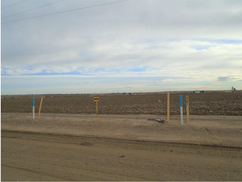
View of the oil and gas easement on the north side of WCR 40

Chris Leone J-2 Contracting Company 105 Coronado Ct., Unit A-101 Fort Collins, Co 80525