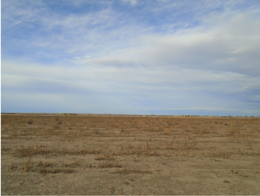
View of site from WCR 40 looking north