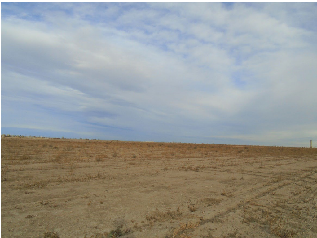
View of site from WCR 40 looking east