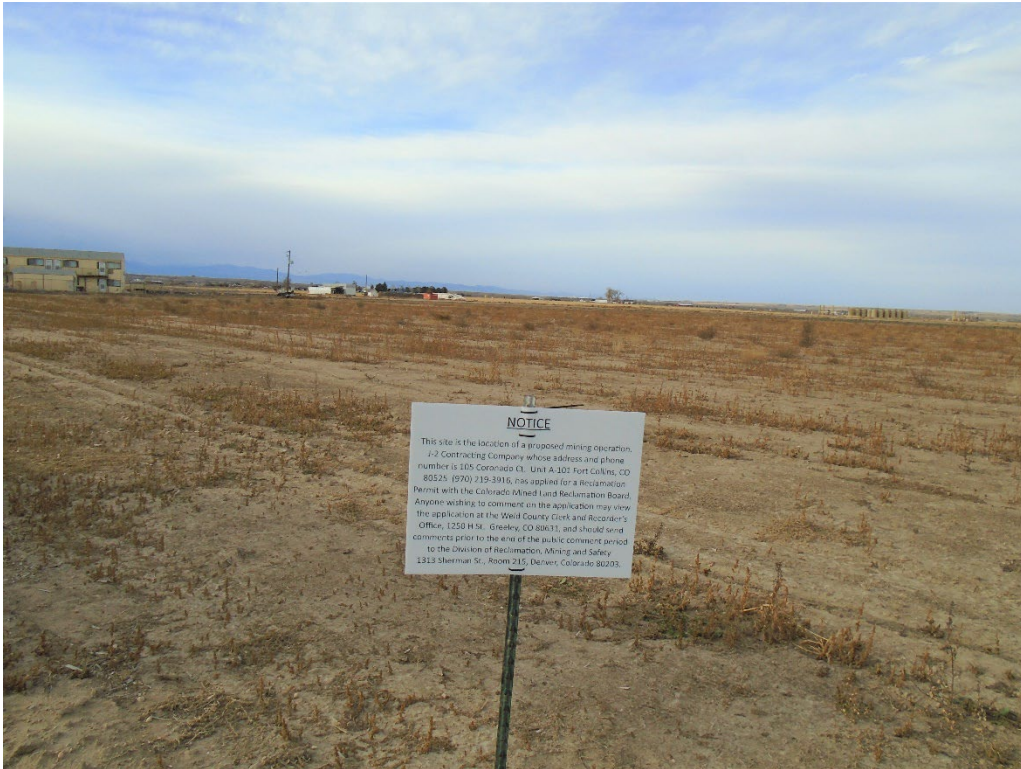
Hunt Irrigation Pond notice sign