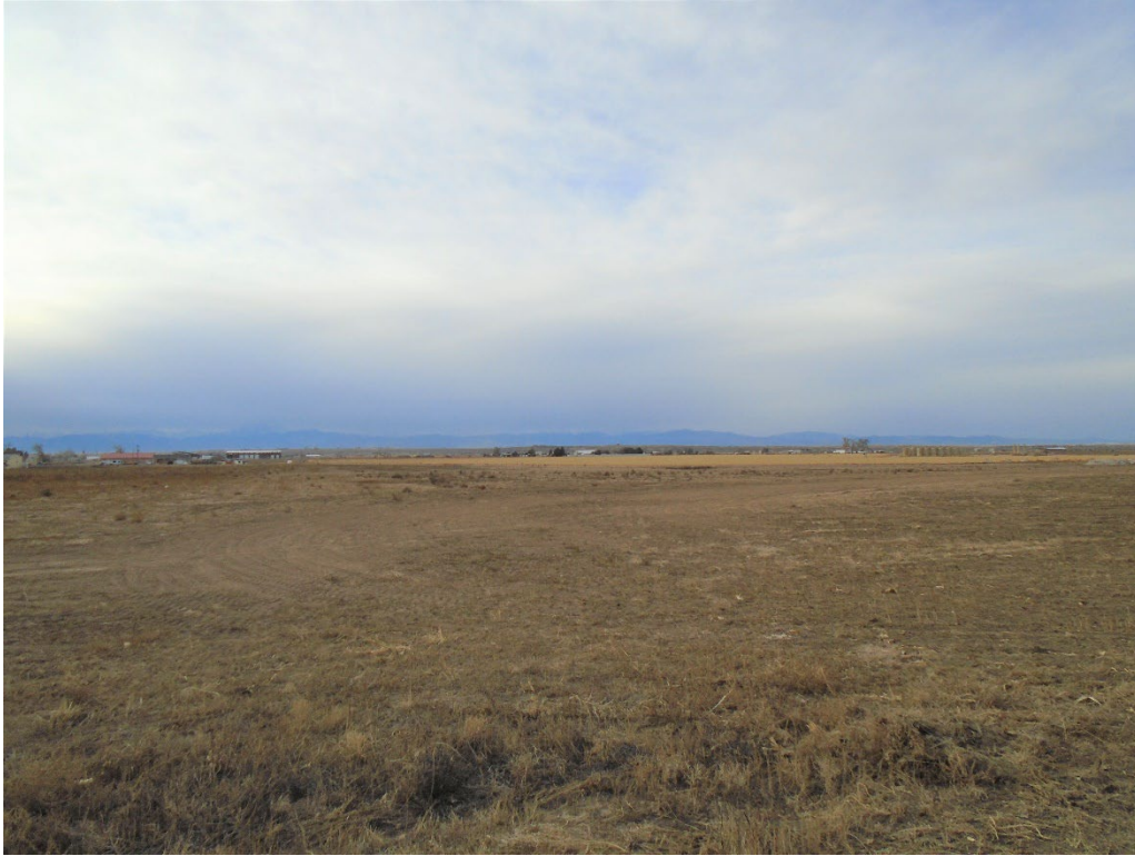
View of the overburden stockpile area from the oil and gas road looking northwest