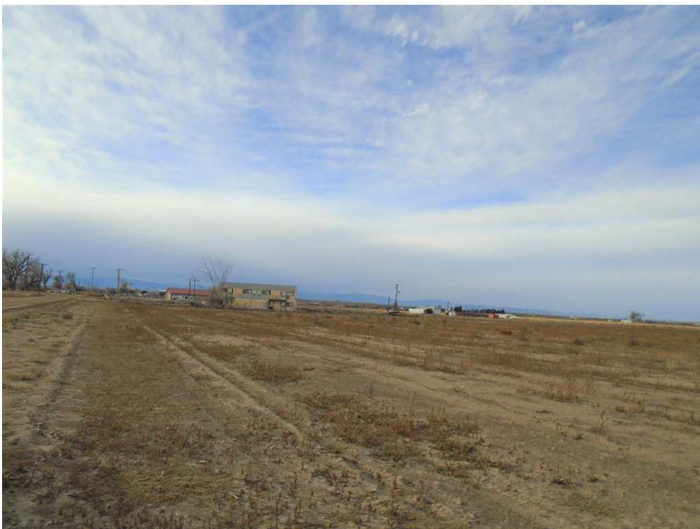
View of site from WCR 40 looking west