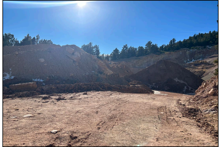
Photo 2 – Existing product stockpile on right, overburden for reclamation on left.