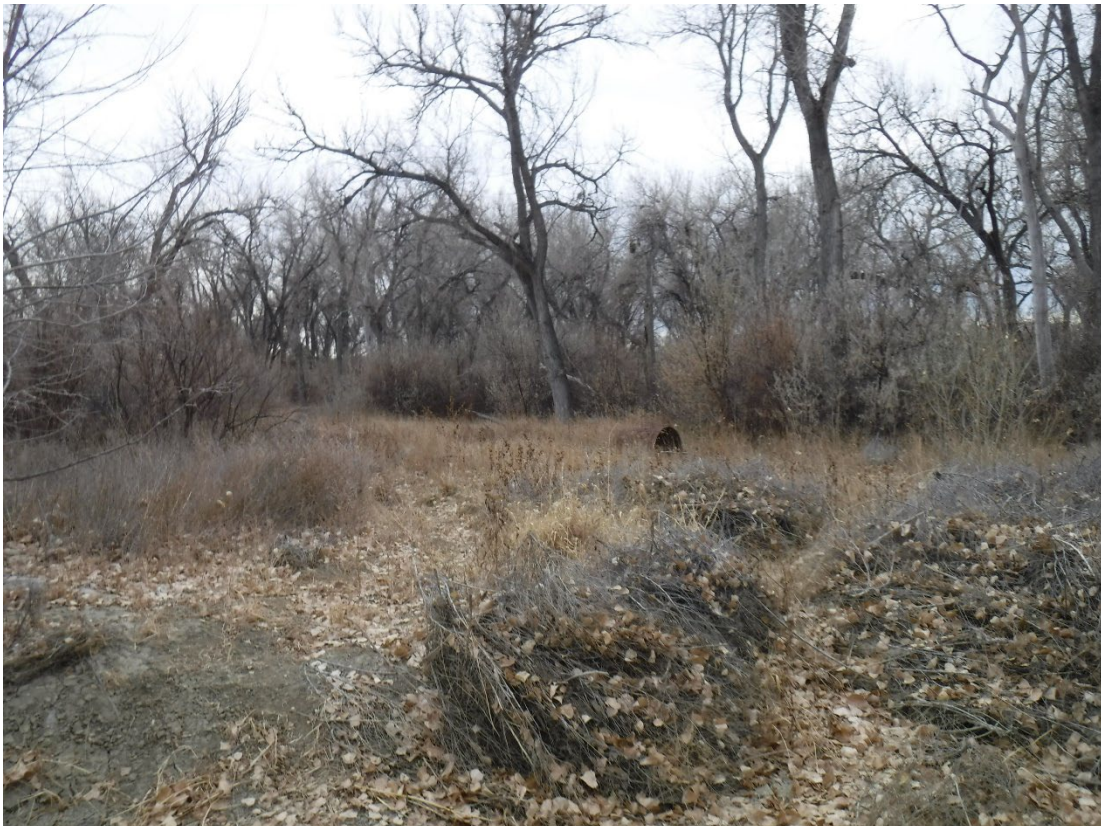
Photo 4: Looking southeast from the corner of Phase 7, unaffected by mining