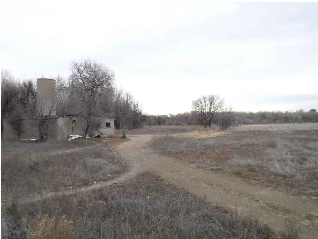
Photo 2: Looking south from the corner of 29 1/2 Lane and East Drive Road, unaffected by mining