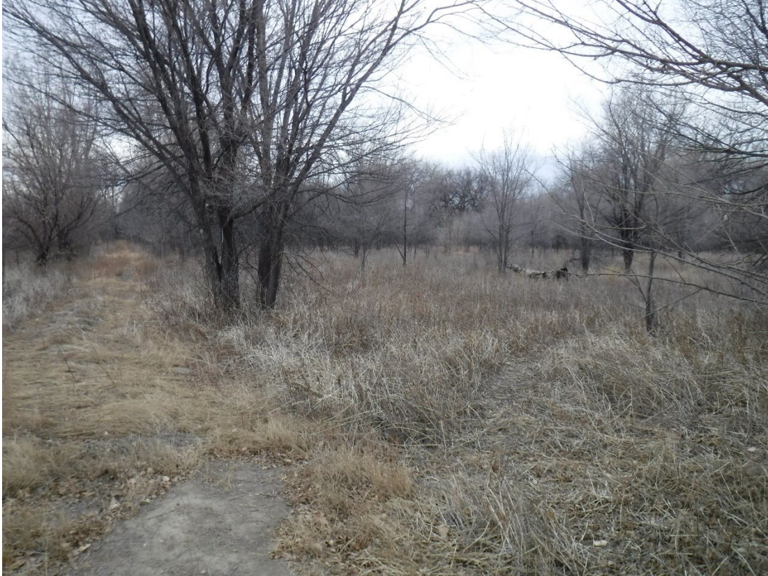
Photo 3: Looking south from the corner of 29 Lane and East Drive Road, unaffected by mining