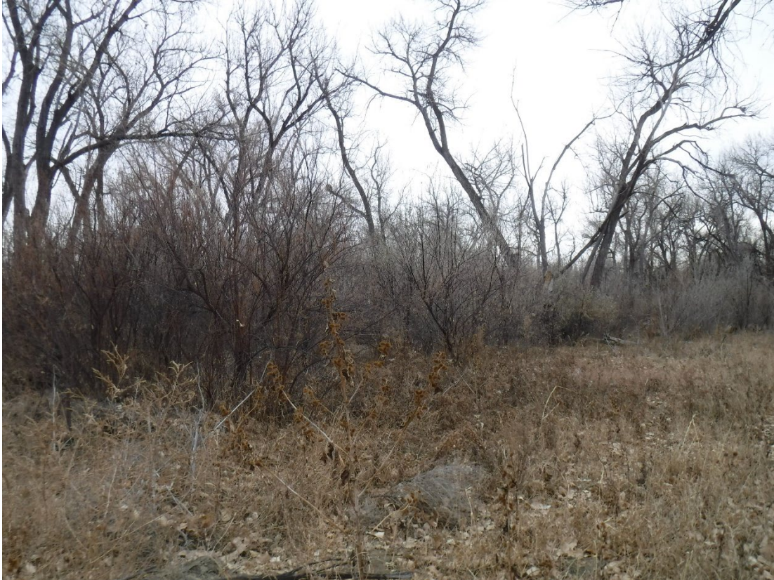
Photo 5: Looking south from the corner of Phase 7, unaffected by mining