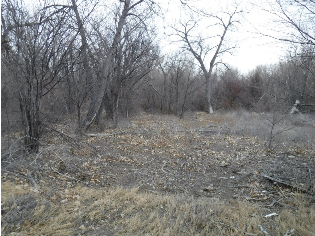
Photo 1: Looking southeast from the corner of 29 1/2 Lane and East Drive Road, unaffected by mining