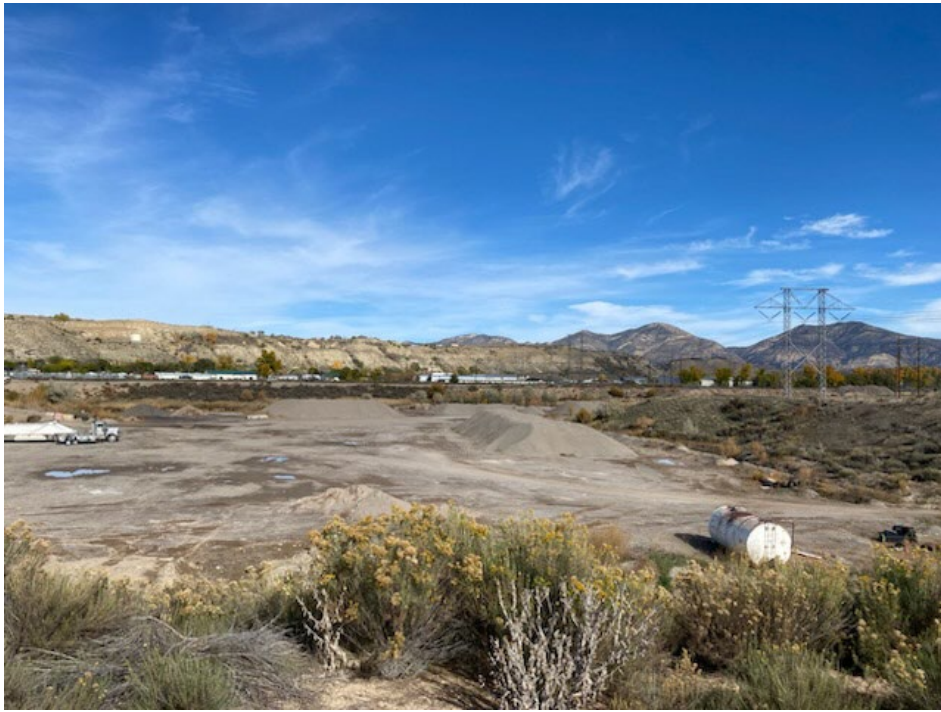
Photo 4: The inactive pit. The photo was taken looking to the northeast.