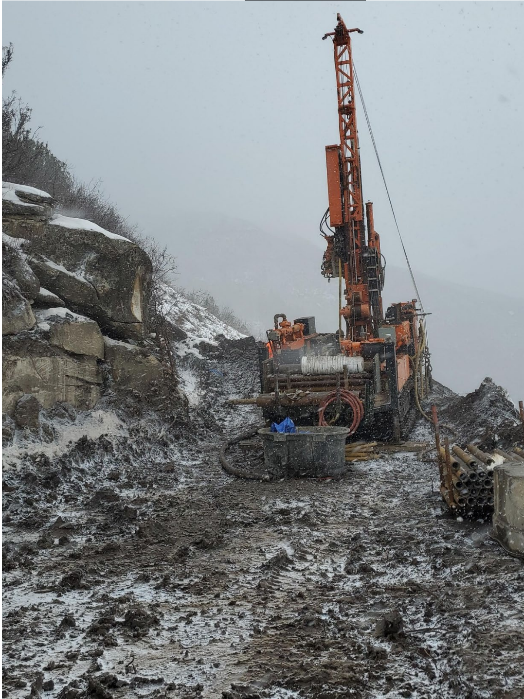
Figure 1: Drill rig on the bench above the escarpement

Number of Partial Inspection this Fiscal Year: 2