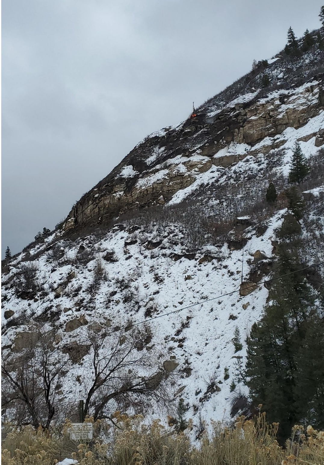
Figure 2: The drill rig above the slide area, taken from the mine access in Somerset

Number of Partial Inspection this Fiscal Year: 2