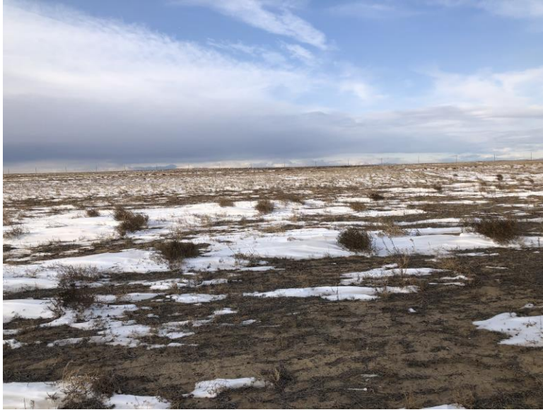
Area 37, eastern portion