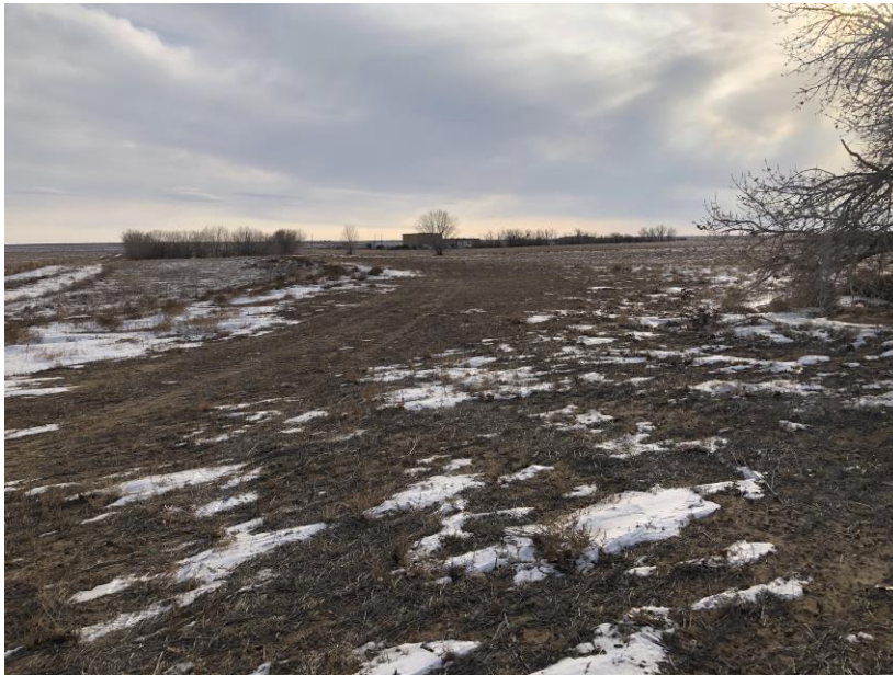
Area 42, looking east

Number of Partial Inspection this Fiscal Year: 4