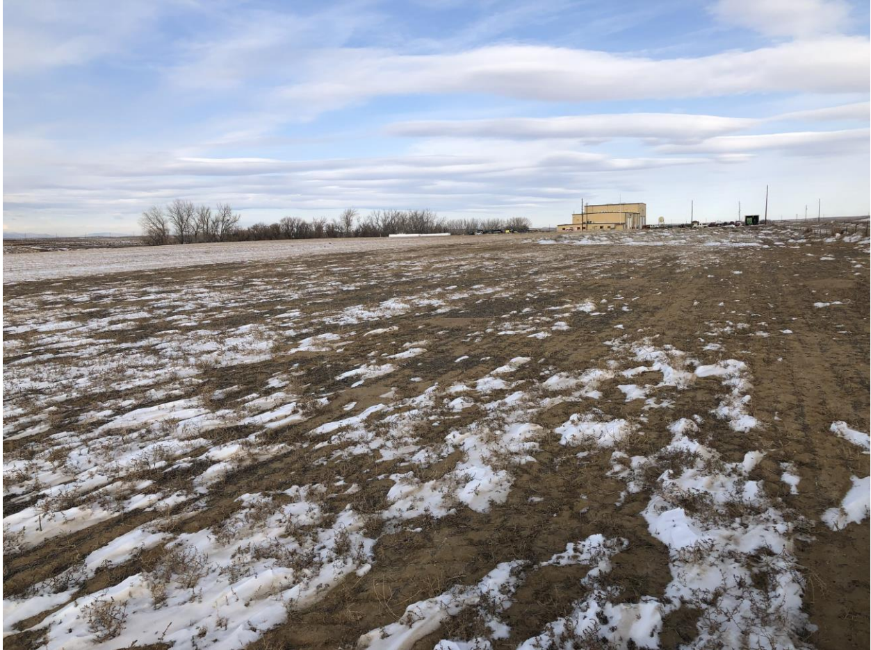
Area 38, looking at Dugout Pond and facilities

Number of Partial Inspection this Fiscal Year: 4