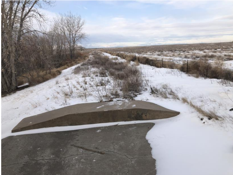
Sediment Pond 2, looking west from spillway