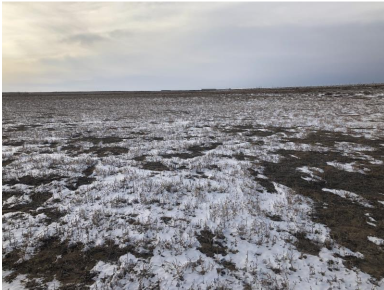
Area 37, western portion

Number of Partial Inspection this Fiscal Year: 4