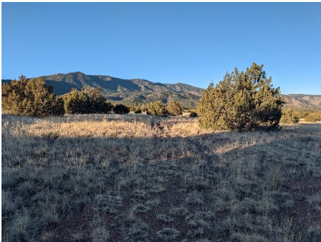
Two track road.

The two track road off County Road 51 was inspected. This portion of the remaining disturbance was not reclaimed however vegetation continues to establish itself along the road. Cactus, shrubs and grasses have naturally encroached from the surrounding undisturbed area. No signs of use was observed on the road as well as erosion.