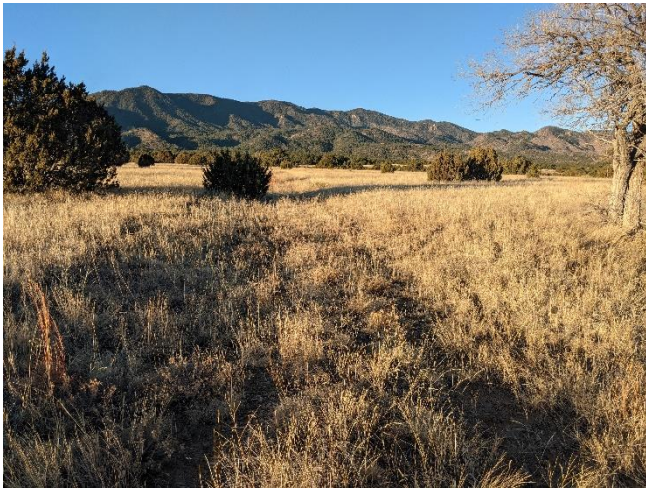
Access road to NW-MW pad.