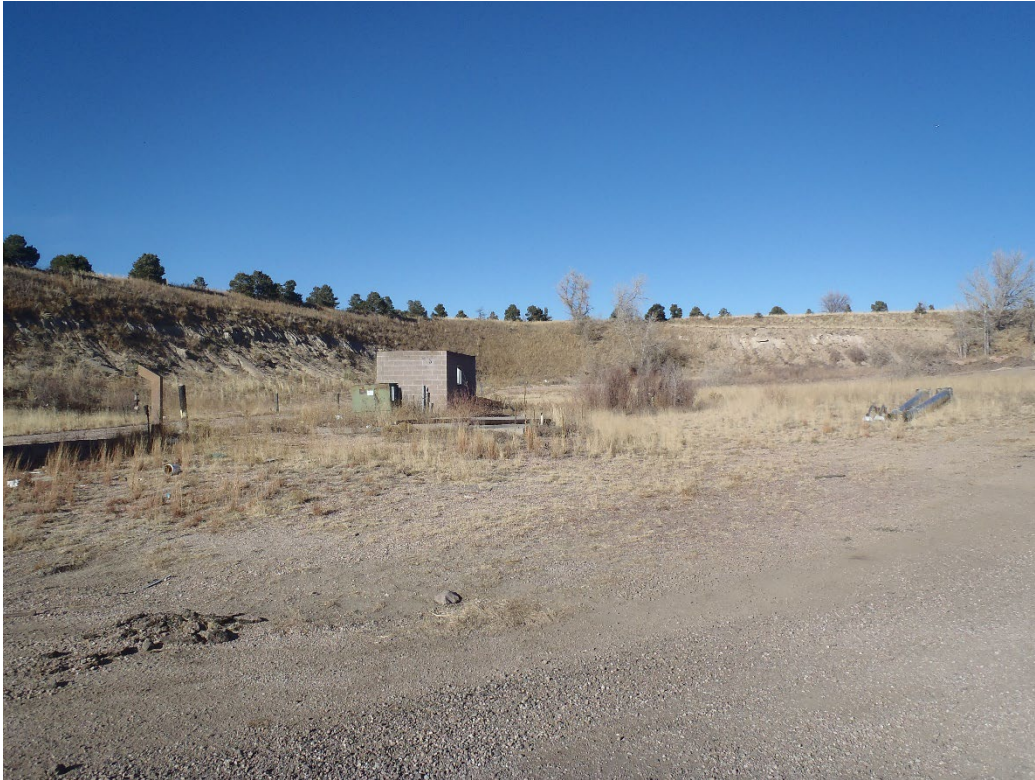
Photo 4. West (left side) and north (beyond) berms (looking NNW from near scale house).