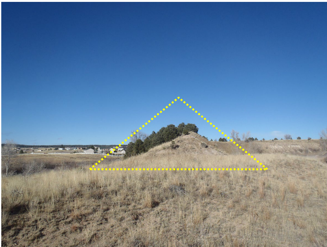
Photo 3. West berm to be flattened (south end, looking north from access road).