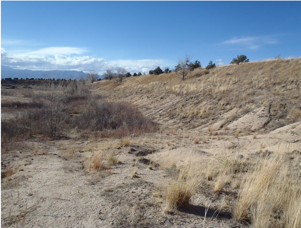
Photo 2. North berm, under which gas line will be replaced (looking west).