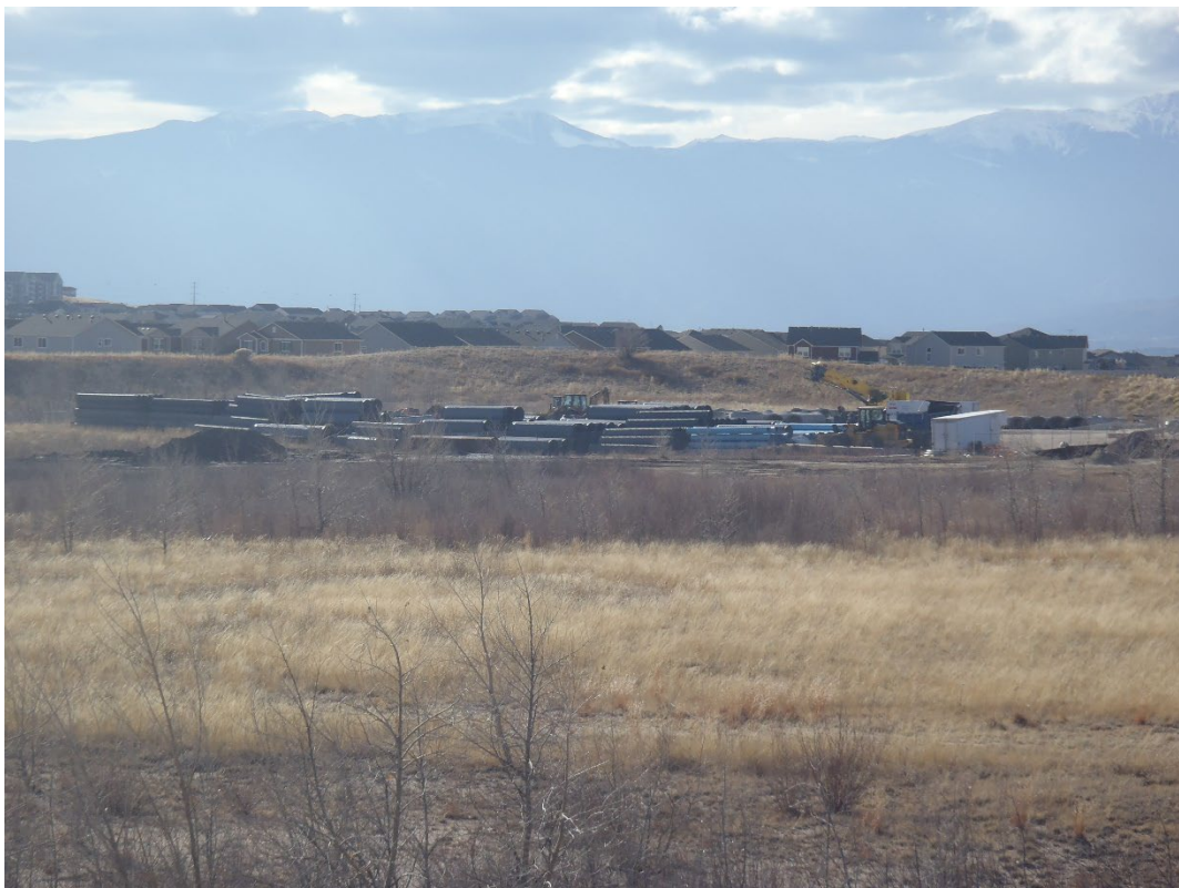
Photo 1. Pipe material staged on pit floor for Black Forest Rd widening project (looking SW).