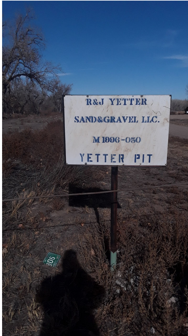
Mine sign reinstalled.