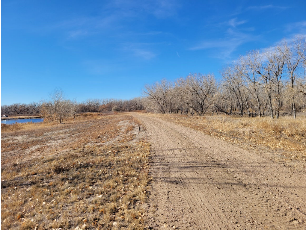
Looking west, access road around perimeter of pond.