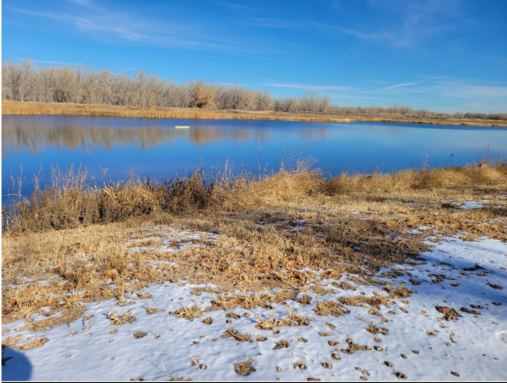
Looking northeast across pond. Vegetation well established around pond.