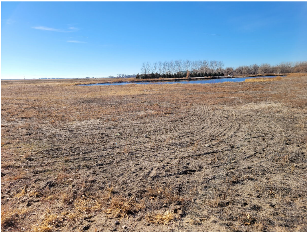
Looking south from northeastern corner of permit area.