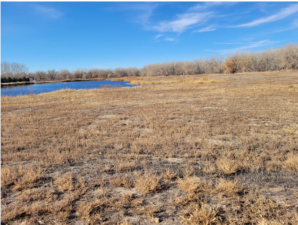
Looking west across seeded area northeastern side of pond.