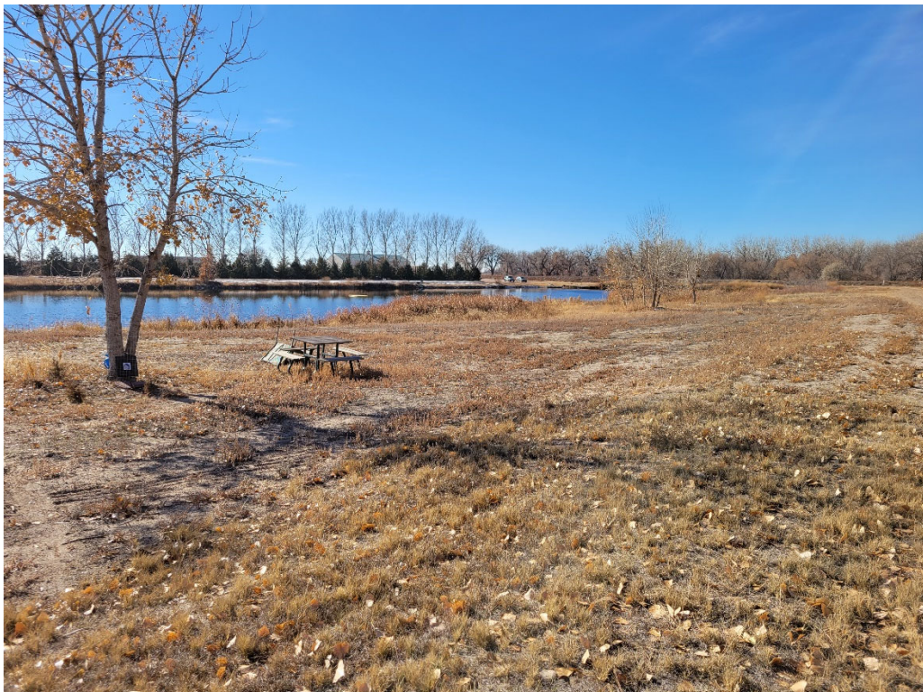
Looking west. Recreation area on the northern shore.