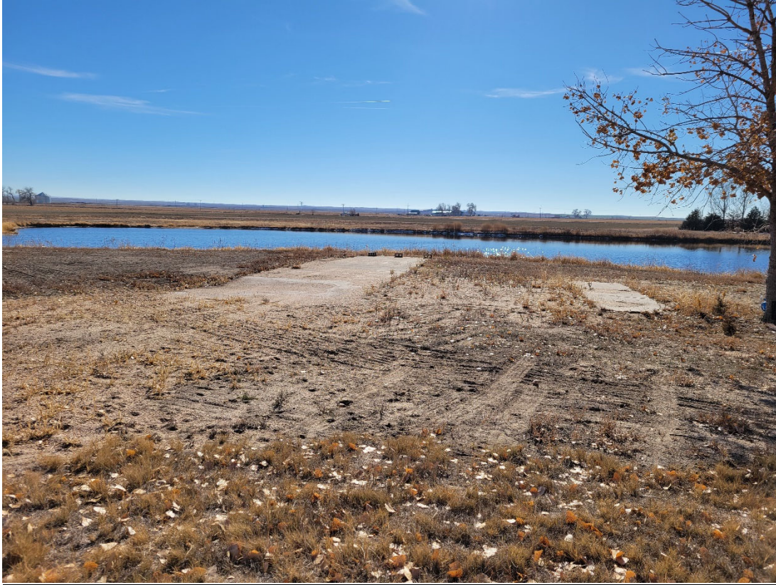
RV/camping area on north side of pond.