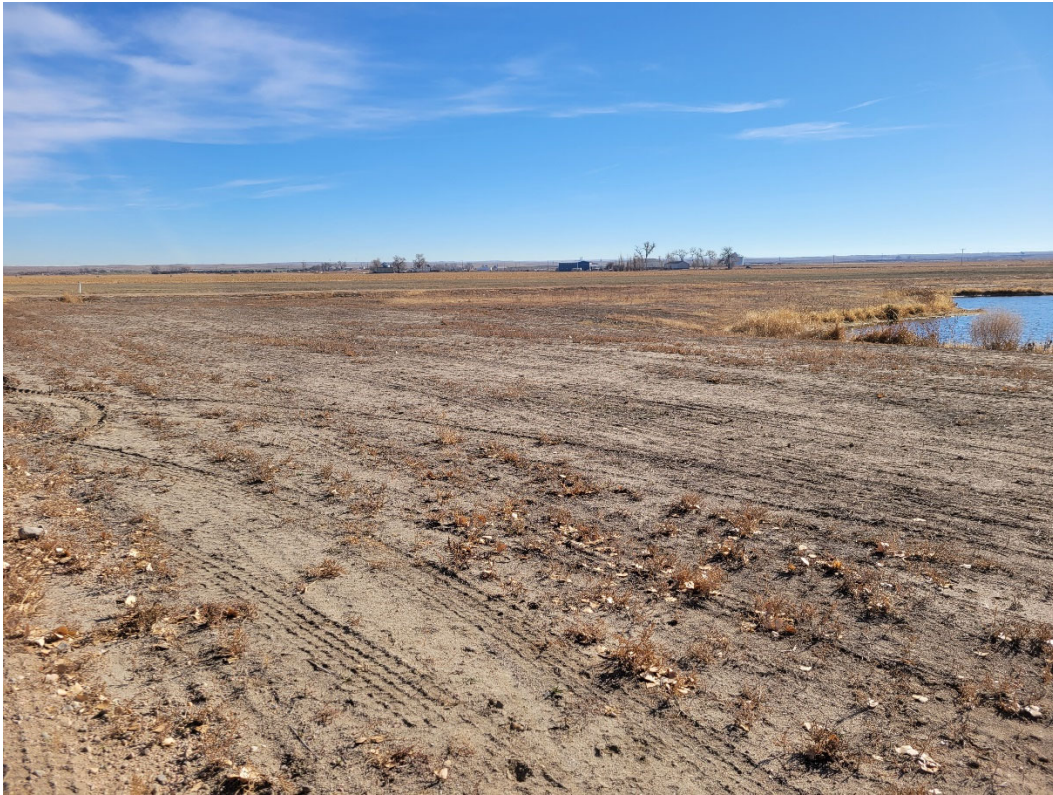
Looking east, northeast corner, seeded in 2021.