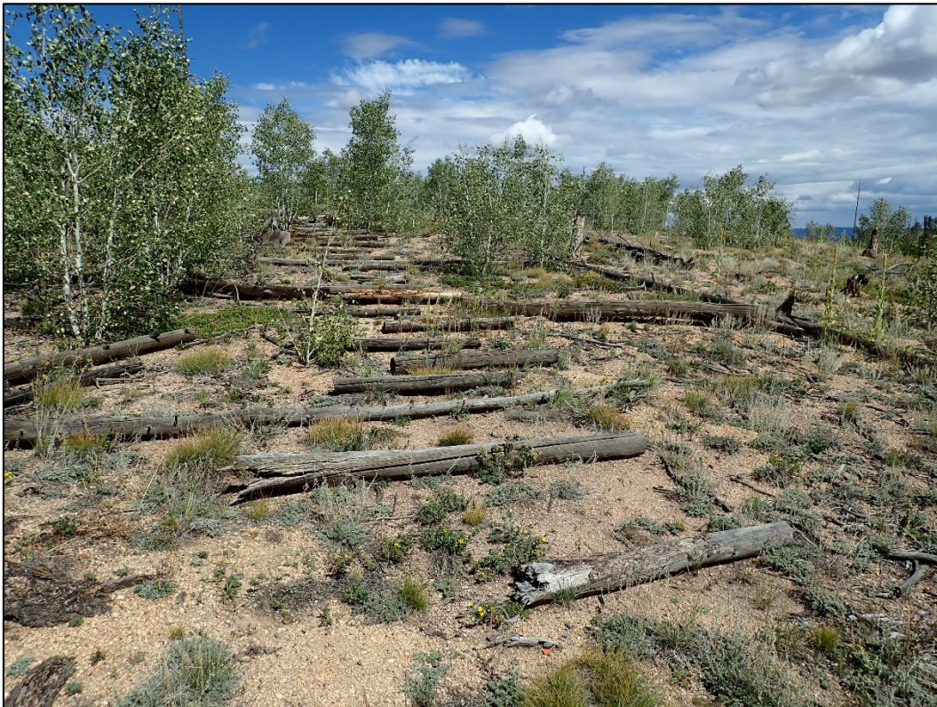
Photo 3. Area between the Operator's camp and the dig sites which has an excessive amount of downed timber laid across the access route; looking northeast.