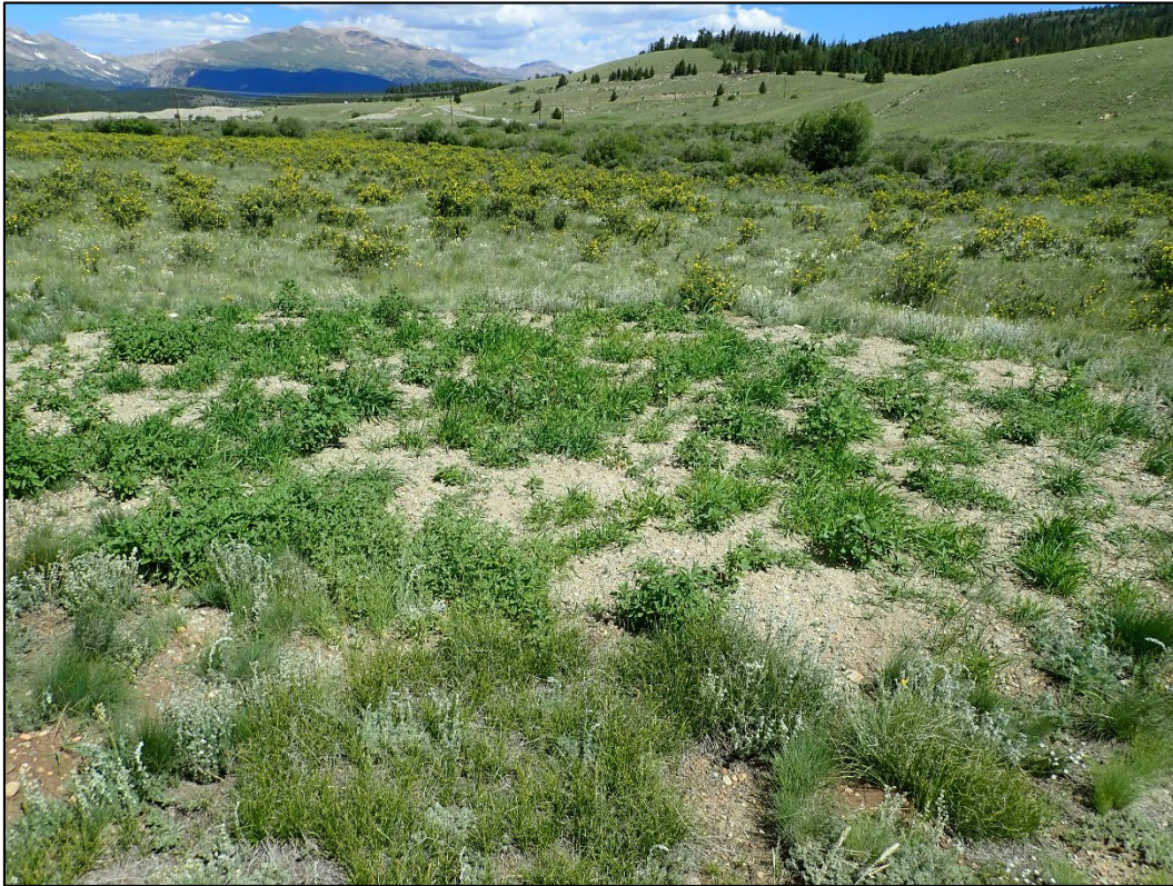
Photo 3. Backfilled and revegetated mud pit area; looking northwest.

Jodi Fitzpatrick Golden Cross Aggregates, Inc 601 Bath Street Metairie, LA 70001