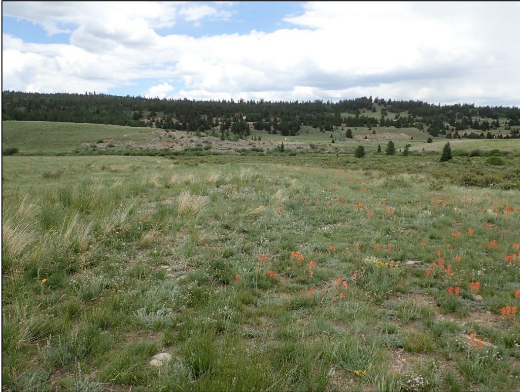
Photo 1. Reclaimed access road off of Platte Drive; looking northeast.