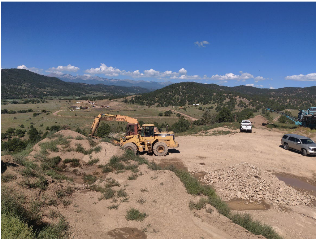
View of Area 2 from the highwall looking west