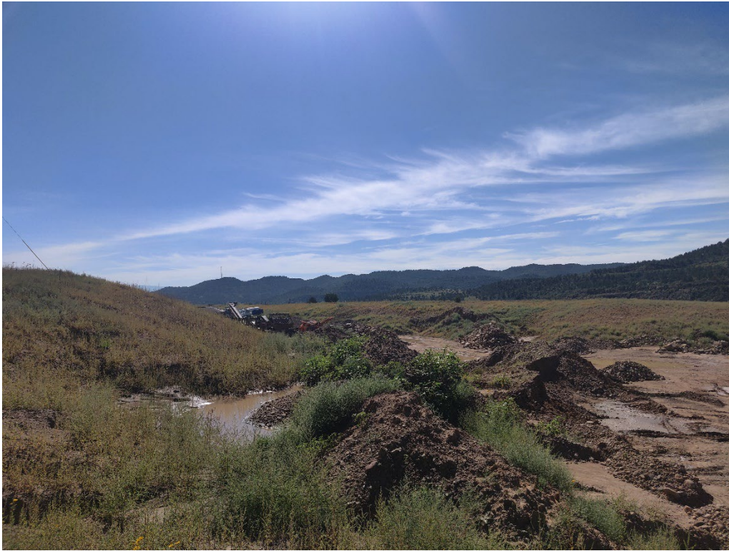
View of the Area 1 disturbance in the southwest corner of the area looking southeast