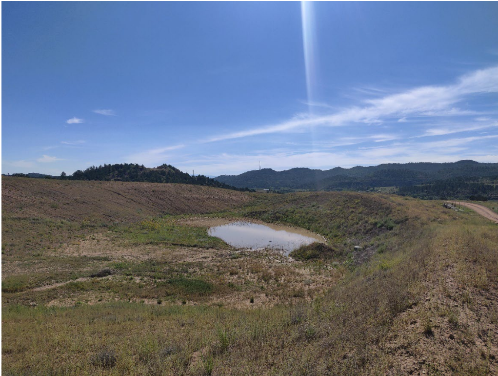
View of the water impoundment area located in the eastern portion of Area 1