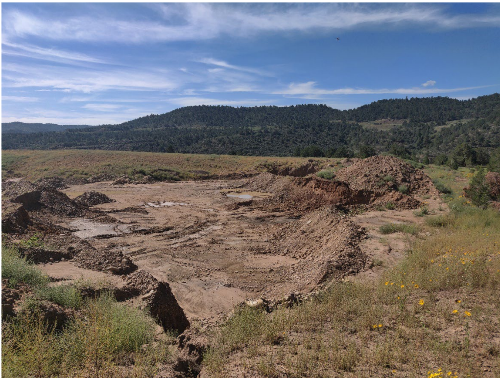
View of the highwall located in the southwest corner of Area 1 from the north side looking south