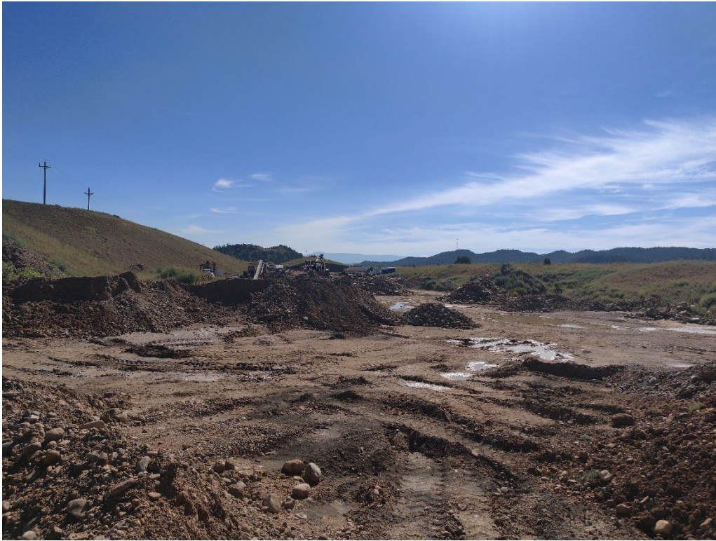
View of the Area 1 disturbance in the southwest corner of the area looking east