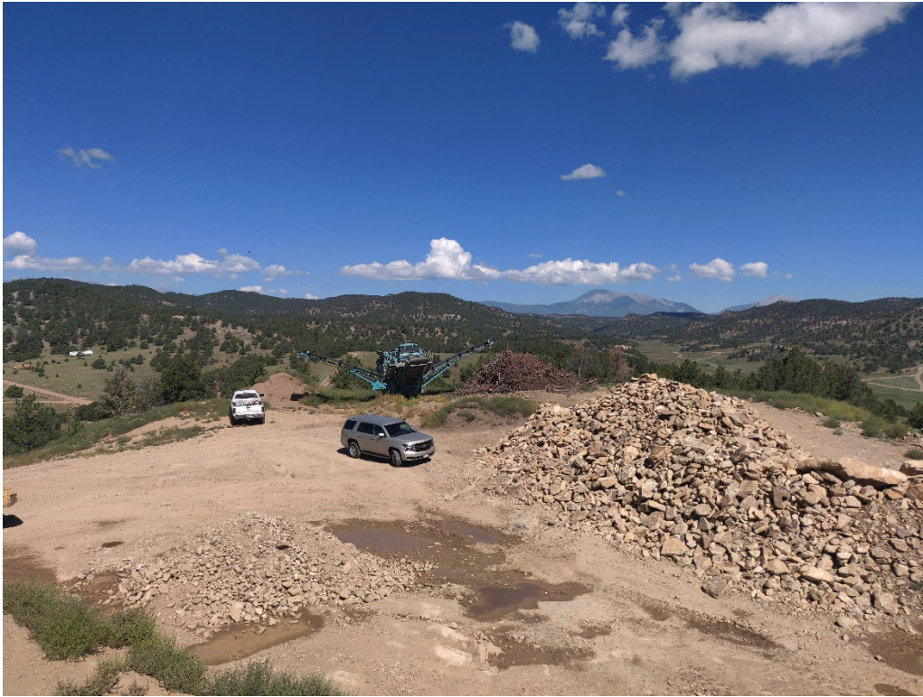
View of Area 2 from the highwall looking north