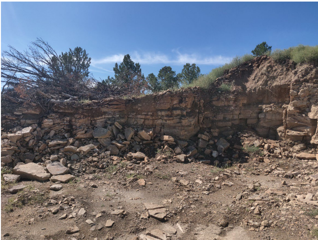
View of the Area 2 highwall looking south