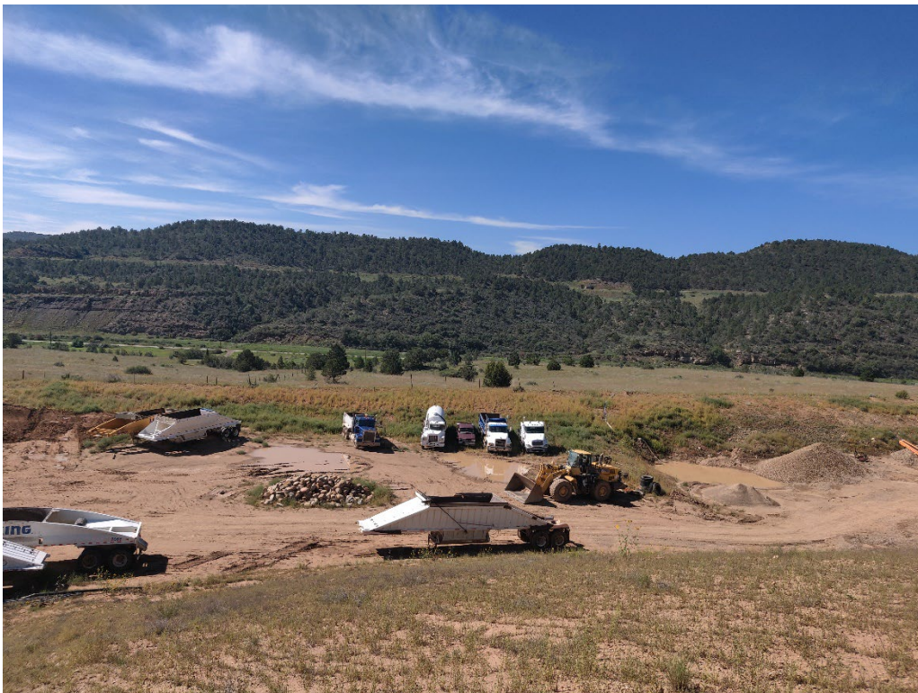
View of the Area 1 equipment storage area looking south