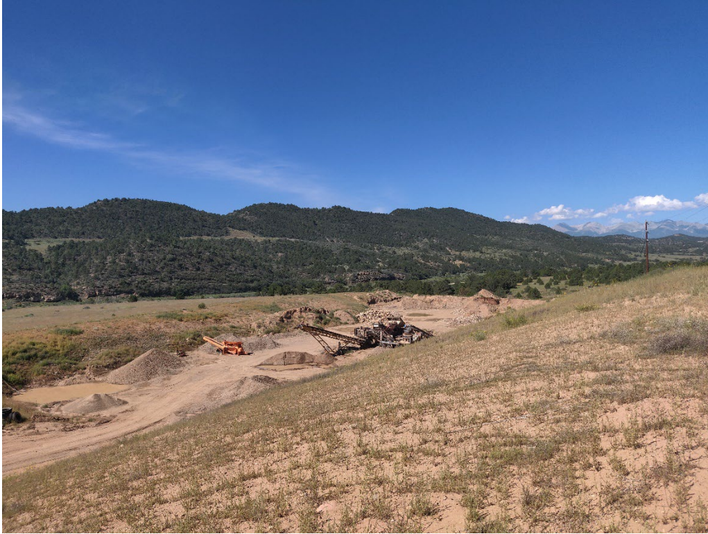
View of the Area 1 disturbance in the southwest corner of the area looking southwest