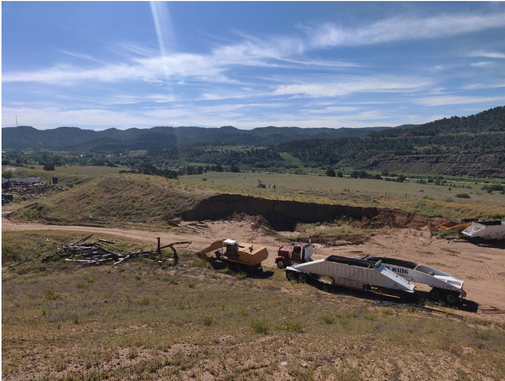
View of the Area 1 equipment storage area and highwall looking southeast