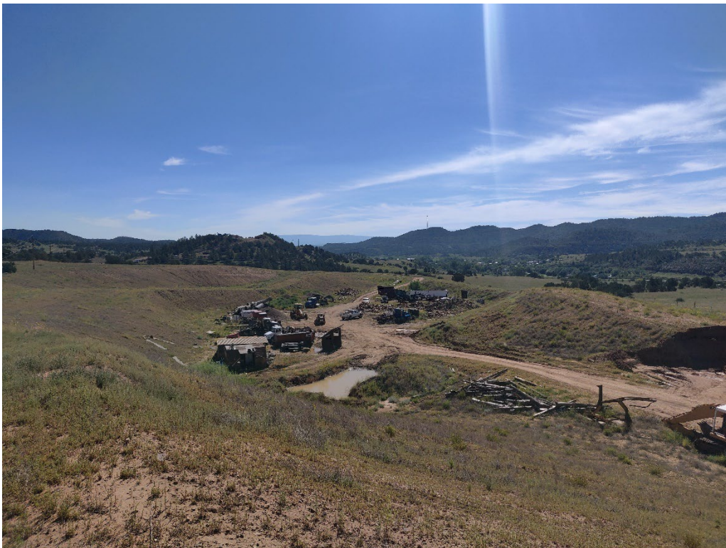
View of the Area 1 equipment storage area and highwall looking east