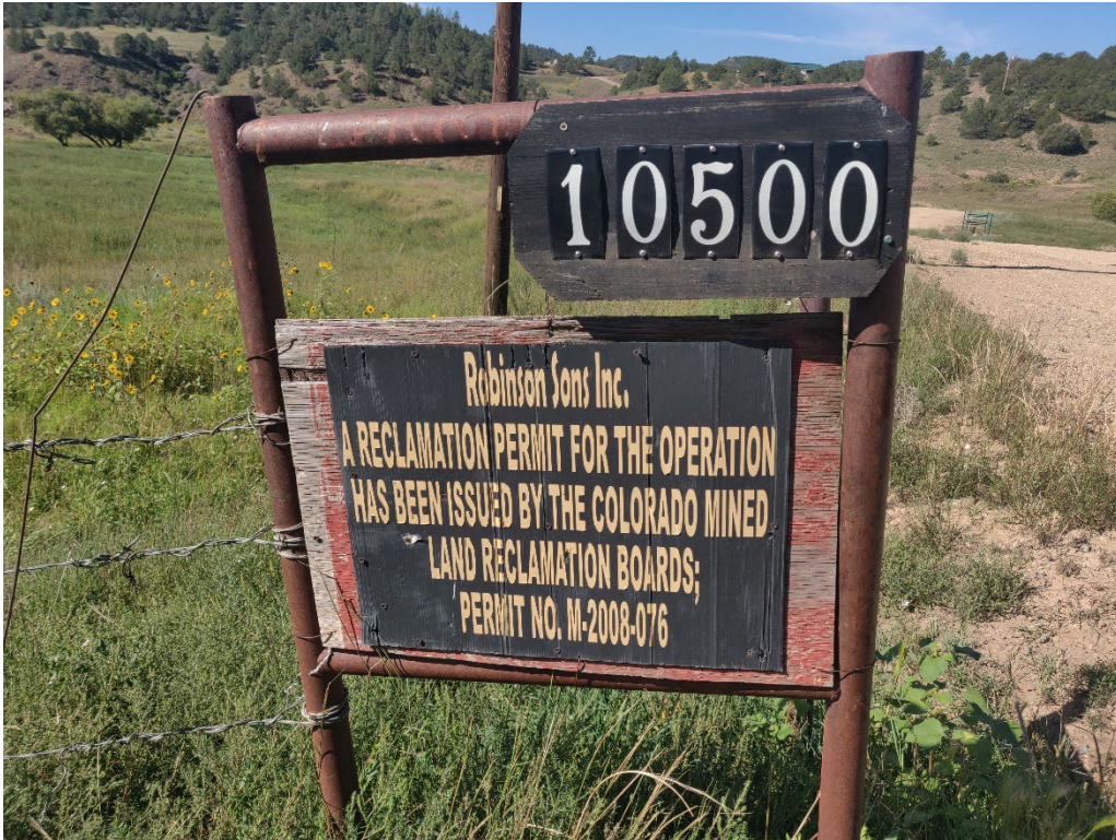
Robinson Pit mine sign