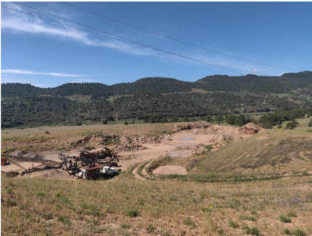
View of the Area 1 disturbance in the southwest corner of the area looking southwest