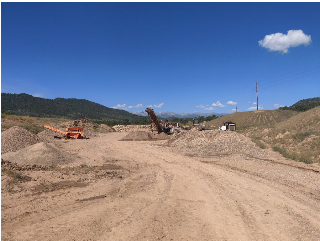
View of the Area 1 disturbance in the southwest corner of the area looking west