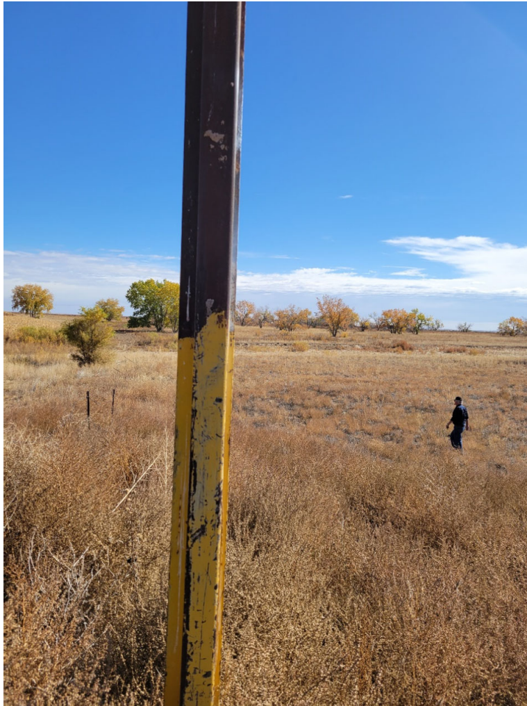
Looking south east from the northwest boundary marker.