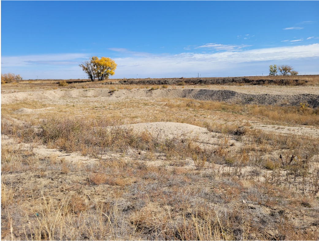
Small pit in former wash basin area.