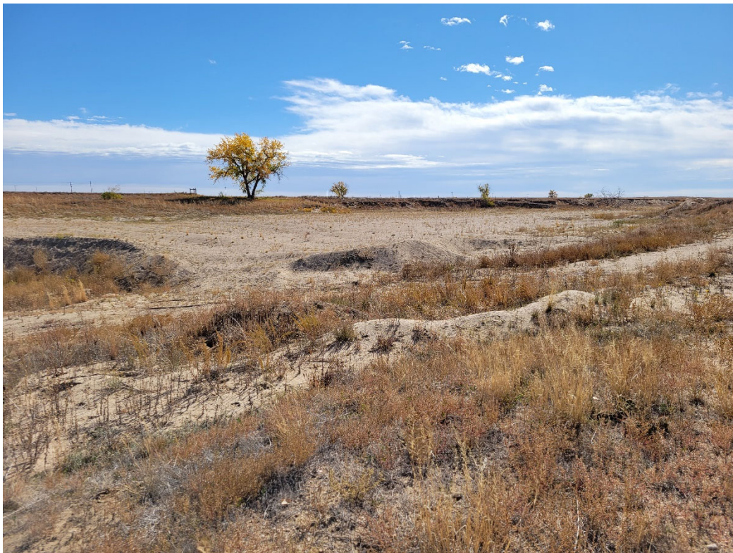
Looking south down the previously mined creek channel.