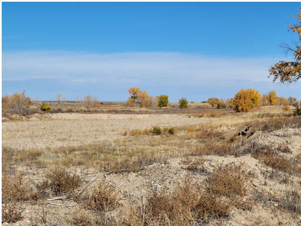
Looking northwest, pit area adjacent to creek channel.