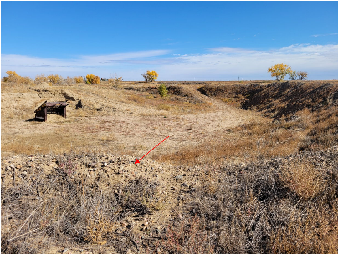
Small pit, west of the creek. Red arrow points to backfill occurring along the western edge.