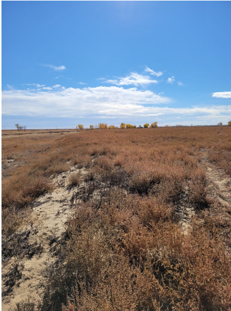
Photo shows sandy soils and Russian thistle that are prevalent across the permit area.