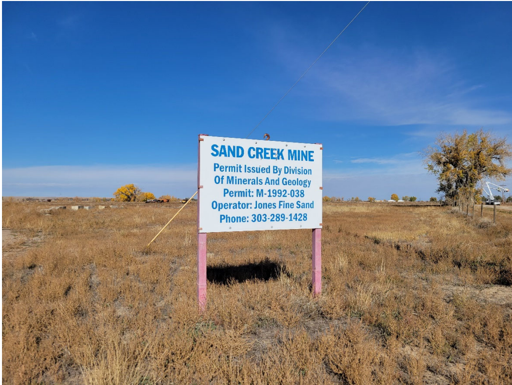
Mine sign posted at front entrance.