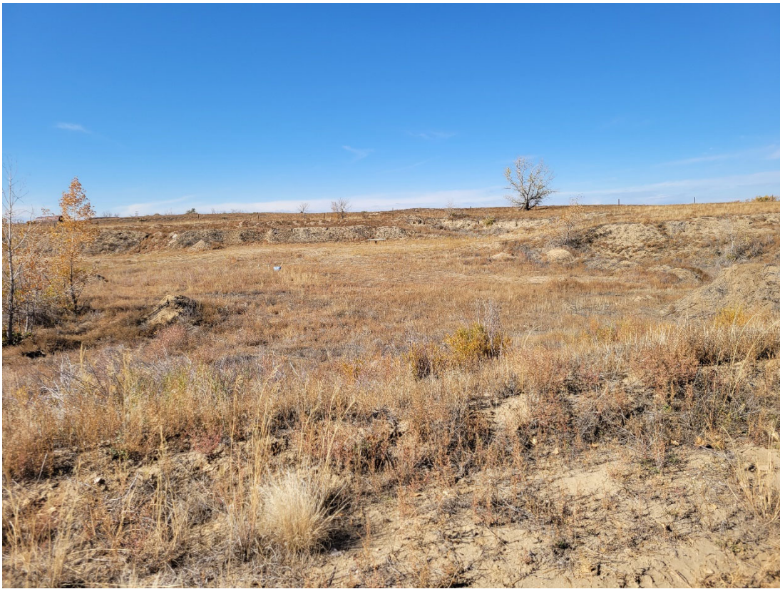
Older wash pit on the northwest end of the affected