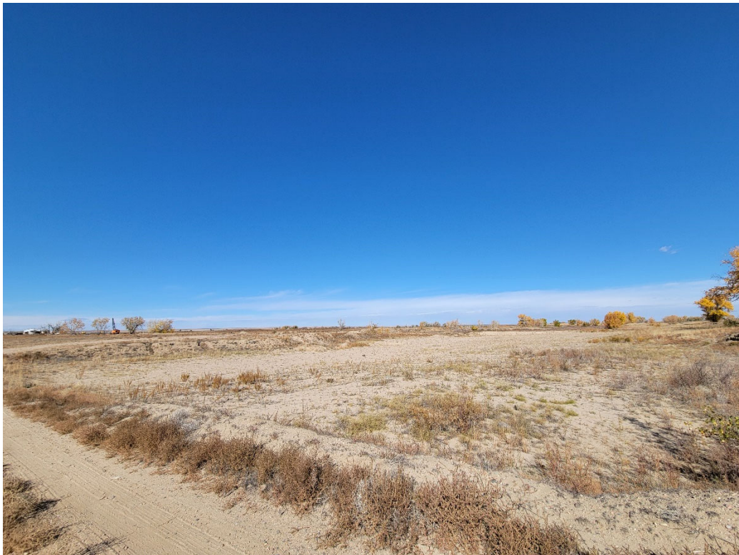
Looking north down main creek channel from access road