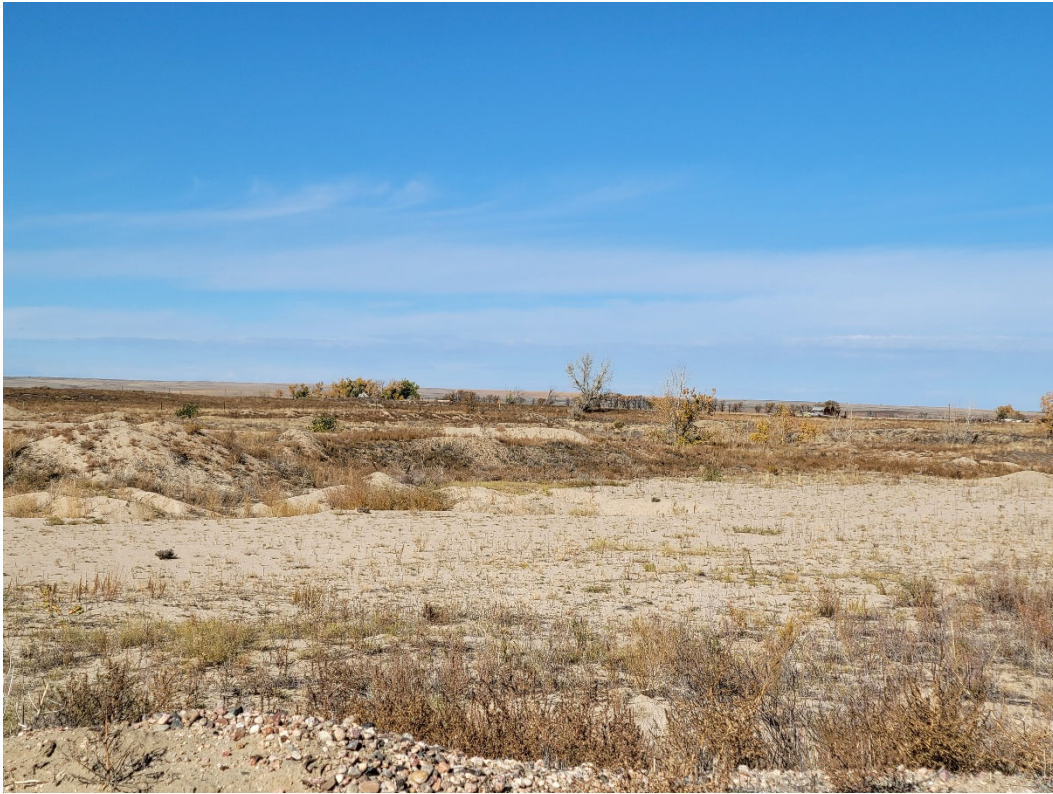
Looking northwest across creek channel near the southeast boundary, formerly mined.