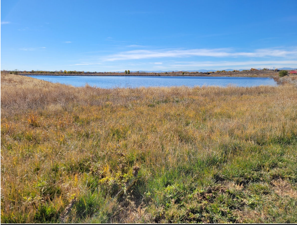
Looking southwest across Lake 3