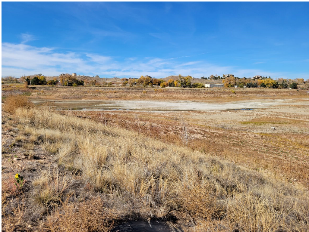
Looking west across Lake 2.