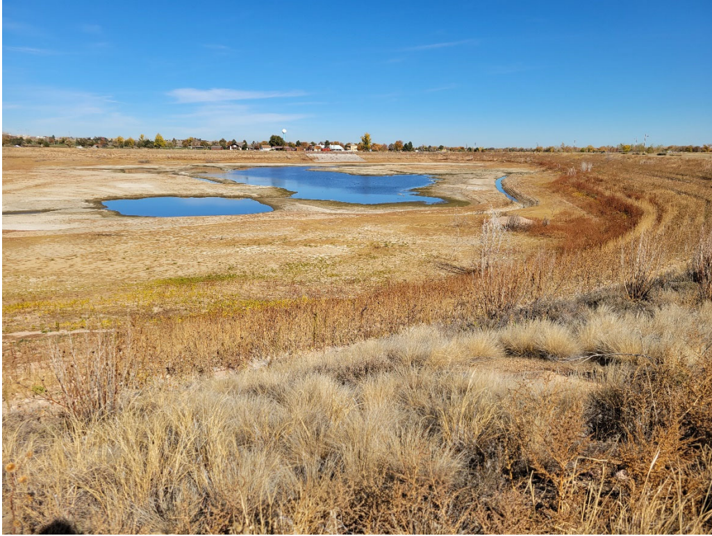
Looking north across Lake 2.