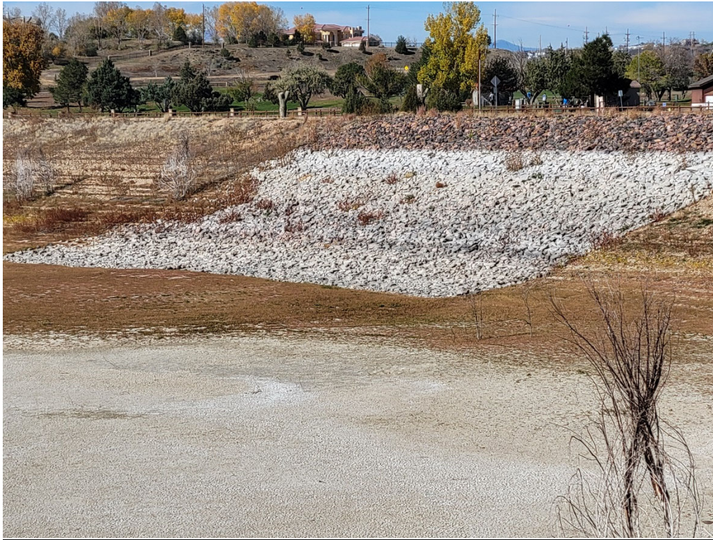
North side of Lake 2 – area repaired after 2013 flood.