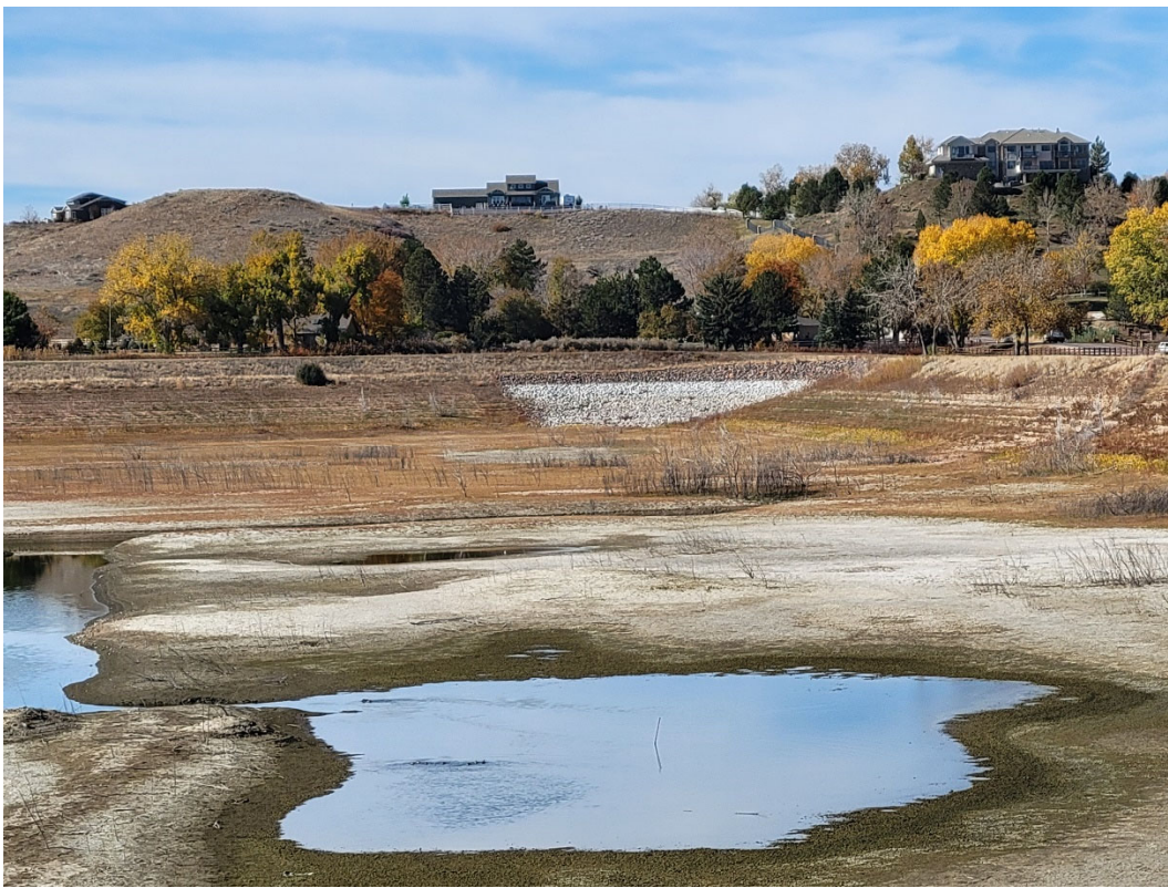
Northwest side of Lake 2 – area repaired after 2013 flood.