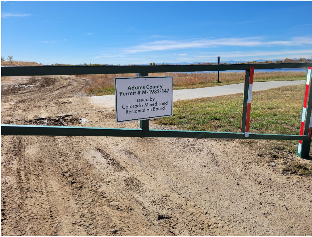
Mine sign at entrance between Lakes 1 & 3. Southwest corner of the permit area after the release.