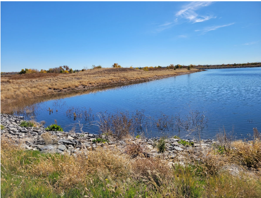
Looking south across Lake 3