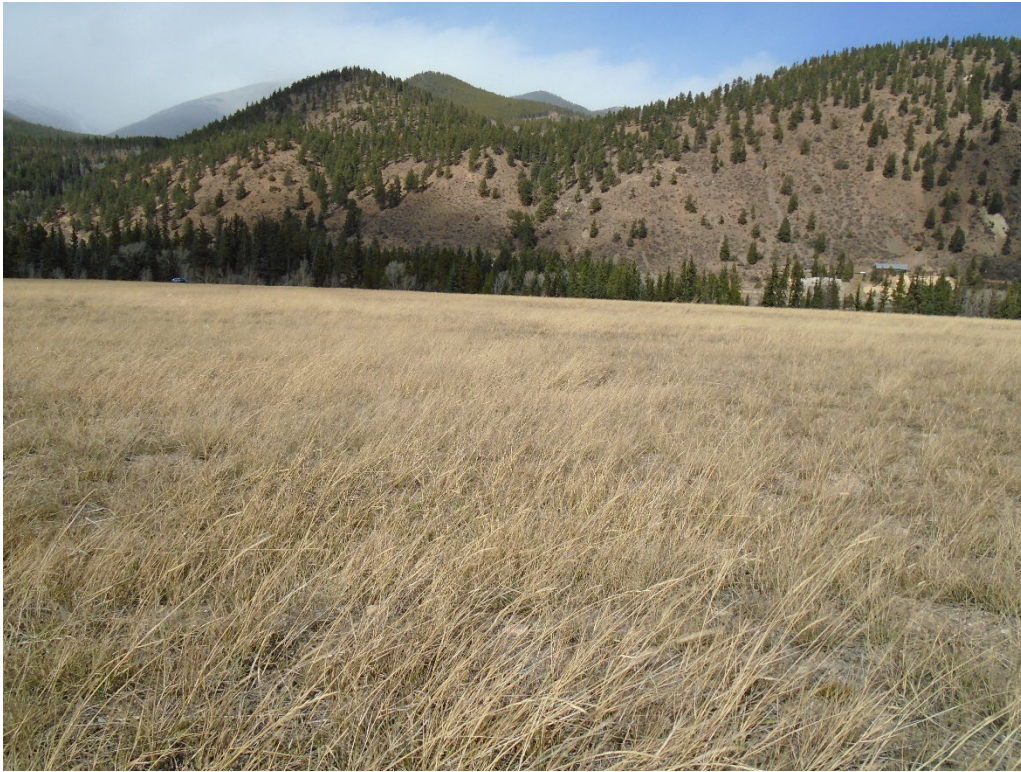
View of the site vegetation from the south side looking north