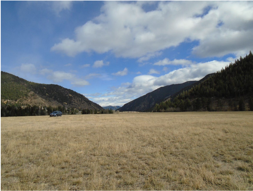
View of the site vegetation from the west side looking east