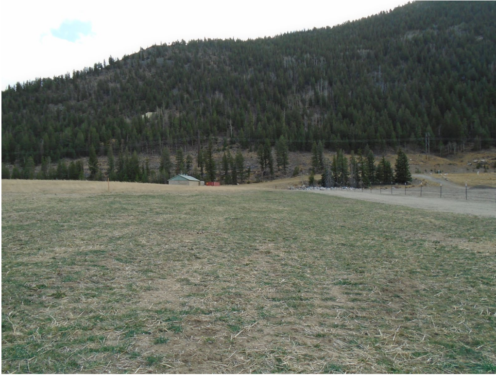
View of the site vegetation in the repaired alkaline area under TR4 looking south