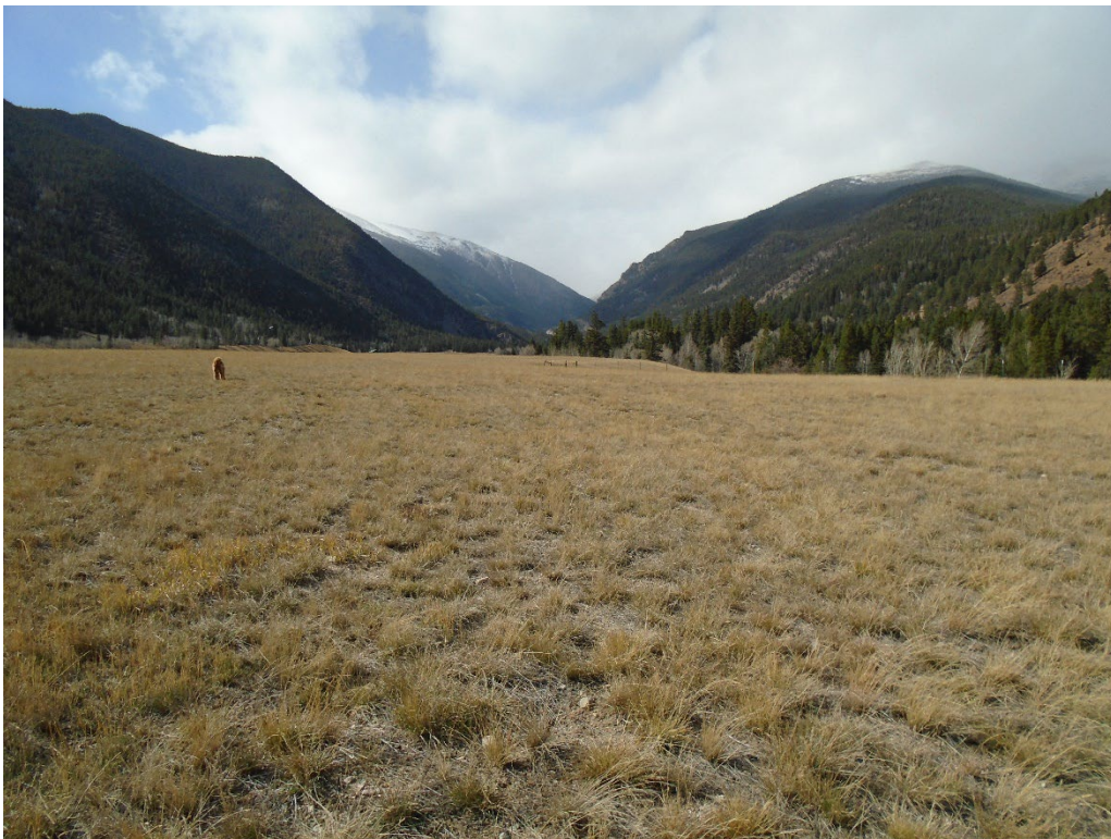
View of the site vegetation from the middle of the site looking west