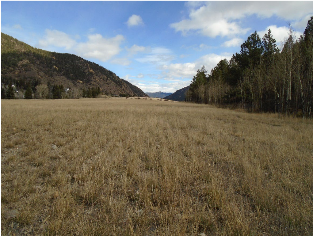
View of the site vegetation from the south side looking east