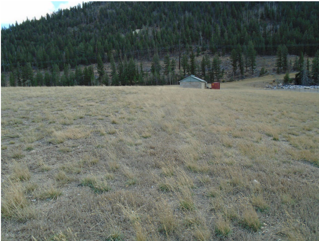
View of the site vegetation in the western end of the site looking south