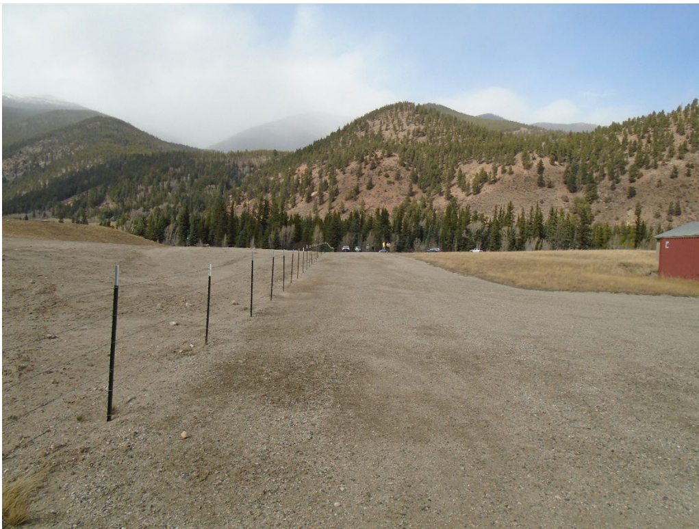
View of the access road constructed under TR4 from the south end looking north