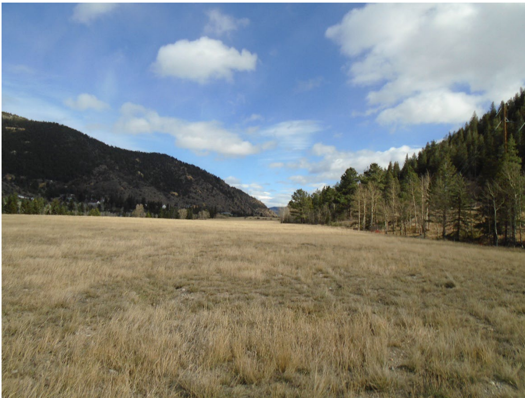
View of the site vegetation from the south side looking east