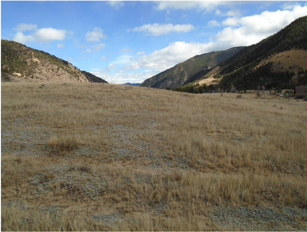
View of the vegetation in the pasture located east of the site