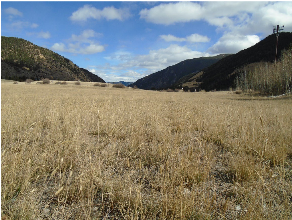
View of the site vegetation from the east side looking west