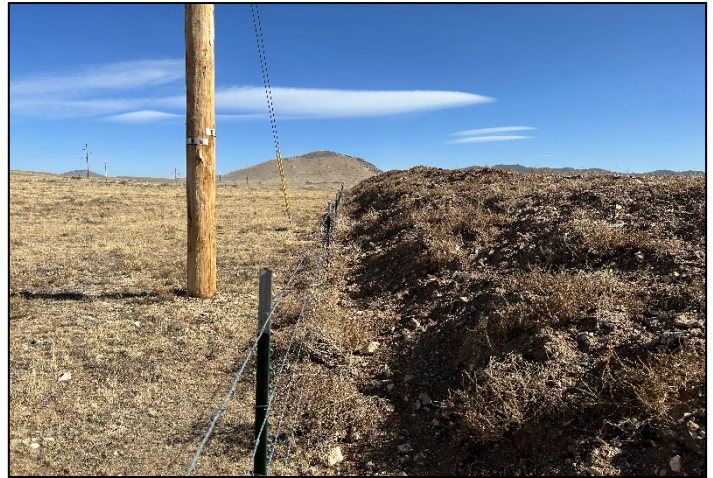
Photo 2 – Overhead utility pole significantly closer than 200 feet from permit boundary fence.