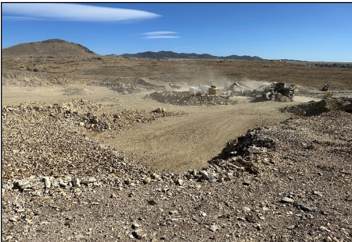
Photo 3 – Overview from NW to SE across active area of site with crusher operation.