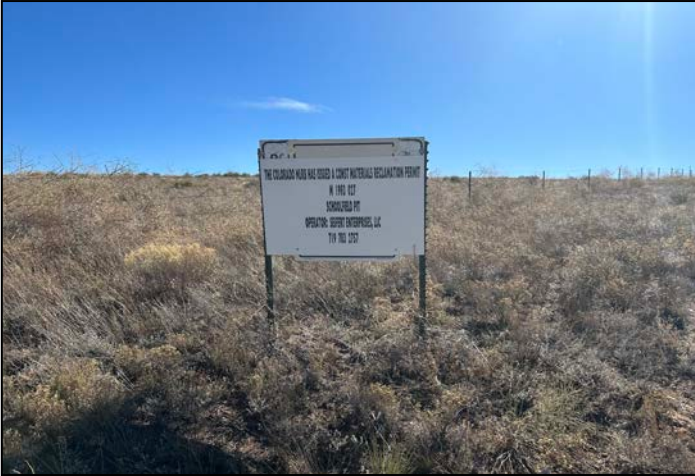
Photo 1 – Site identification sign located on south side of CR 328 at site access road.