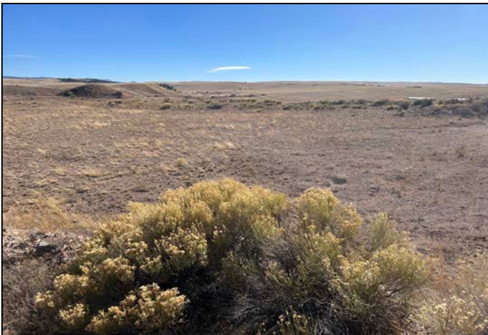
Photo 3 – Photo taken from pit entrance looking S at affected area.