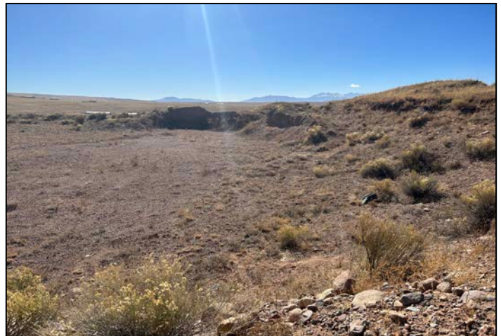
Photo 4 – Photo taken from pit entrance looking SW at affected area.