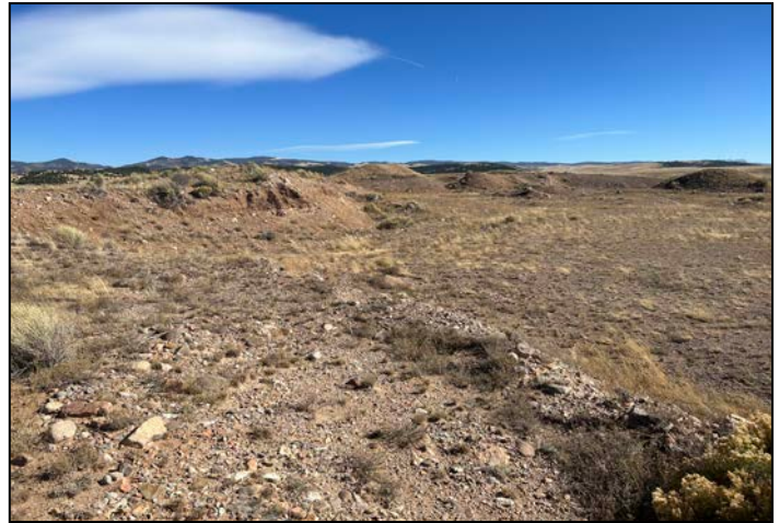
Photo 2 – Photo taken from pit entrance looking SE at affected area.