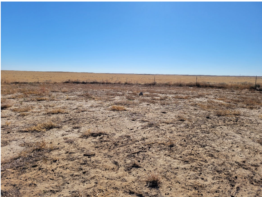
Looking east at permit boundary. Mostly bare ground. Barbed wire fence surrounds the site.