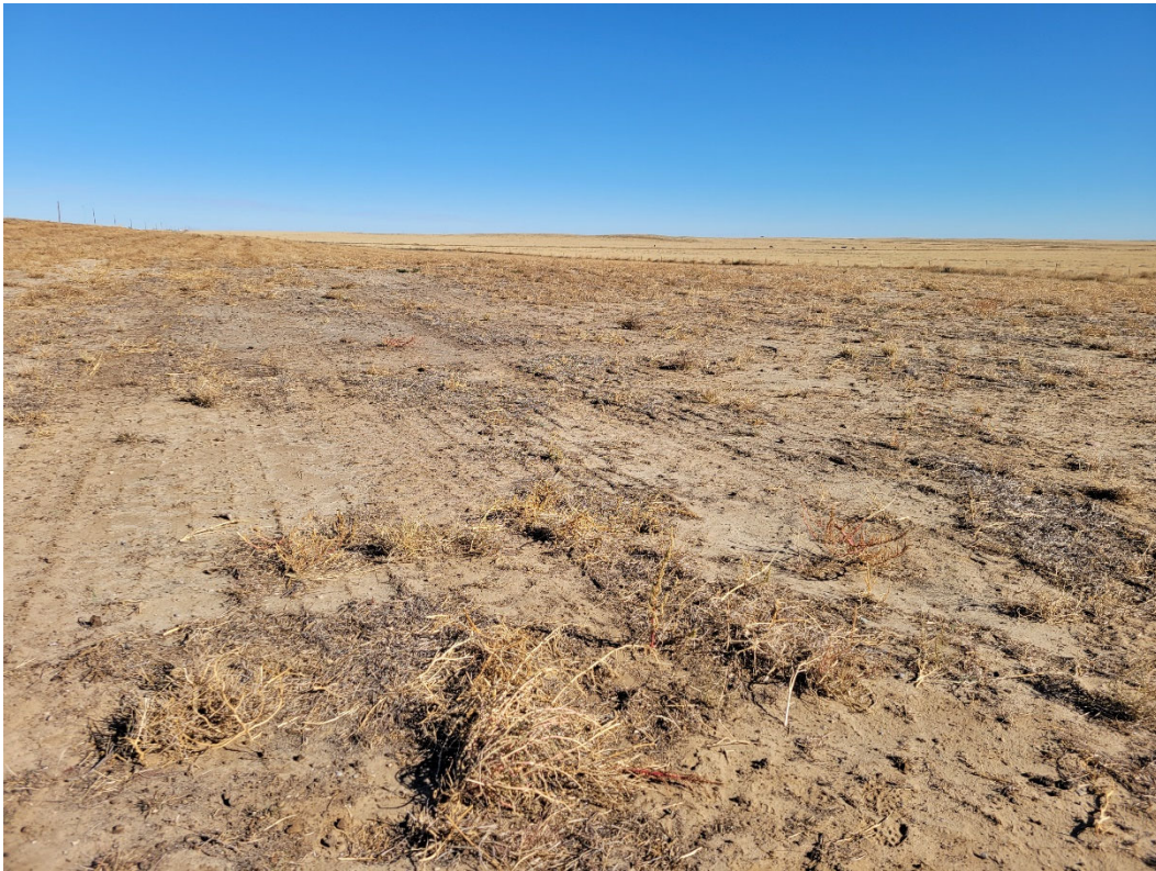
Looking north across the graded area. Annual weed stalks.