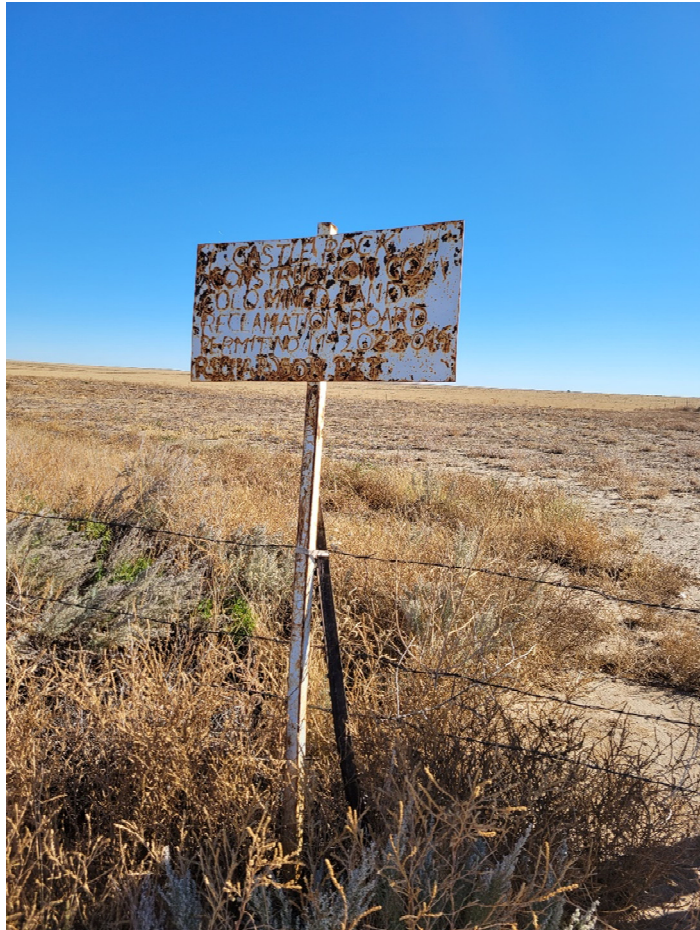
Sign at the entrance to the site.