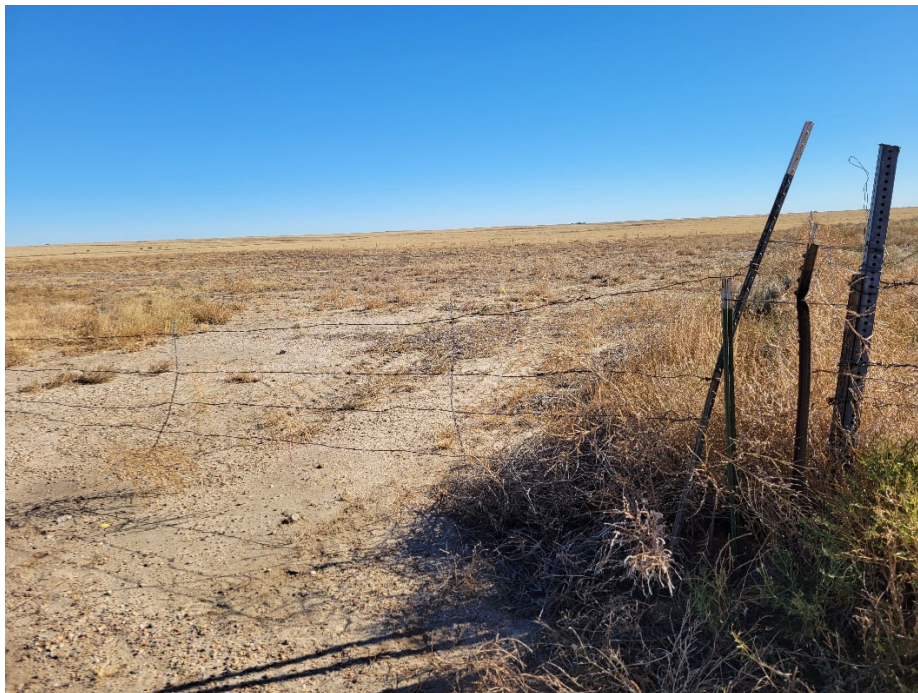
Entrance to the site. Soil is compacted and bare here.