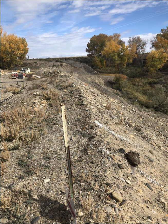
South side of site