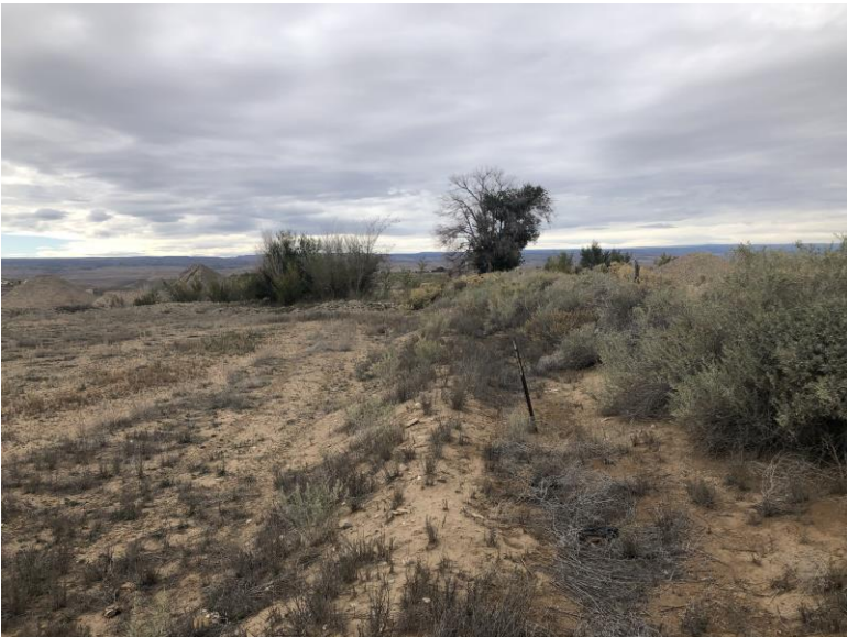
North side of site