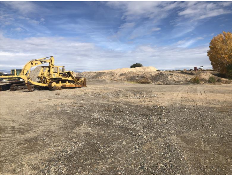
Material piles and equipment