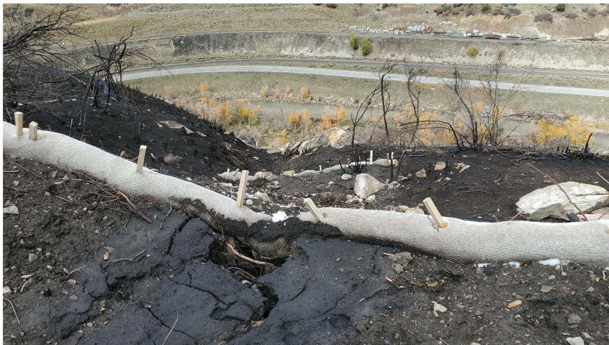
Figure 4: Evidence of surface erosion

Number of Partial Inspection this Fiscal Year: 1