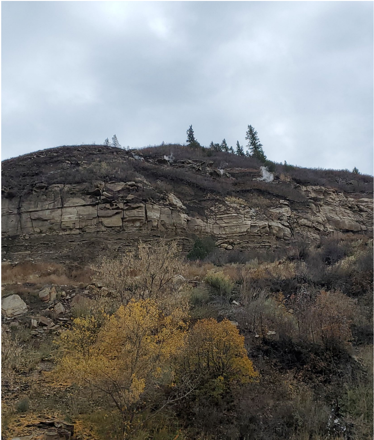
Figure 1: Smoke/steam visible from below

Number of Partial Inspection this Fiscal Year: 1