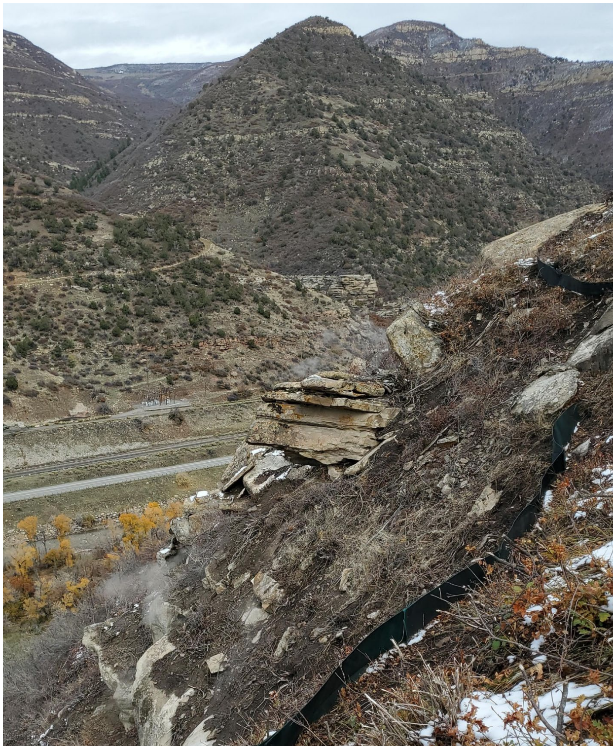
Figure 2: Vents below top of new road (1 of 2)

Number of Partial Inspection this Fiscal Year: 1