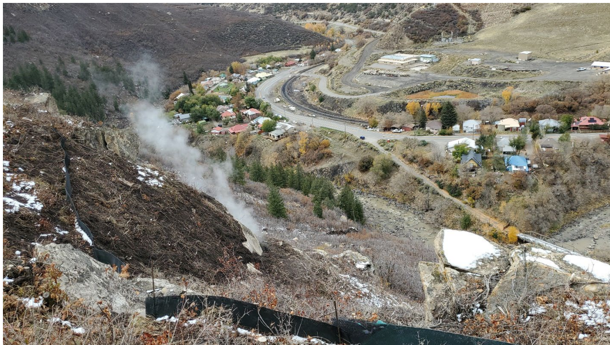
Figure 3: Vents below top of new road (2 of 2)