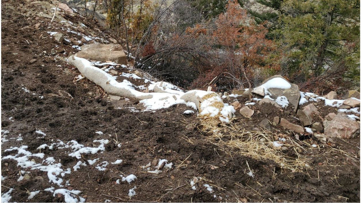
Figure 5: Straw wattle damage

Number of Partial Inspection this Fiscal Year: 1