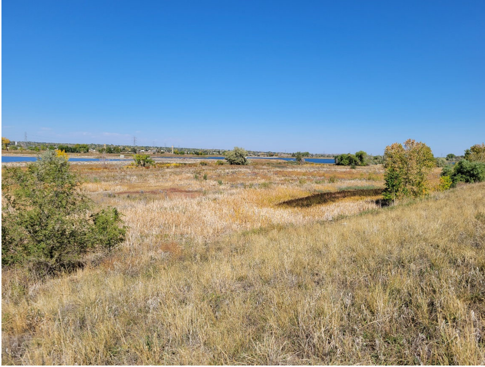
Looking north across wetland mitigation area.