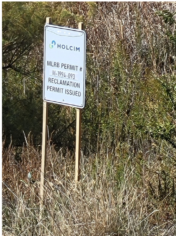
Mine sign posted at the southern end of the wetland mitigation area.