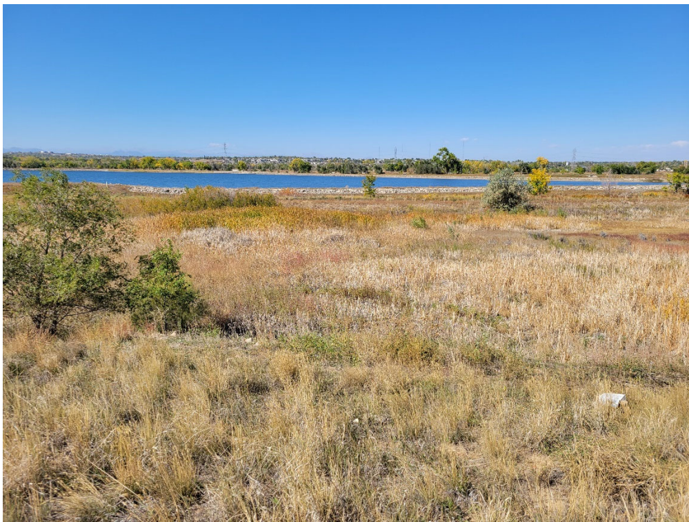
Looking west across west mitigation area