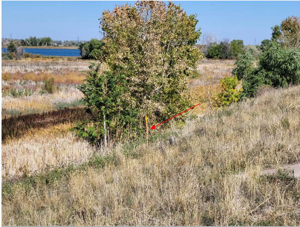
Boundary marked by stakes painted yellow at the top.