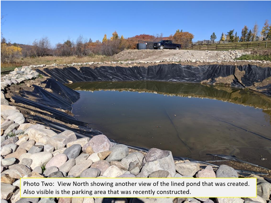
Photo Two: View North showing another view of the lined pond that was created. Also visible is the parking area that was recently constructed.