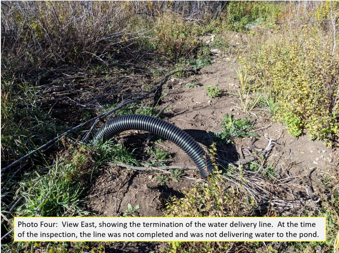
Photo Four: View East, showing the termination of the water delivery line. At the time of the inspection, the line was not completed and was not delivering water to the pond.