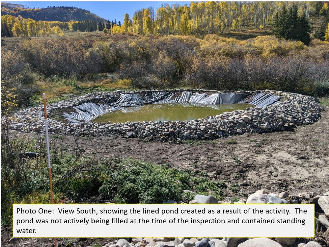
Photo One: View South, showing the lined pond created as a result of the activity. The pond was not actively being filled at the time of the inspection and contained standing water.