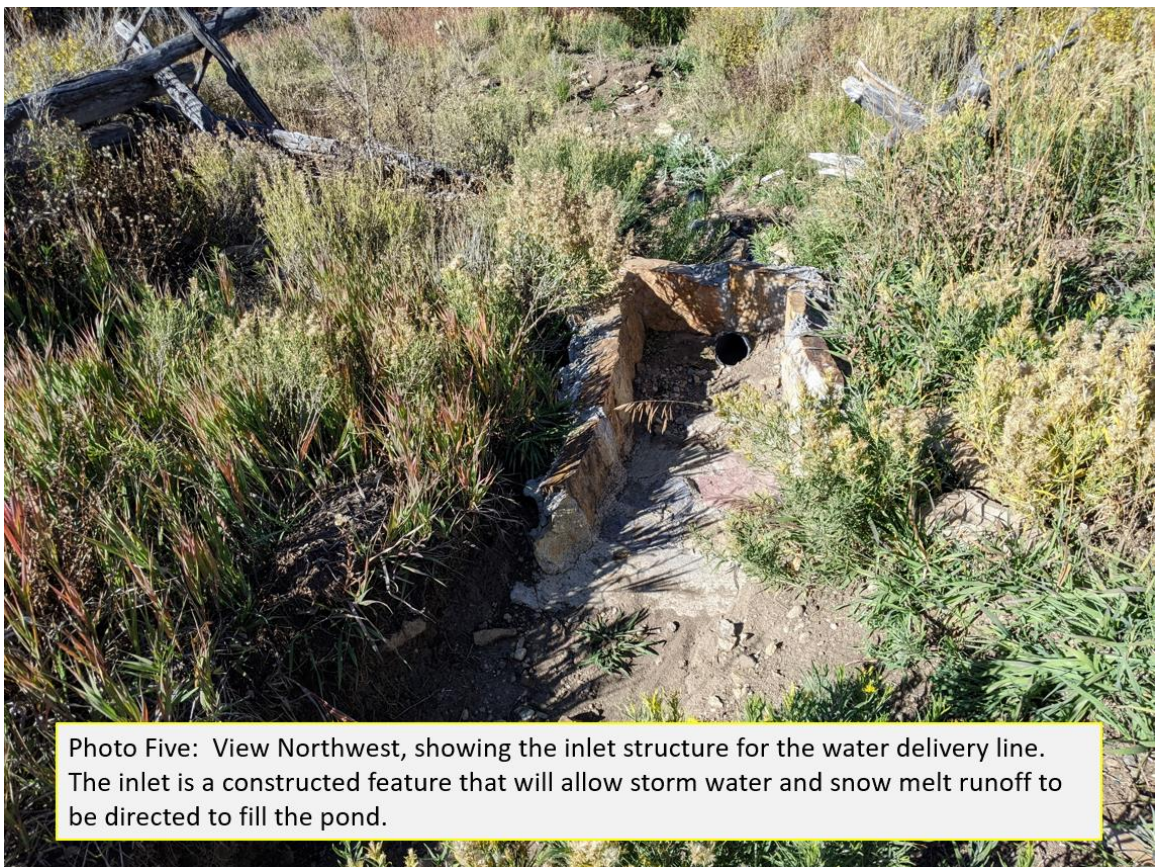
Photo Five: View Northwest, showing the inlet structure for the water delivery line. The inlet is a constructed feature that will allow storm water and snow melt runoff to be directed to fill the pond.