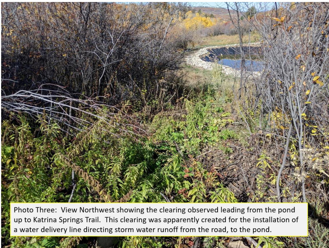
Photo Three: View Northwest showing the clearing observed leading from the pond up to Katrina Springs Trail. This clearing was apparently created for the installation of a water delivery line directing storm water runoff from the road, to the pond.