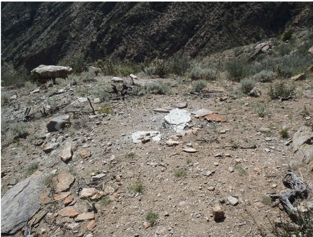
Photo 1. Drill site (looking SW – light gray caps visible, similar to surrounding rock outcrops).