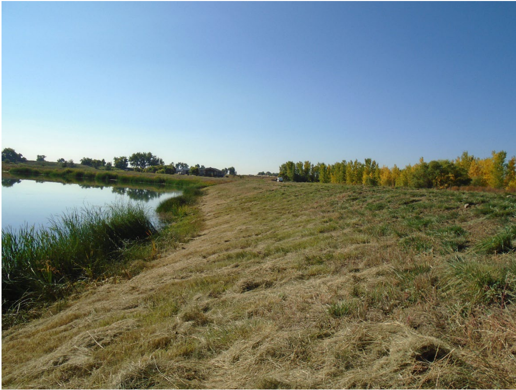
View of the southern portion of the western shoreline