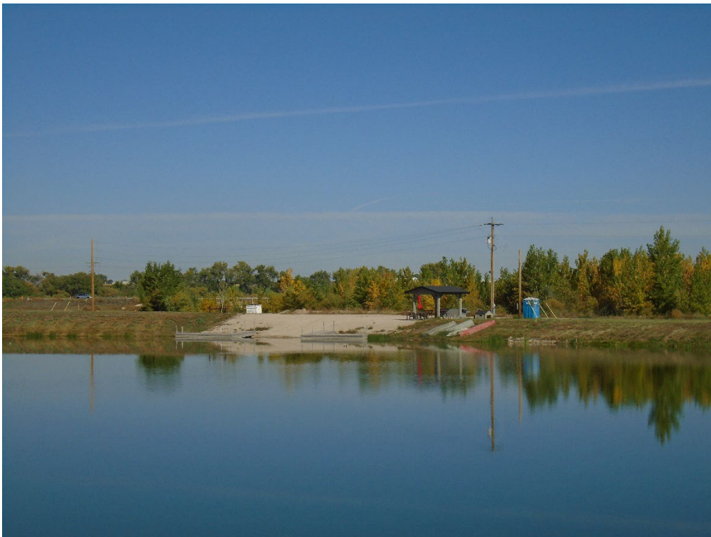
View of the boat dock in the northeast corner of the lake