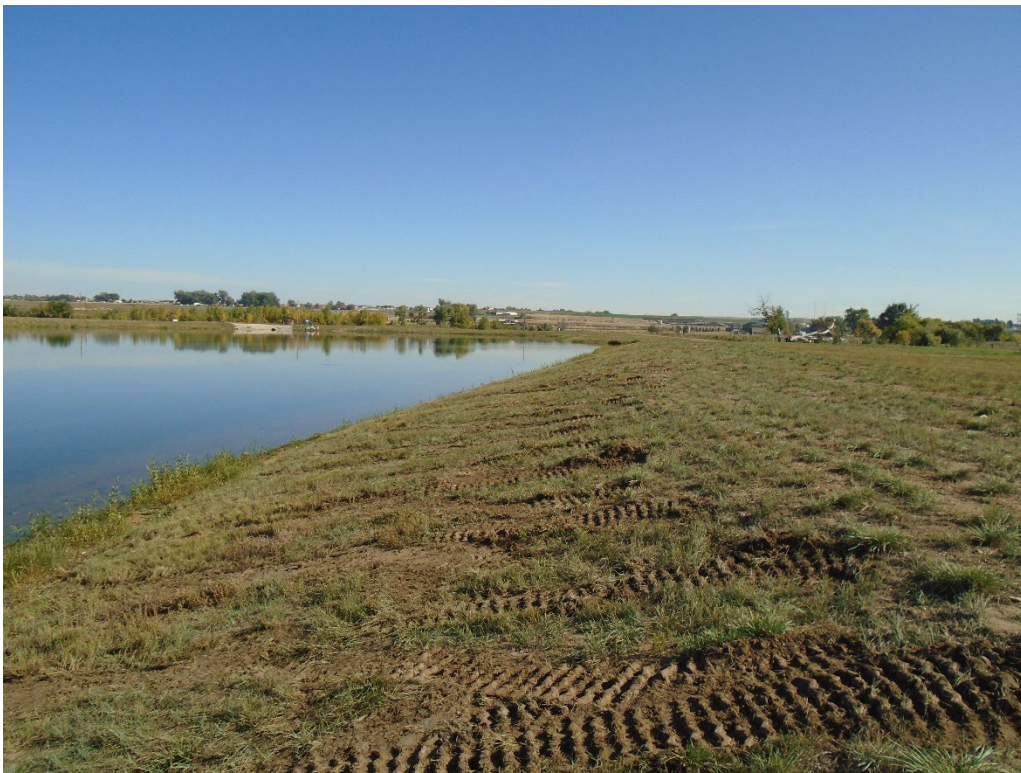
View of the southern portion of the eastern shoreline