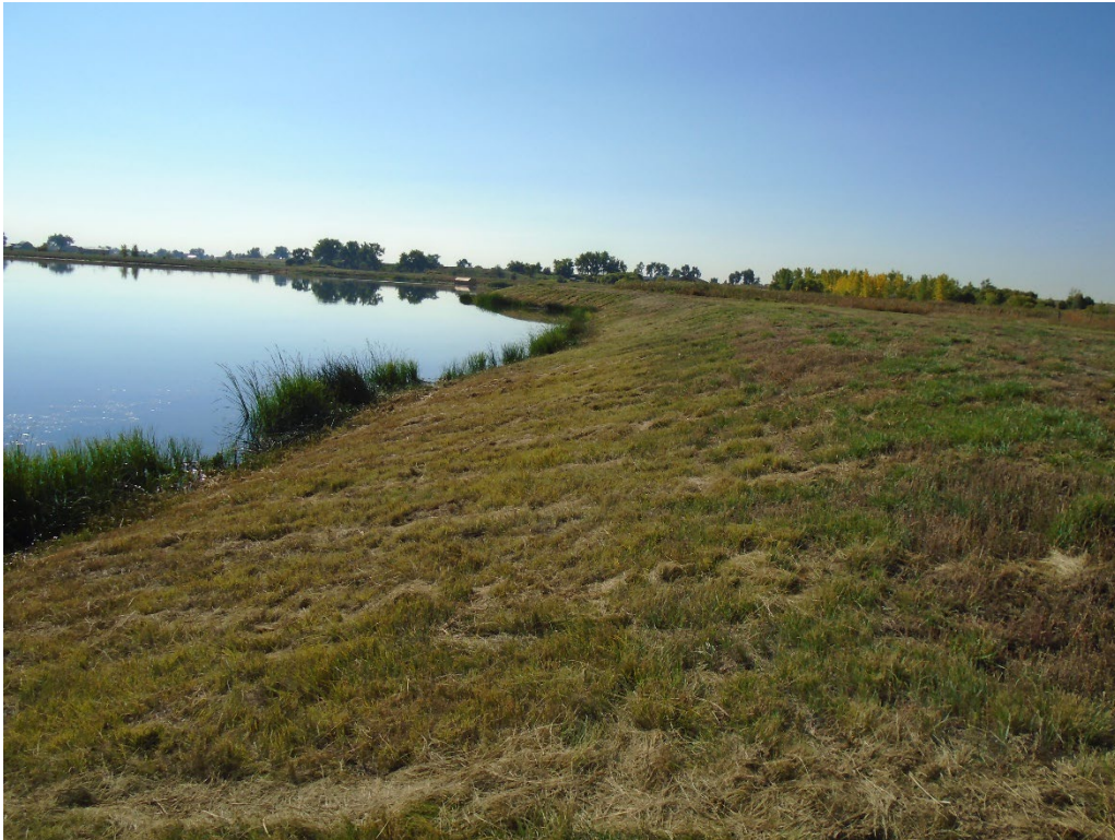
View of the northern portion of the western shoreline