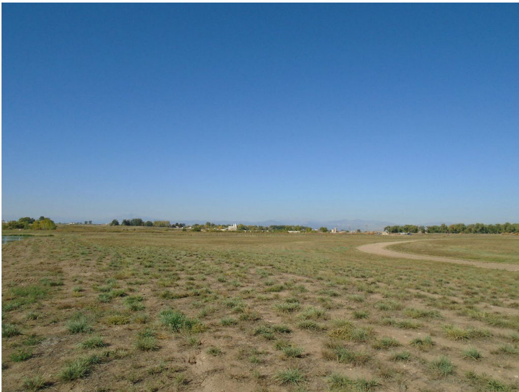
View of the northern shoreline, west of the boat dock, looking west