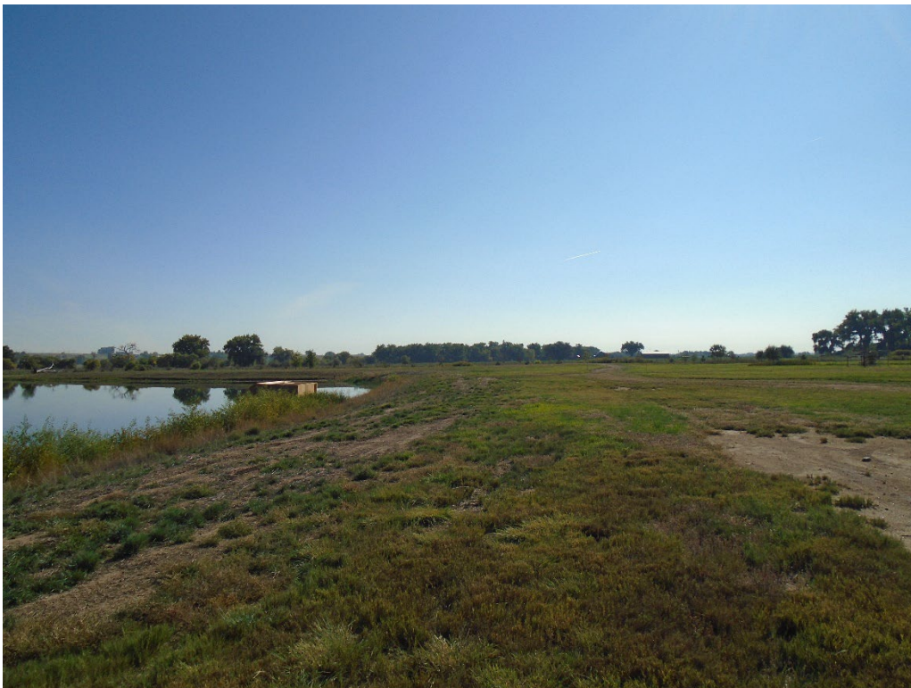
View of the southern shoreline from the southwest corner looking east