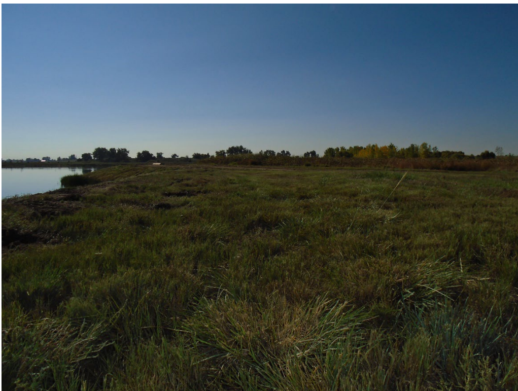
View of the vegetation along the western shoreline