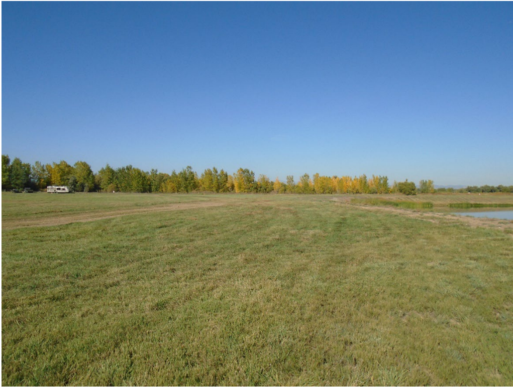
View of the southern shoreline looking west