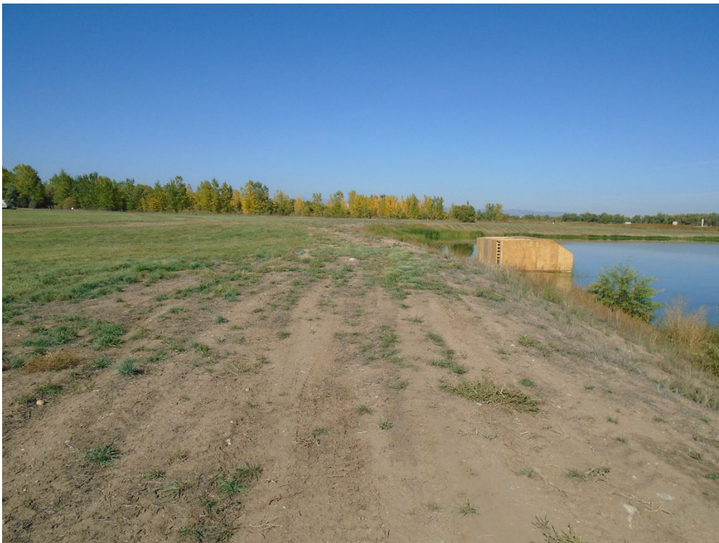
View of the fishing shed and tire tracks along the southern shoreline