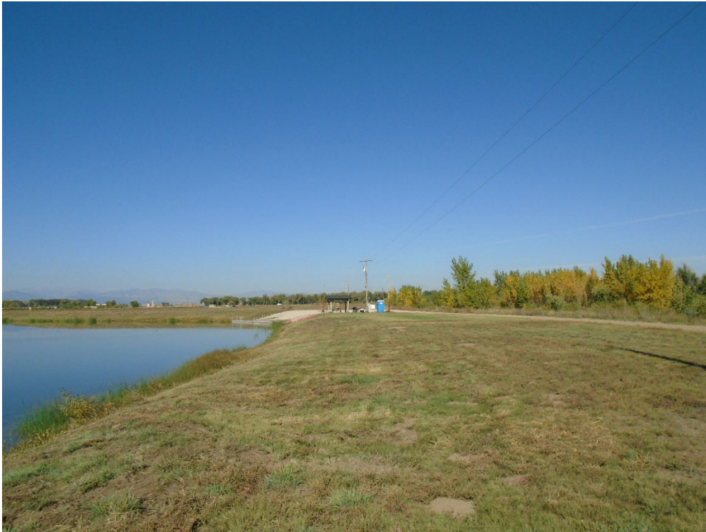
View of the northern shoreline from the northeast corner looking west