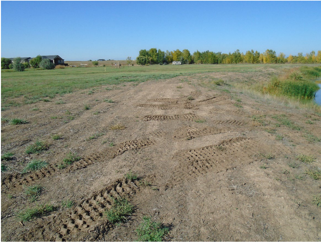
View of the southeast corner of the site