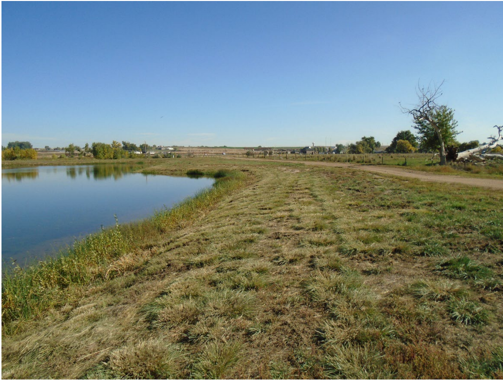
View of the northern portion of the eastern shoreline