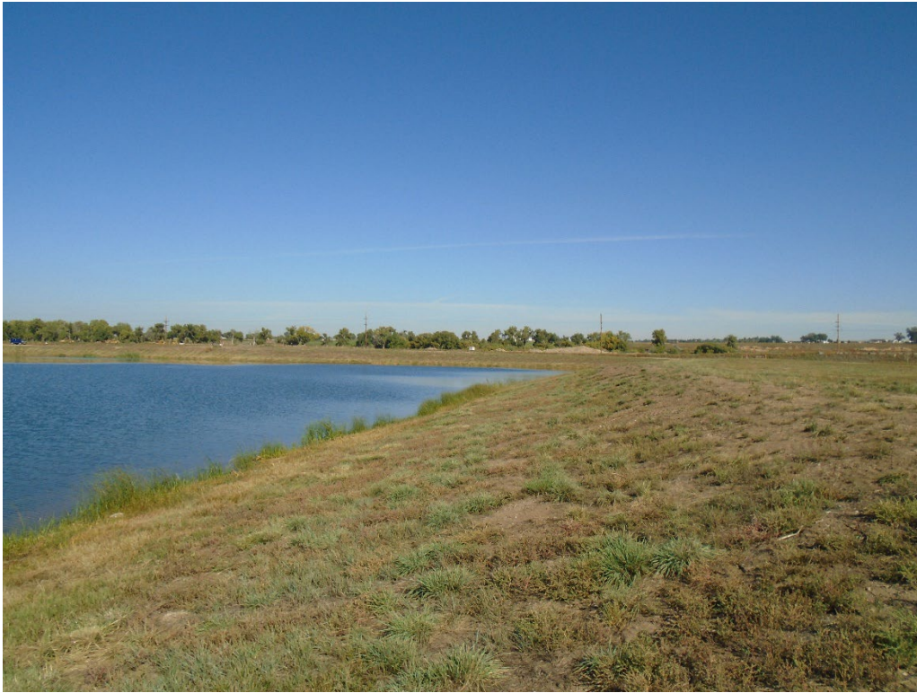
View of the northeast shoreline looking north

Stephanie Fancher-English Loveland Ready-Mix Concrete, Inc. P.O. Box 299 Loveland, CO 80539