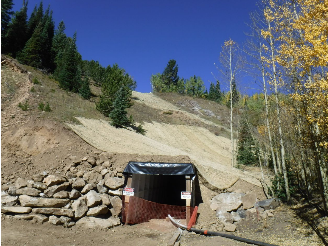
Photo 5: Looking up at Cross shaft remediation area from the Cross Mine portal