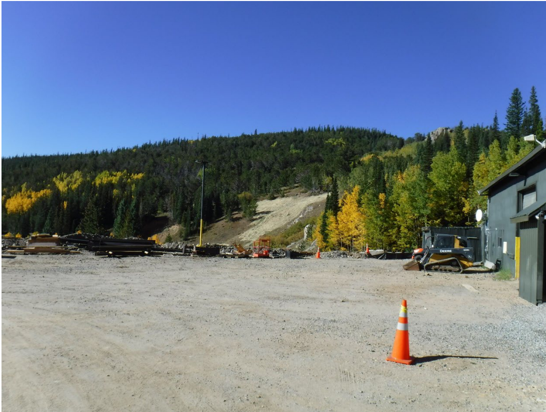
Photo 3: Looking west towards the Cross shaft remediation area from the main parking lot