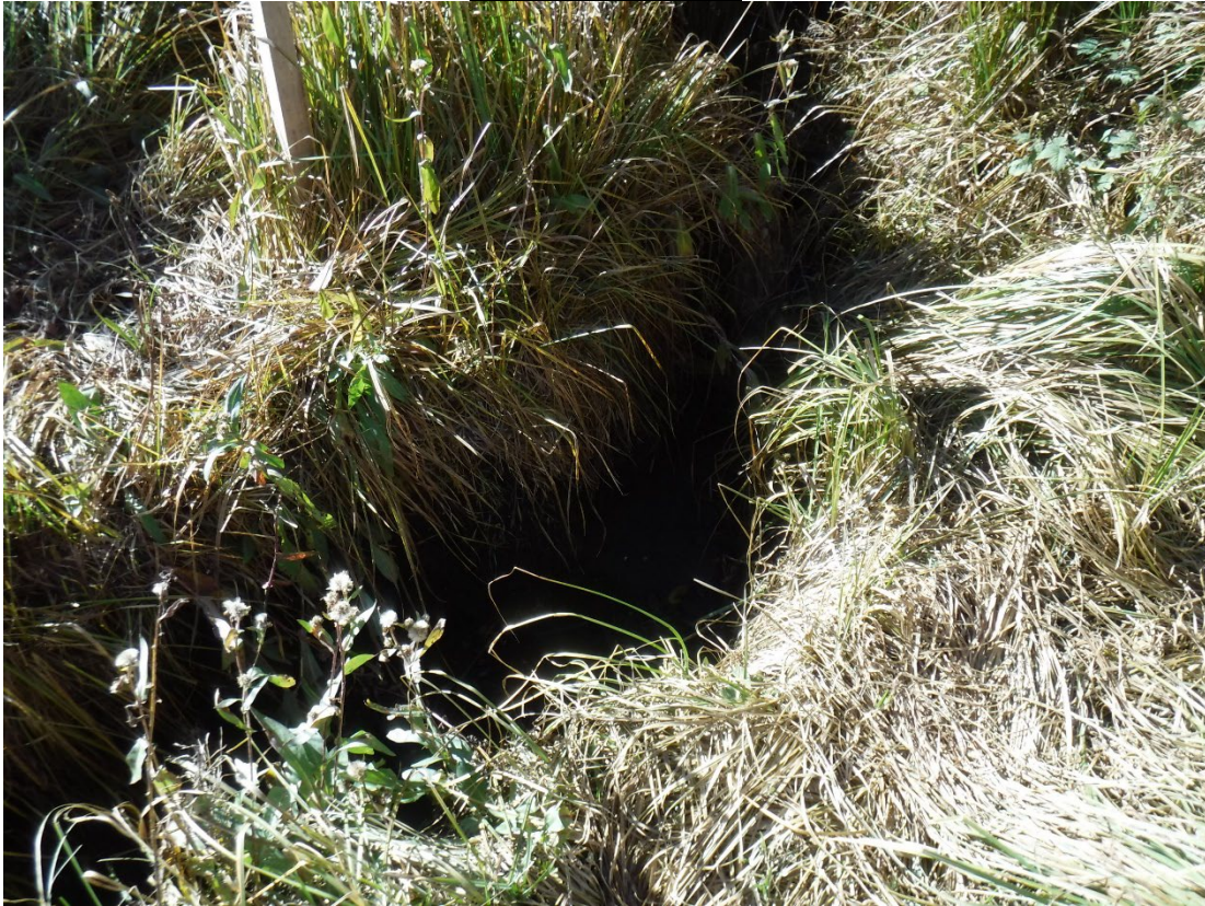
Photo 1: Upgradient surface water sampling location, adjacent to Caribou Road, dry