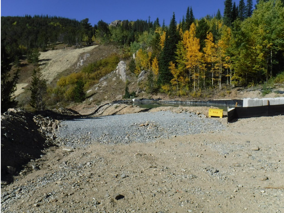
Photo 11: Rock check dam to aid in surface erosion control near Pond 3c