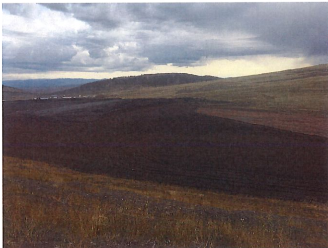
September 29, 2022- Expansion Area from Areas 2, 3 and 4