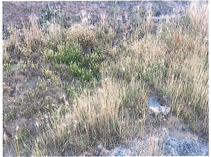
September 29, 2022-Seepage Area