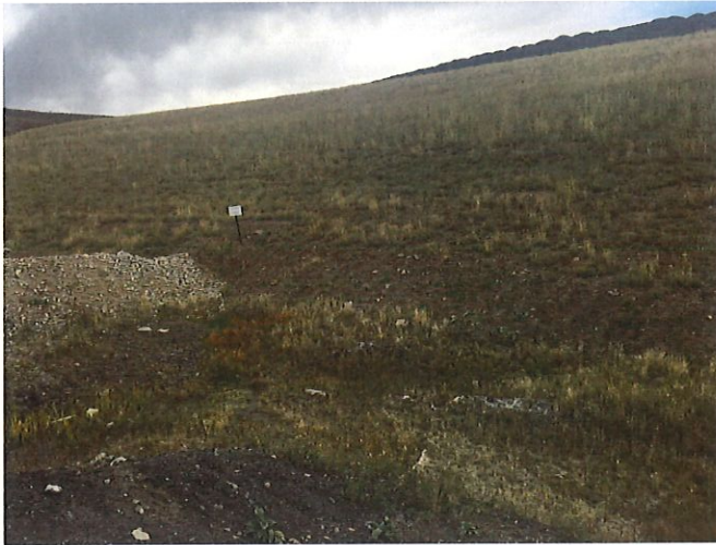
September 29, 2022-Drain Outlet and Seepage Area