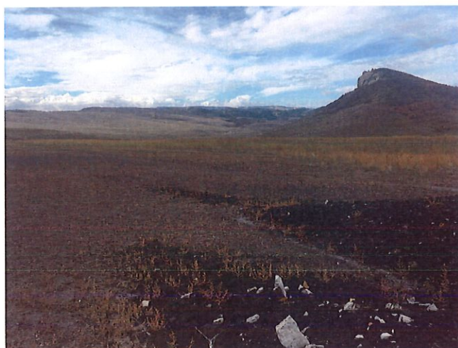
September 29, 2022- Areas 2, 3 and 4