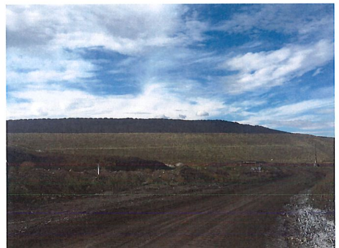
September 29, 2022- Benches on East Side of Refuse Pile