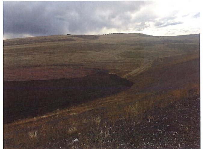
September 29, 2022- SW End of Drain in Expansion Area