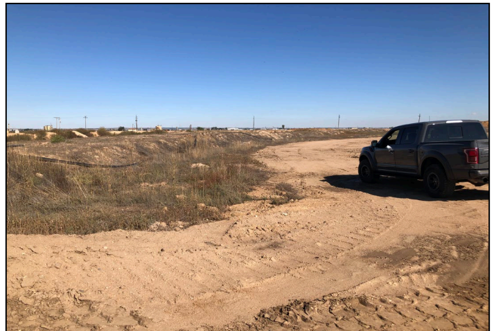
Photo 4 – Area in NW corner of existing slurry wall that will be mined when existing gas and oil features are removed.