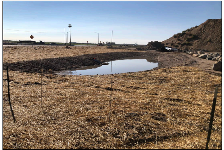
Photo 2 – New storm water/settling pond located near improved site entrance.