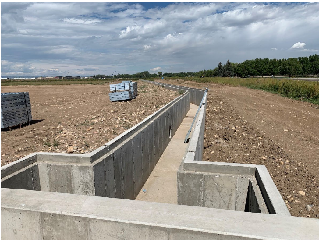
Photo 2 – The new Boxelder ditch channel, facing north by the Weitzel St. and CR 5 intersection