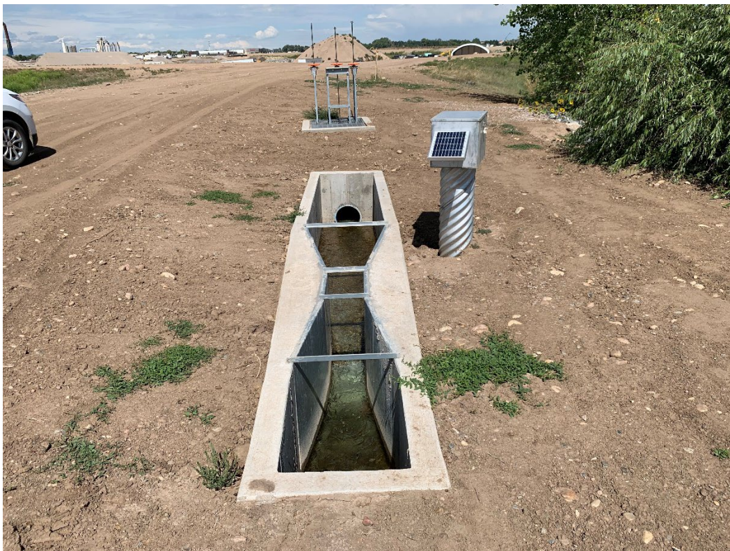
Photo 6 – Weir and valve box (behind weir) installed between unlined ponds