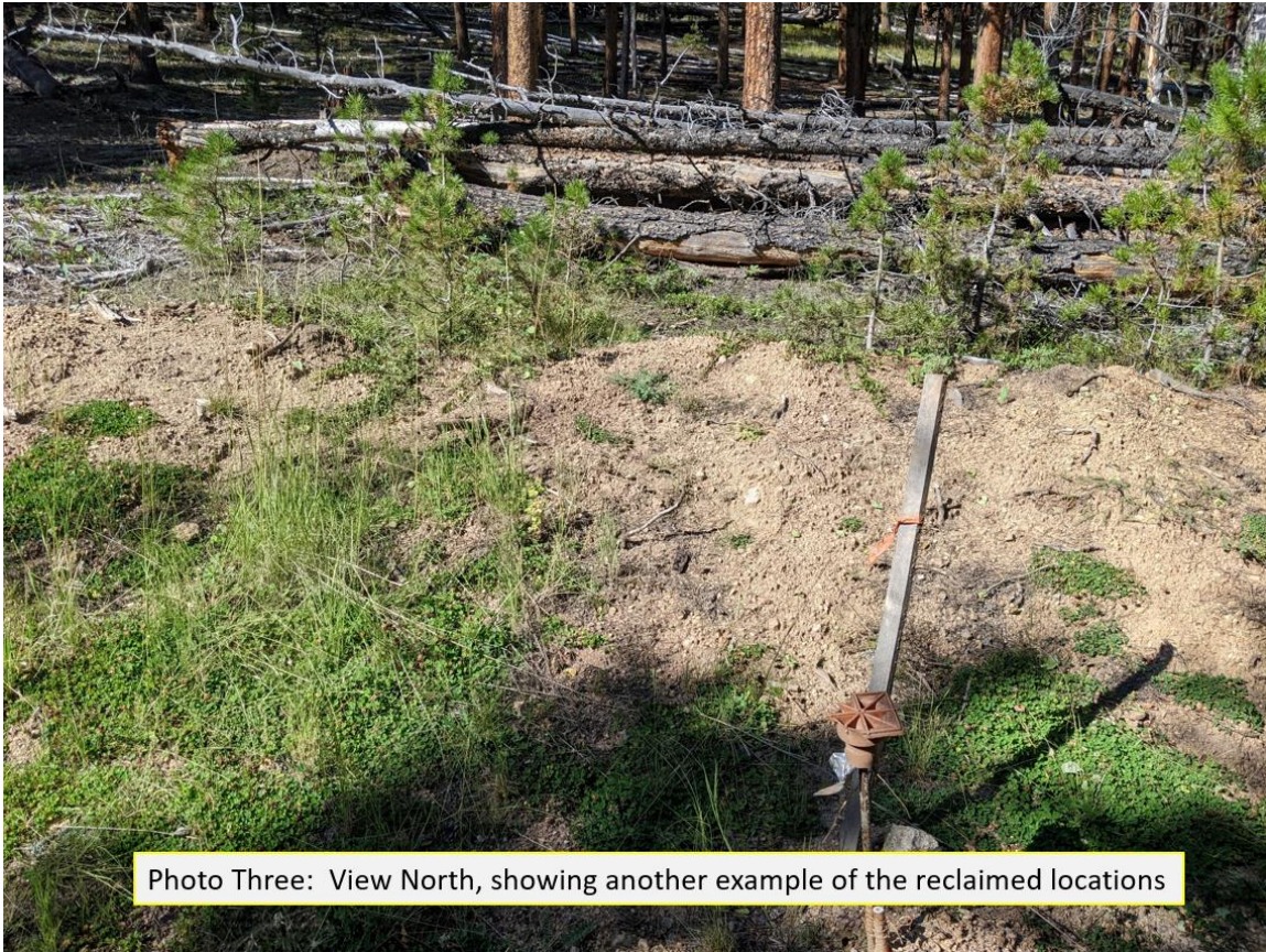
Photo Three: View North, showing another example of the reclaimed locations