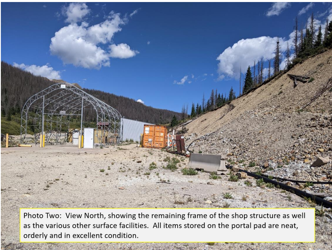
Photo Two: View North, showing the remaining frame of the shop structure as well as the various other surface facilities. All items stored on the portal pad are neat, orderly and in excellent condition.