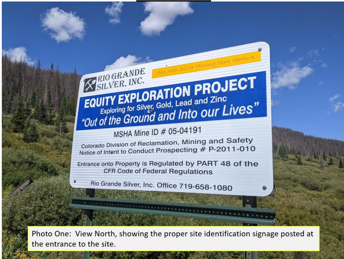
Photo One: View North, showing the proper site identification signage posted at the entrance to the site.