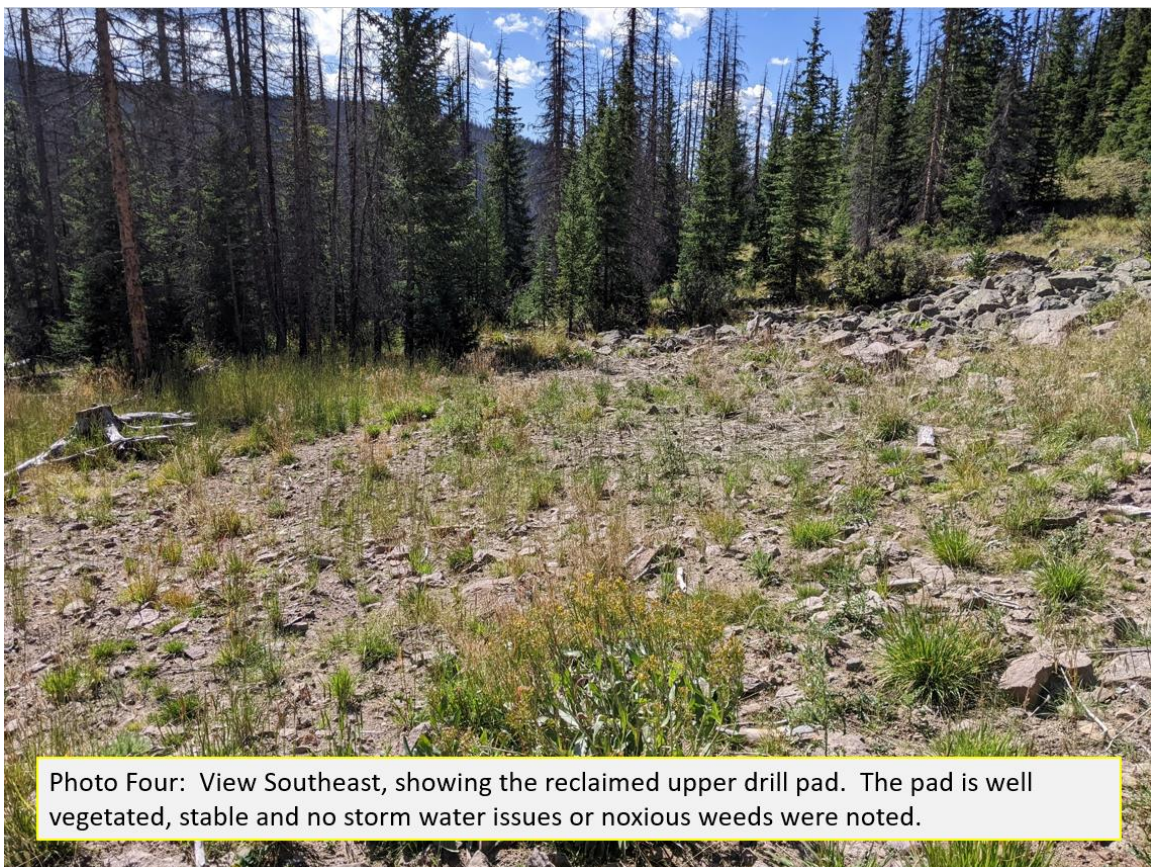
Photo Four: View Southeast, showing the reclaimed upper drill pad. The pad is well vegetated, stable and no storm water issues or noxious weeds were noted.