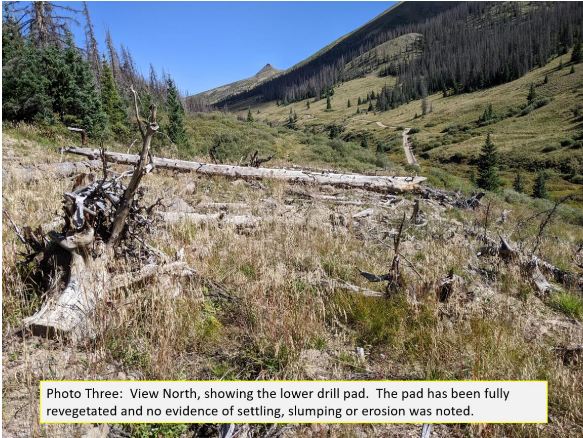
Photo Three: View North, showing the lower drill pad. The pad has been fully revegetated and no evidence of settling, slumping or erosion was noted.