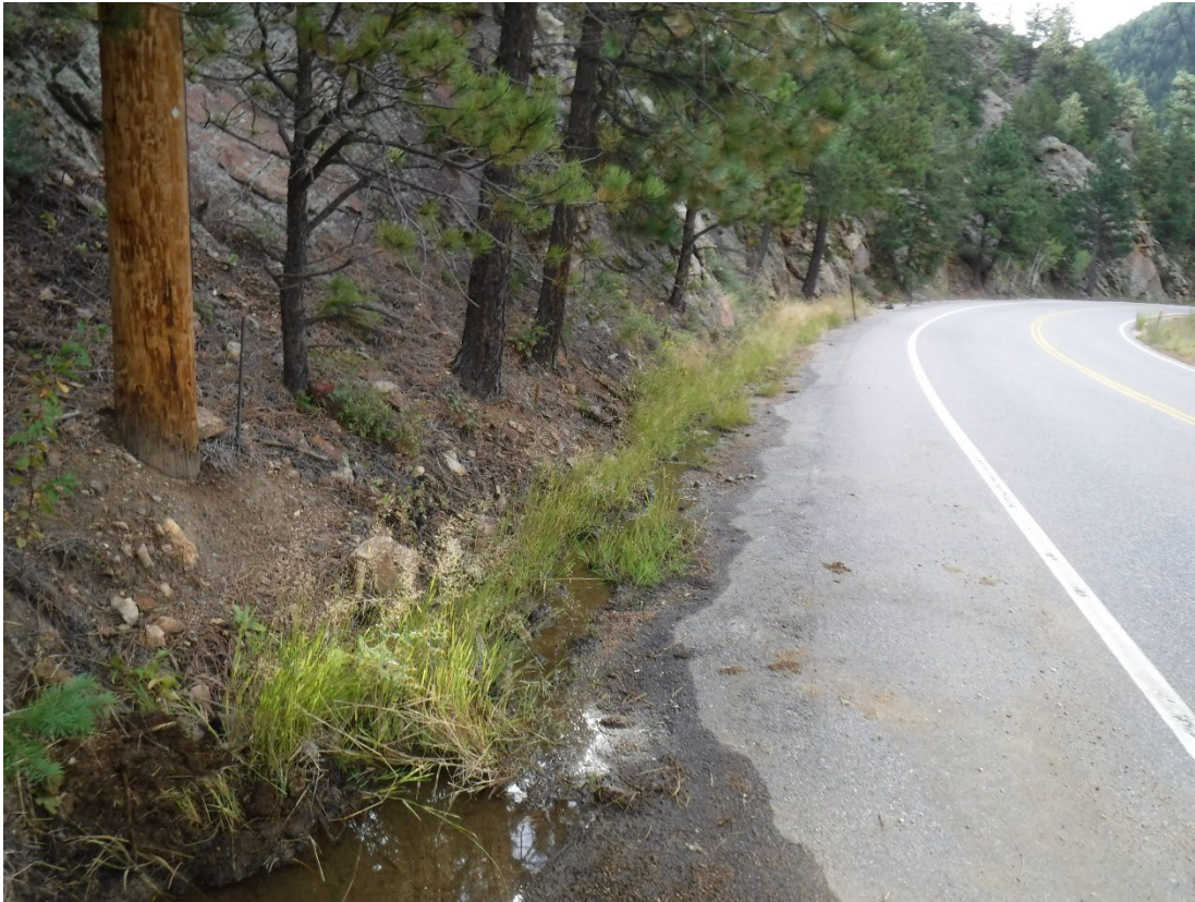
Photo 13: Surface water discharge down gradient of portal, water dissipates into vegetation in ditch