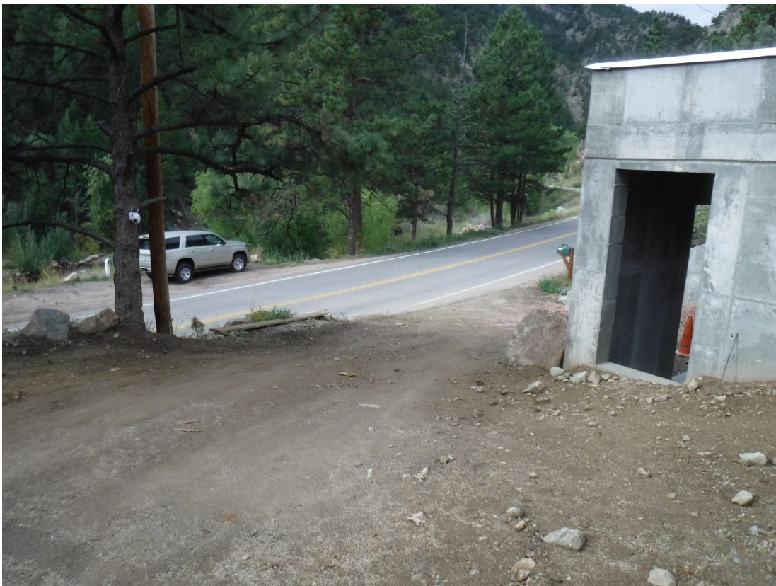
Photo 4: USFS 287.1 looking from the house back towards James Canyon Drive