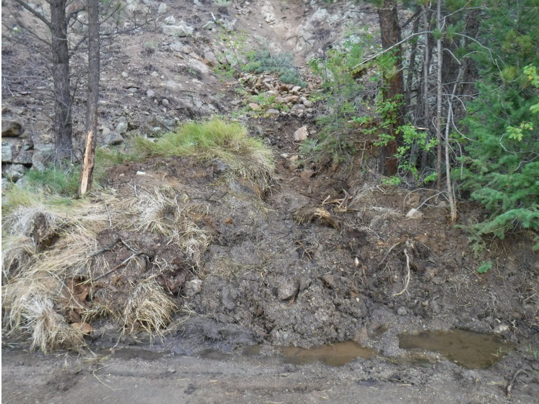
Photo 11: East Adit, Portal #6, looking north from James Canyon Drive