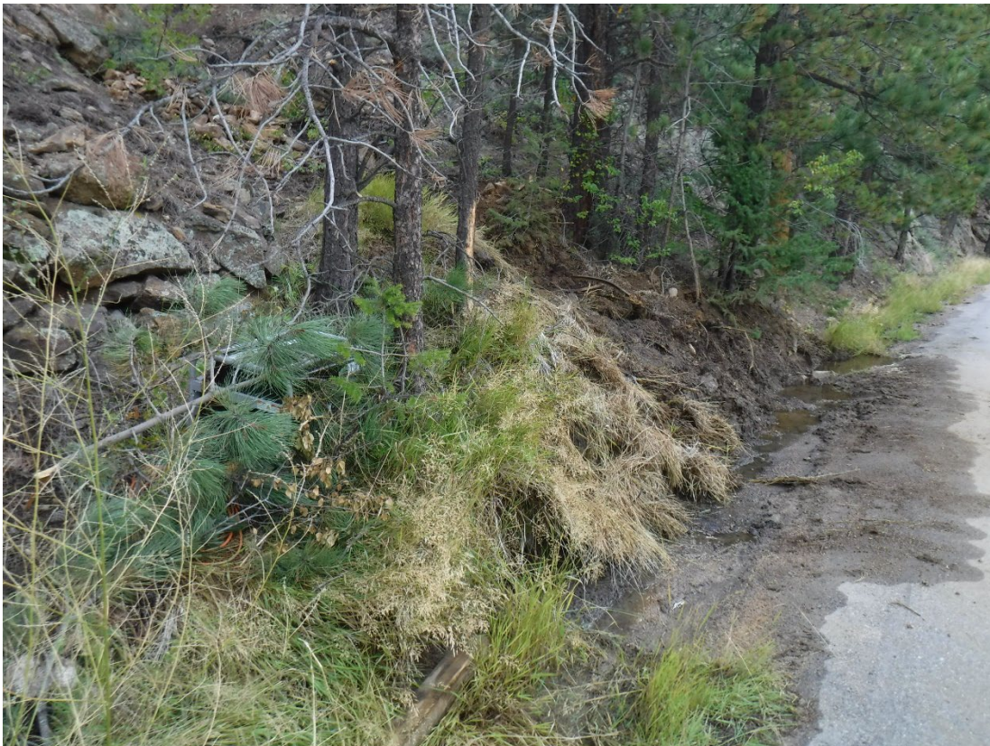
Photo 10: East Adit, Portal #6, looking east along James Canyon Drive