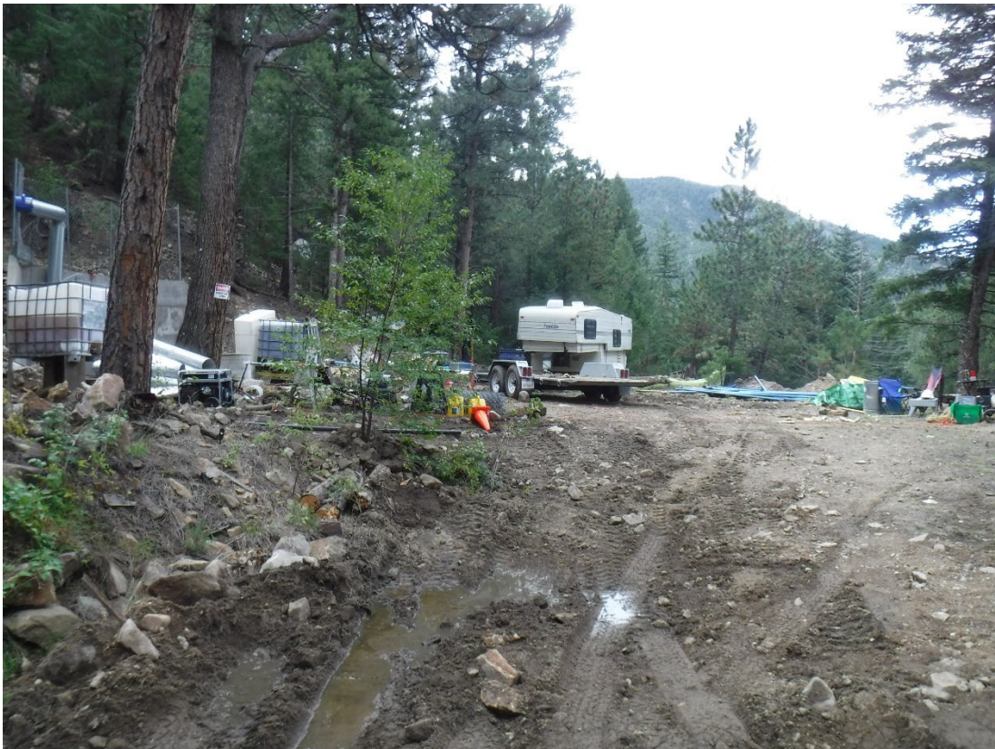
Photo 22: Equipment laydown area adjacent to the Rip Van Dam portal to the right of the picture is where the shed is located