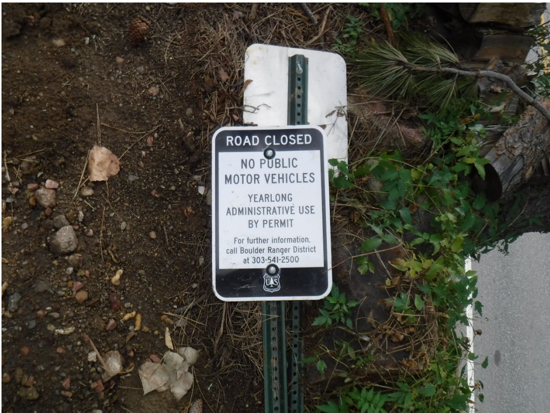
Photo 2: Signage on the ground adjacent to garage under construction