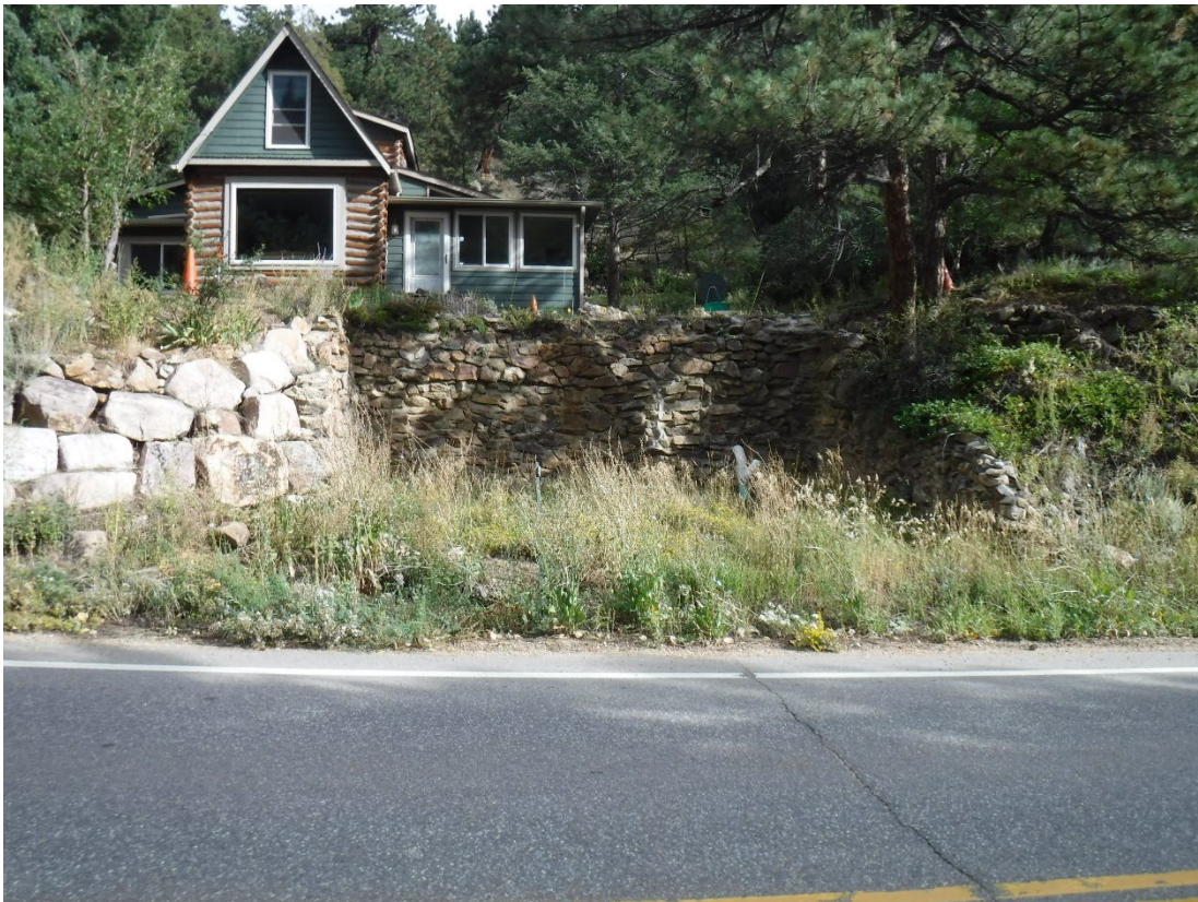
Photo 6: Looking from James Canyon Drive at USFS 287.1 as it passes in front of house