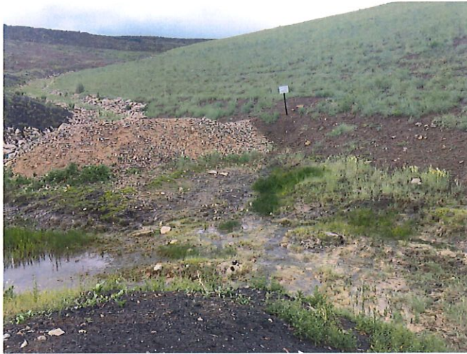
June 30, 2022-Drain Outlet and Seepage Area