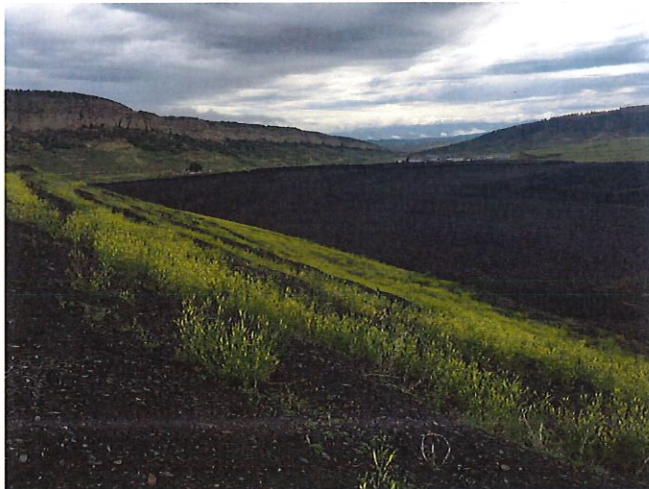
June 30, 2022- Expansion Area from Areas 2, 3 and 4