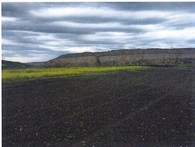
June 30, 2022- Areas 2, 3 and 4