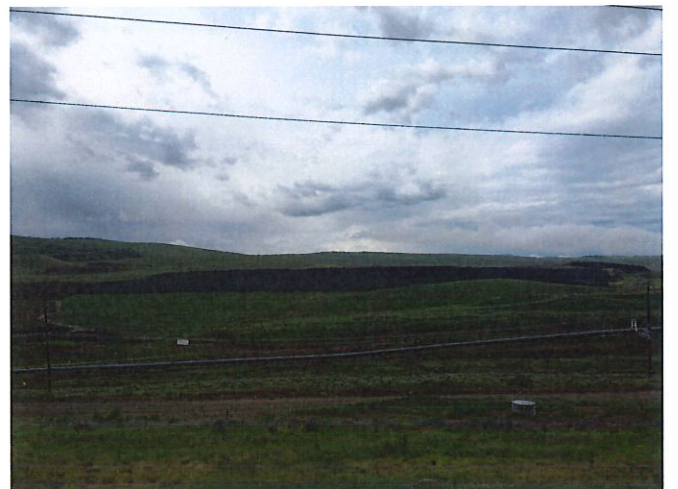
June 30, 2022- Benches on East Side of Refuse Pile