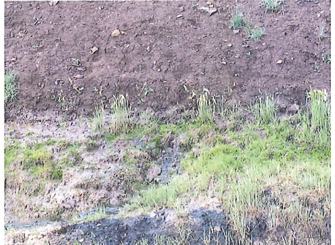
June 30, 2022-Seepage Area