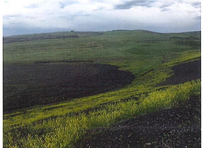
June 30, 2022- SW End of Drain in Expansion Area