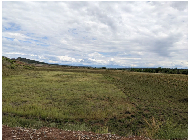
Phase D Area