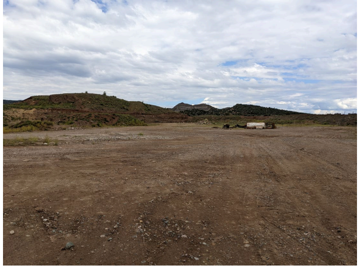
Phase C Area