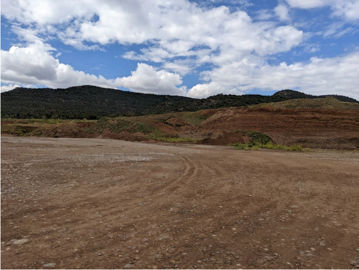
Phase C Area