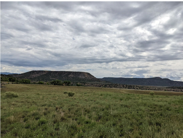
Phase D Area