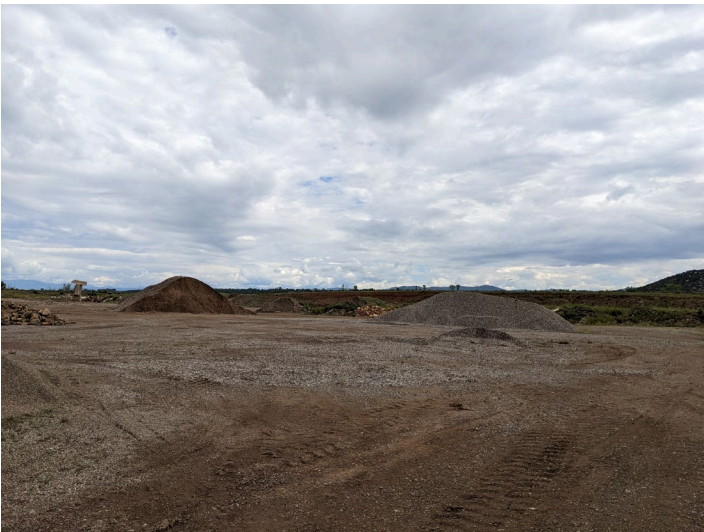
Phase C Area