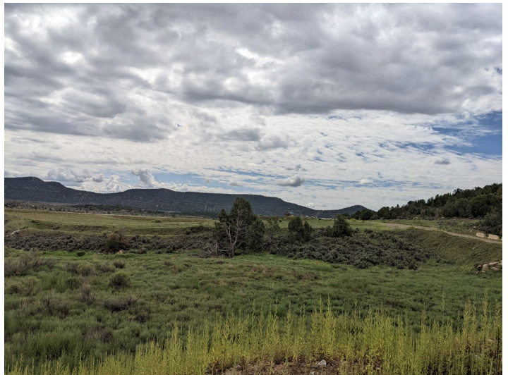
Phase D Area