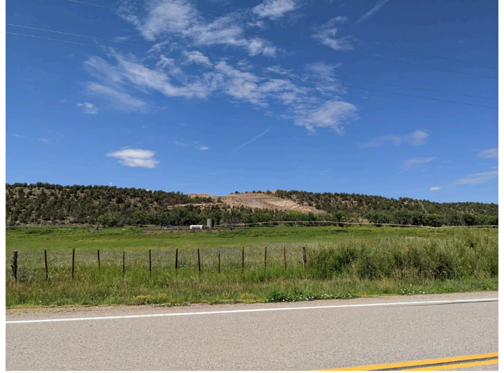
Construction of access road underway, as viewed from CR 213

Nathan Barton Crossfire Aggregate Services LLC PO Box 3471 Ignacio, SD 57709