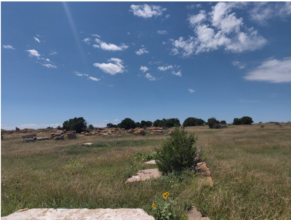
View of the site from the northeast corner looking west