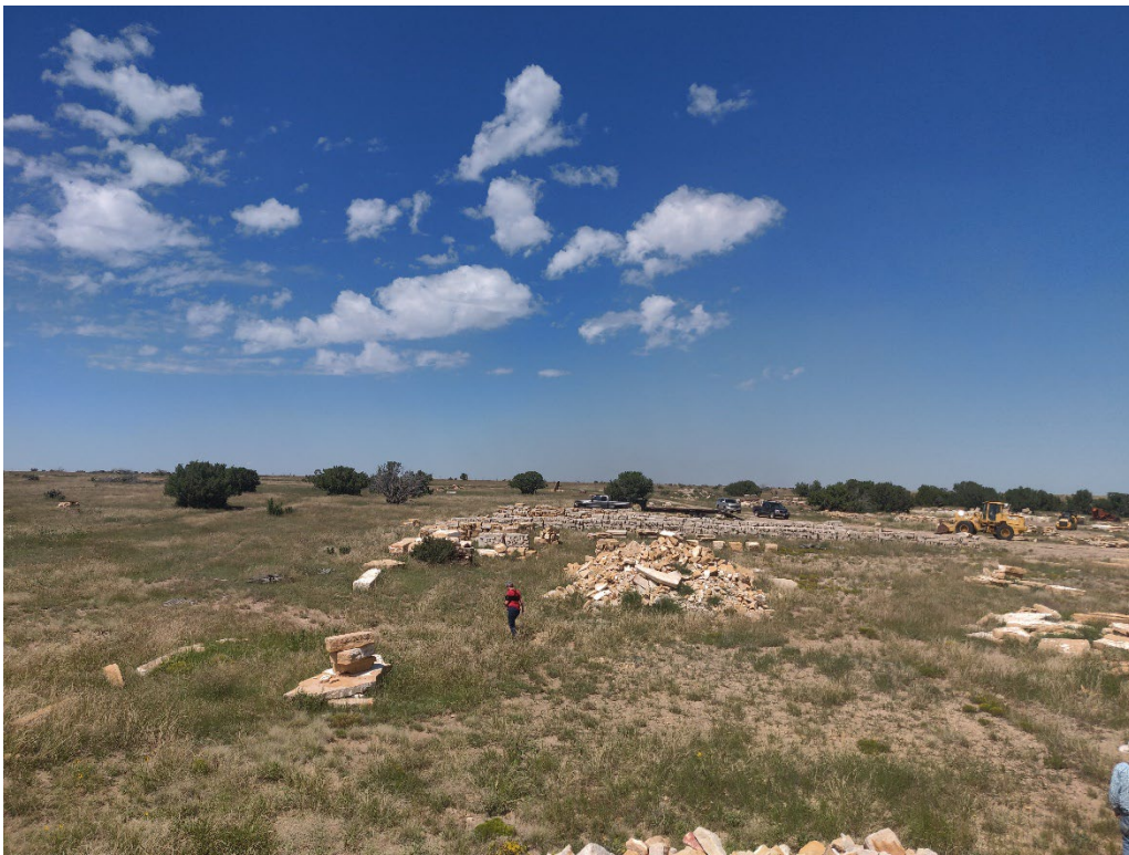
View of the site from the southwest corner looking north