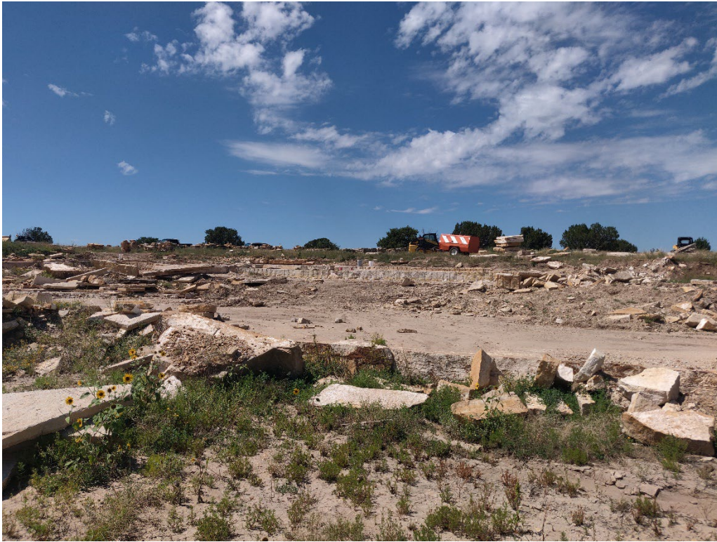
View of the active quarry area