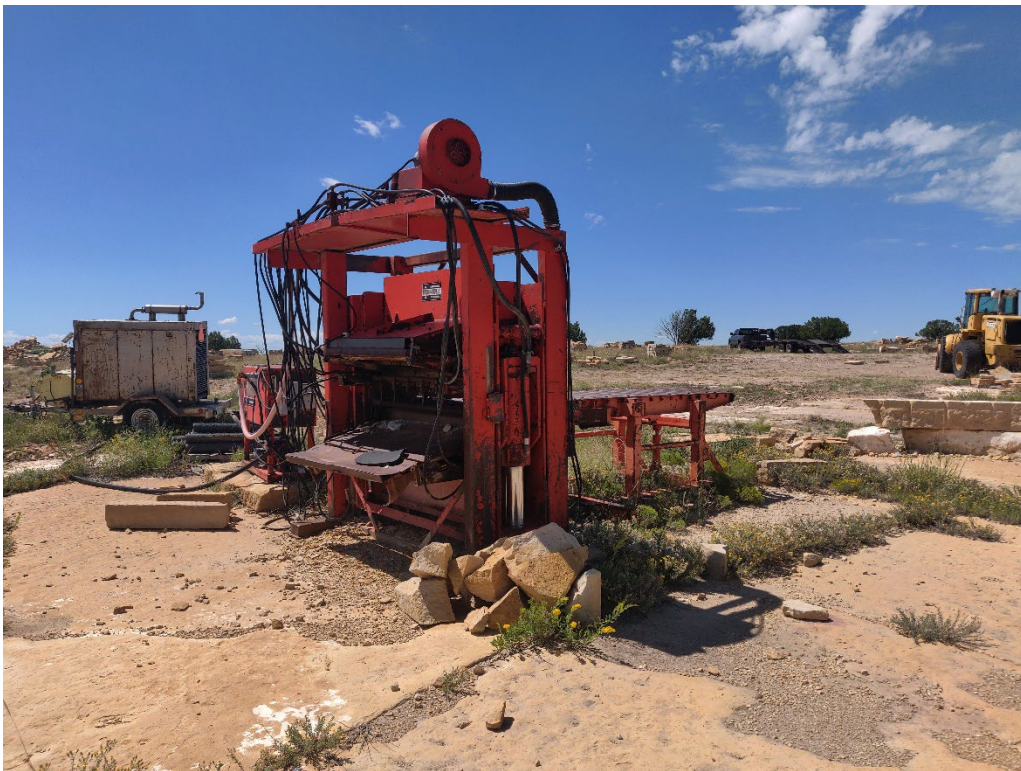
View of the stone cutter