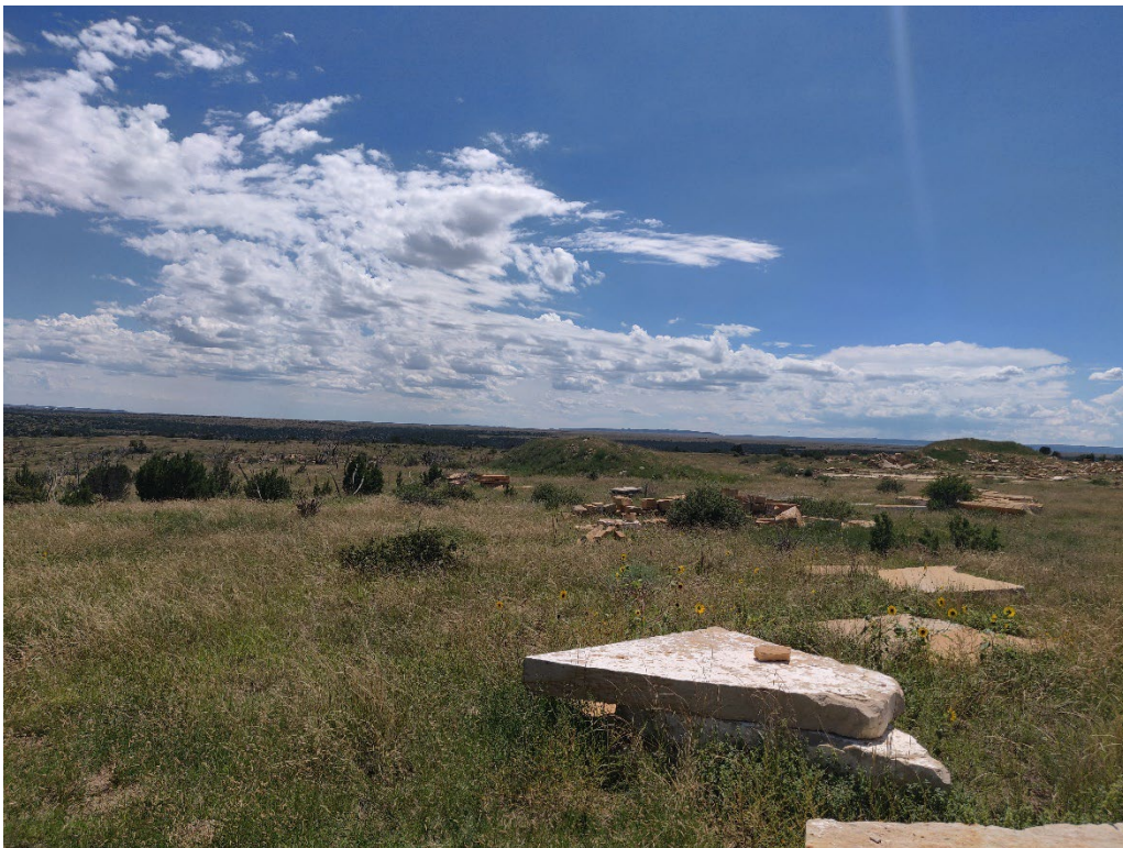
View of the site from the northeast corner looking south