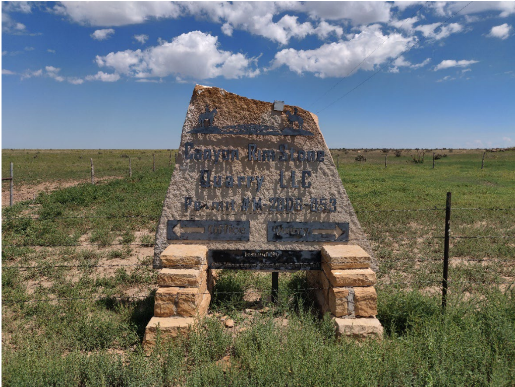
Canyon Rim Quarry mine sign