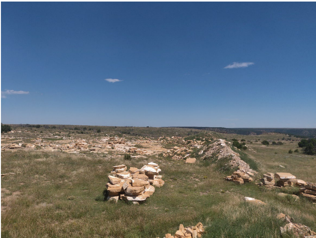
View of the site from the southwest corner looking east