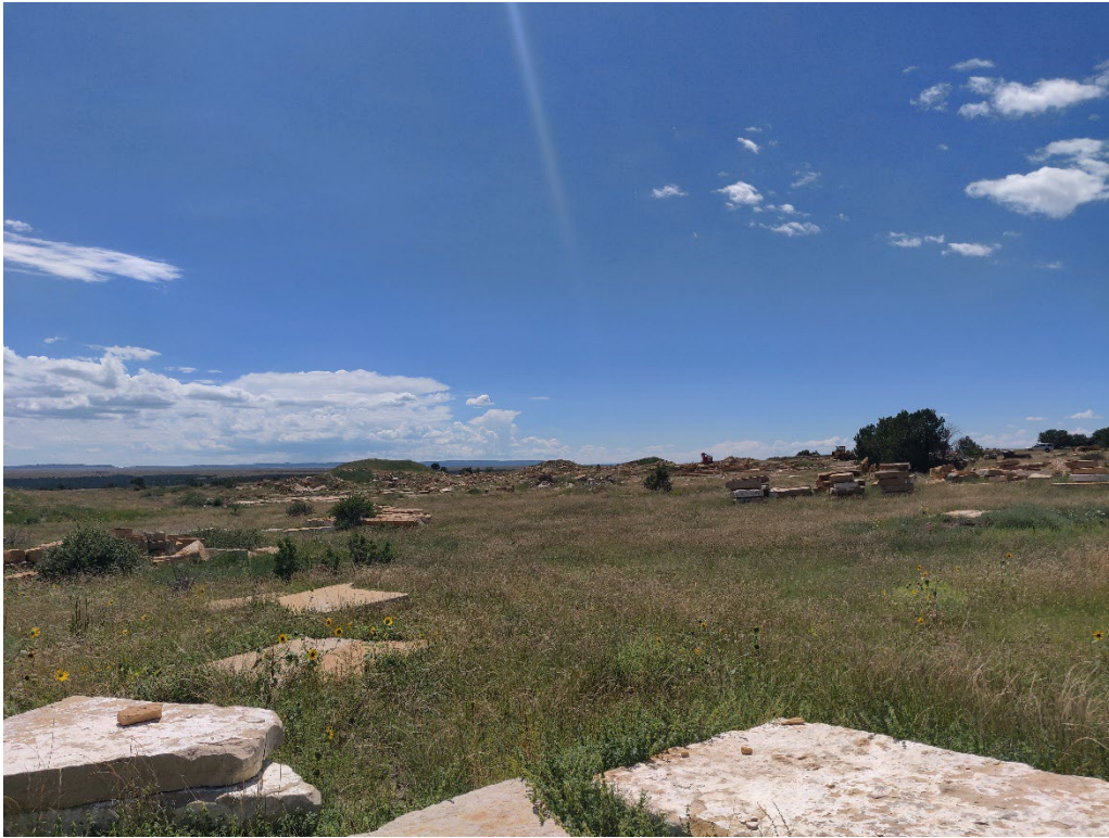
View of the site from the northeast corner looking southwest