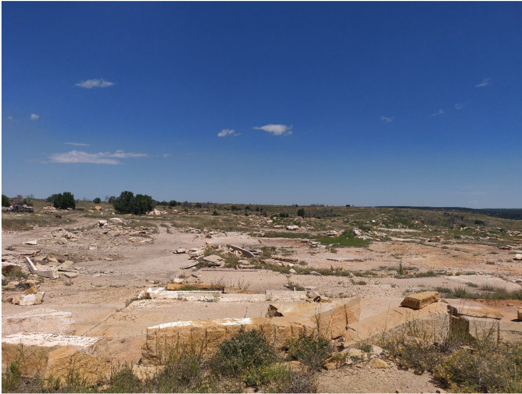
View of the active quarry area from the processing area looking east