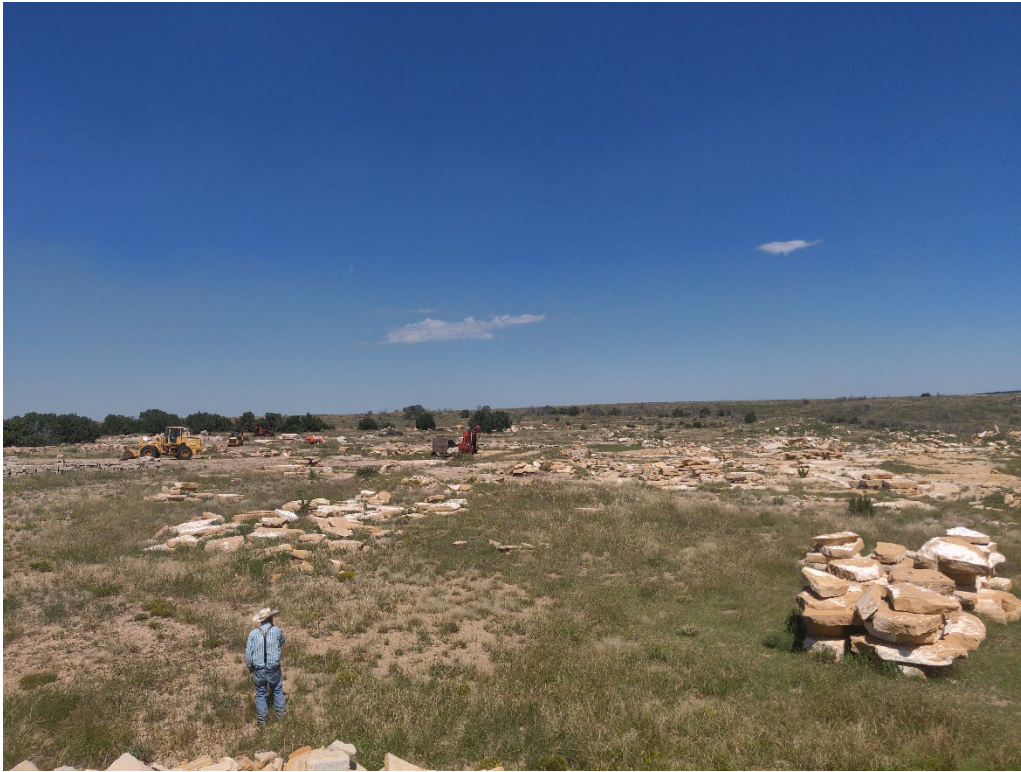
View of the site from the southwest corner looking northeast